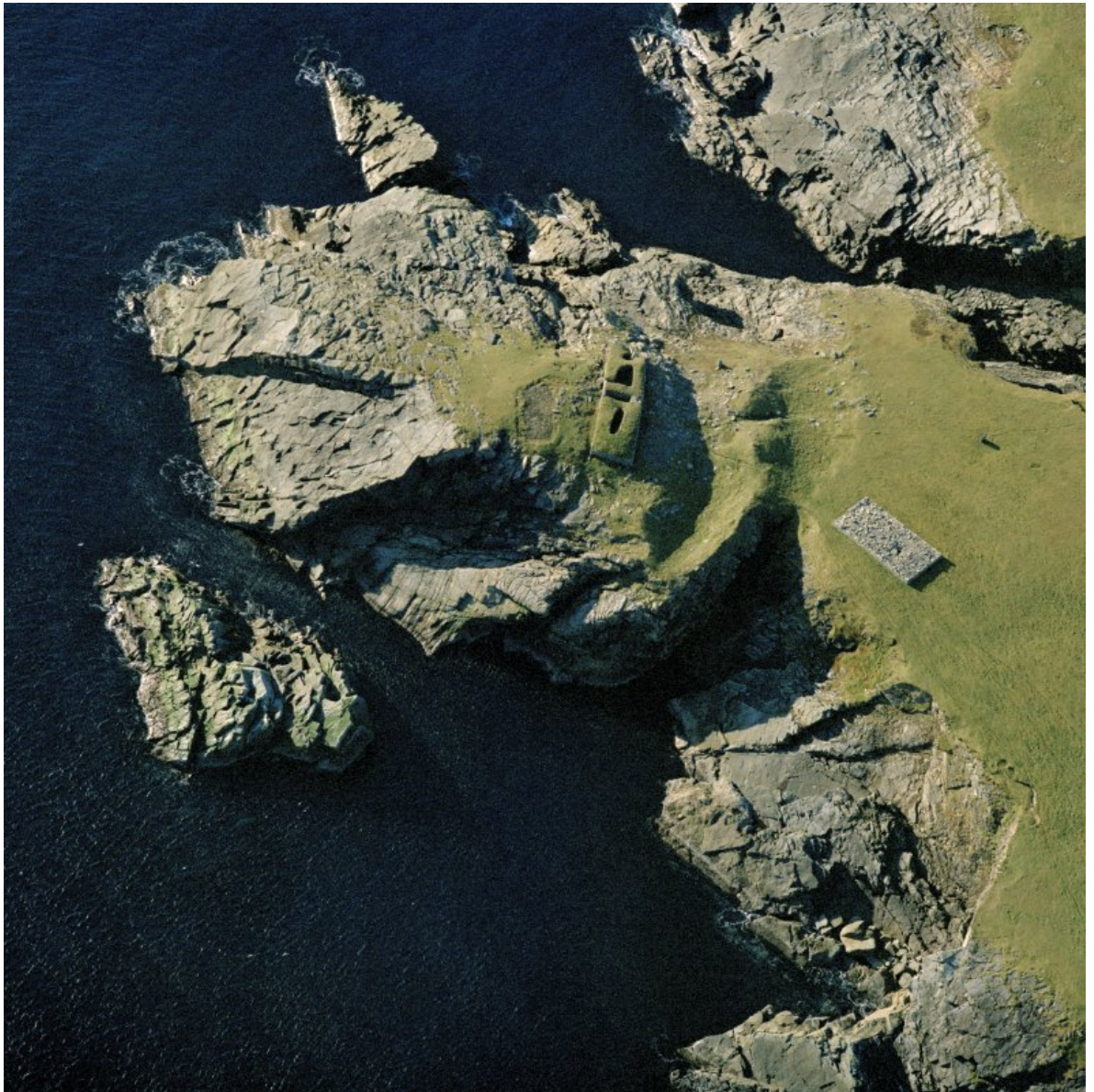
Above: aerial view, south towards top of frame: