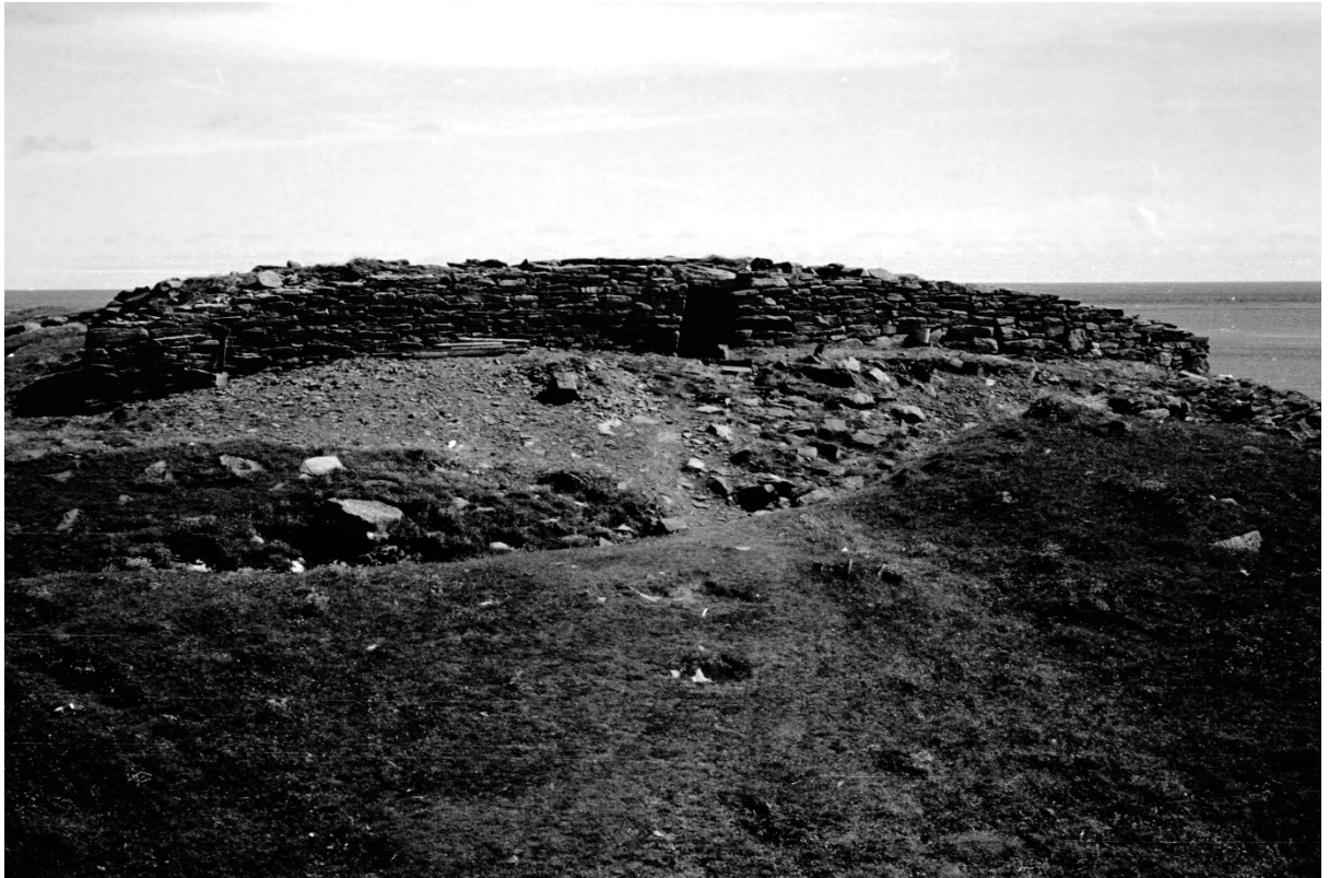
Above: 1971 photo by RG Lamb, showing site soon after stone clearance and consolidation: