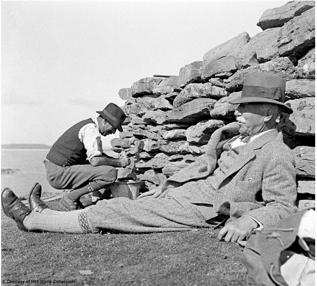
Photograph taken during 1935 excavations: AO Curle (front) and AT Curle (beyond)