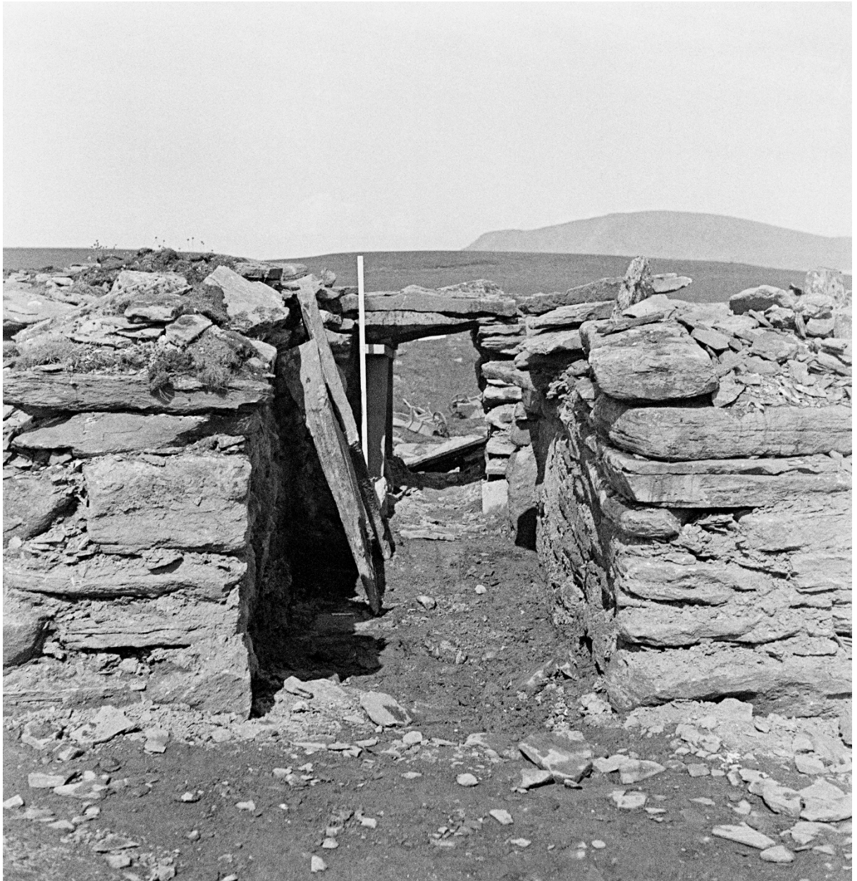
Above: Photograph taken during 1935 excavations: entrance passage looking out: