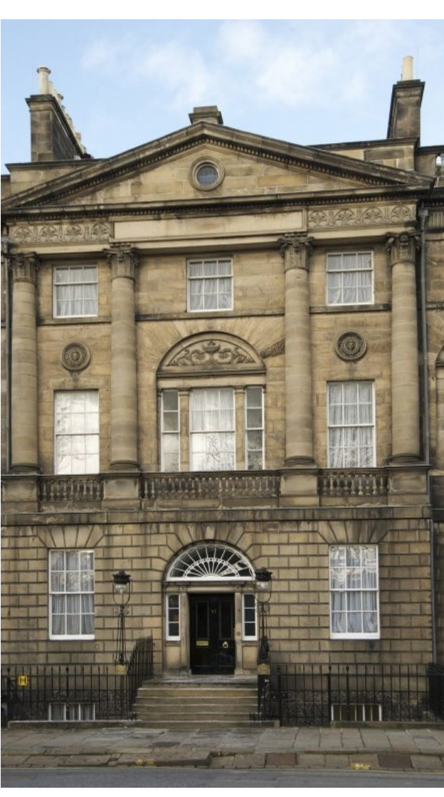
Edinburgh New Town