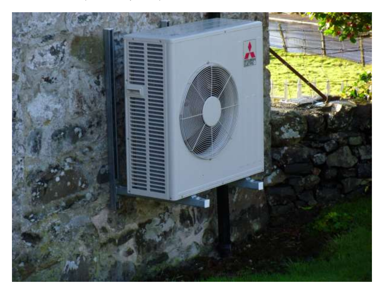
Fig. 8: The external fan unit of the ASHP on the NW corner of the church

The external unit was located on the NW corner of the church where it was felt to be the least visible place (Fig. 8). The installation, testing and commissioning of all the devices was completed early in September 2014.