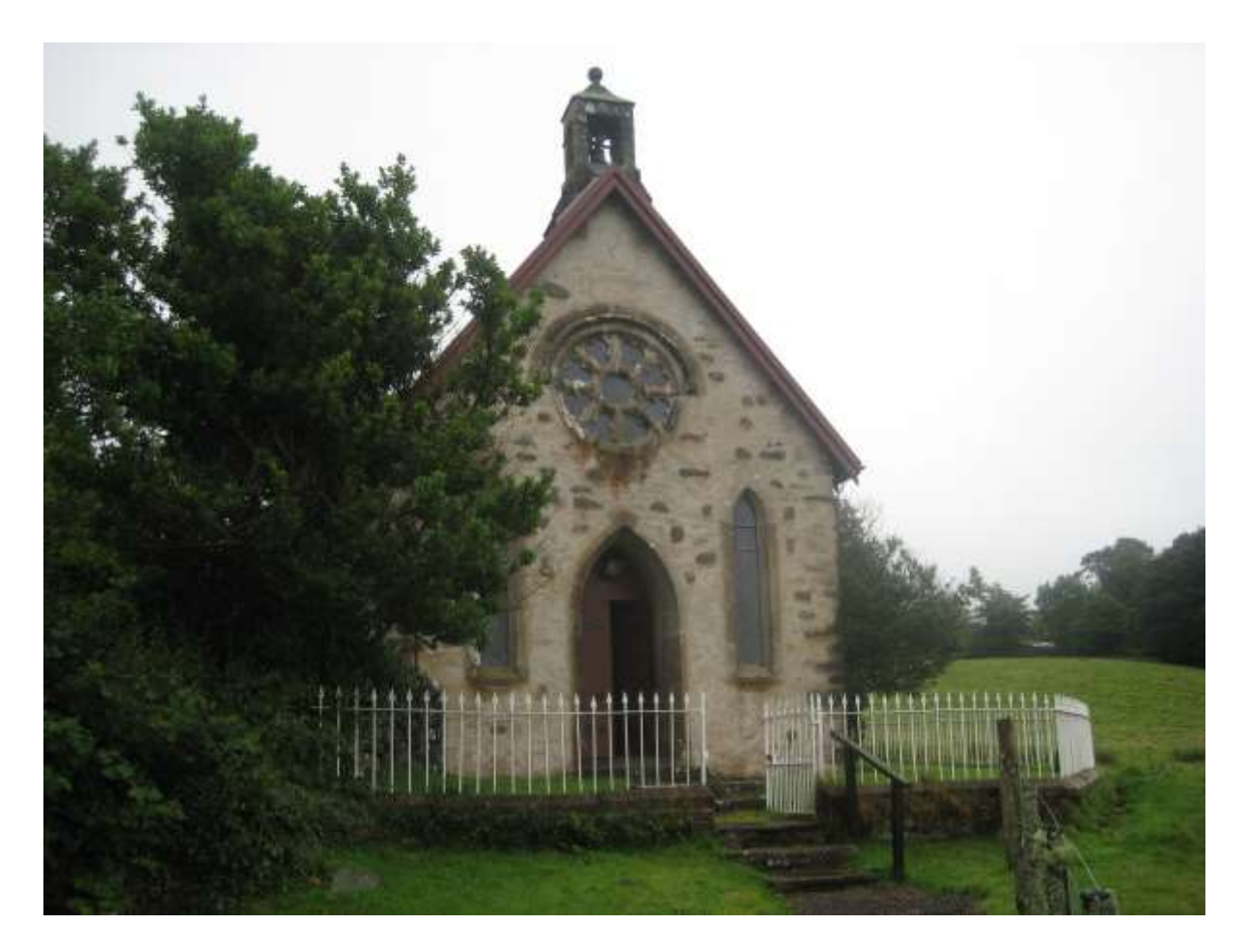
Fig. 1: Kilmelford Church viewed from the West; the lime mortar repairs to this elevation were an important first stage in the building upgrade

Original stained and shellac finished pews line the nave and a mezzanine floor at the West end gives additional seating. The existing heating consisted of a series of 'greenhouse heater' type electric tubes located under each pew, supplemented by four wall mounted domestic electric convectors. These did not give out sufficient heat for services, and proved expensive to run, not least because the inadequate capacity of the system required long periods of pre-heating. As a consequence the inside of the church always felt damp and rarely warm. A significant factor in the poor thermal comfort is the exposed location of the church (the prevailing wind from the south west brings damp air off the sea 700 metres away), and the position of the main entrance on the west gable, gives rise to significant draughts and loss of heat when parishioners enter and leave the building.