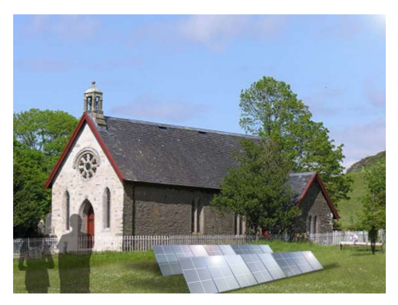
Fig. 11 Proposed array of solar panels