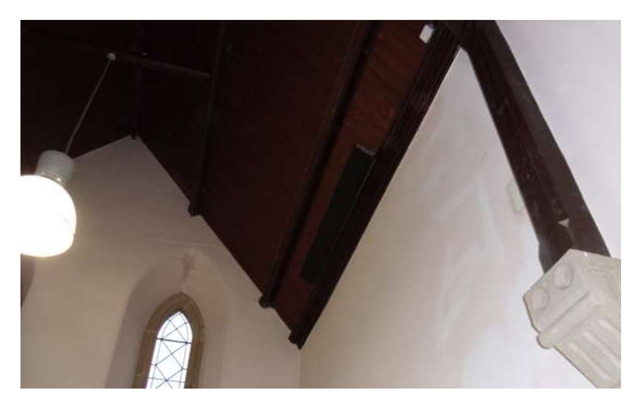
Fig. 4: The radiant panels visible middle right, just above wallhead level

Hot Heating in Glasgow. Competitive tenders other aspects of the project works were issued to local electrical contractors. The radiant heaters, air source heat pump, and electrical distribution changes were installed over the summer of 2014.