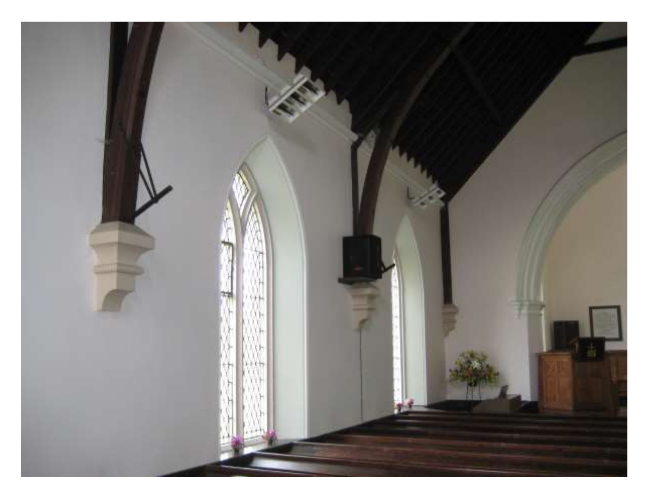
Fig. 3: Hobkirk Church in the Scottish Borders is heated by radiant panels at cornice level

Long established dissatisfaction with the existing heating system led the congregation mandated Fabric Convenor to investigate alternative options. Dialogue with Historic Scotland confirmed the project objectives and established an aspiration to investigate the use of radiant heat as the sole means of delivering thermal comfort and low level background heating. This has been used for some time to heat larger spaces and many churches in Scotland are heated in this way. While all congregations are different, some have found this option cost effective. For example, Hobkirk Church in the Scottish Borders (Fig. 3) has used radiant heat for some time; annual heating costs are in the region of £1,500 per annum.