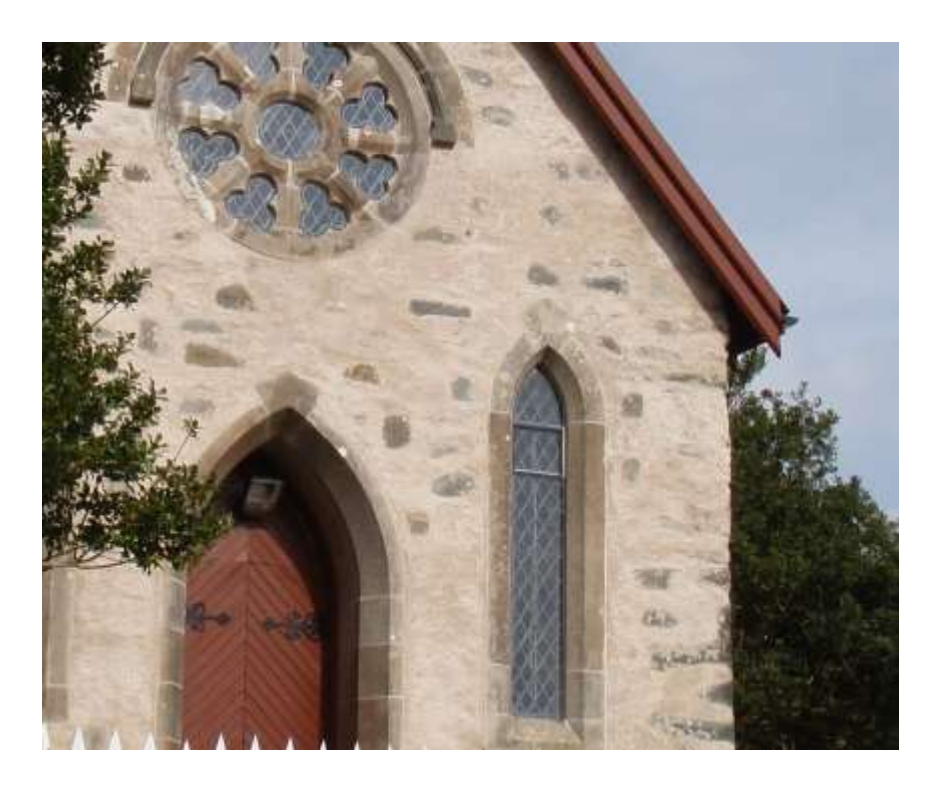
Fig. 2: Detail of the lime pointing on the west gable; this resulted in much drier masonry

masonry works of 2009 had assisted in reducing water ingress, de-humidifiers were still needed.