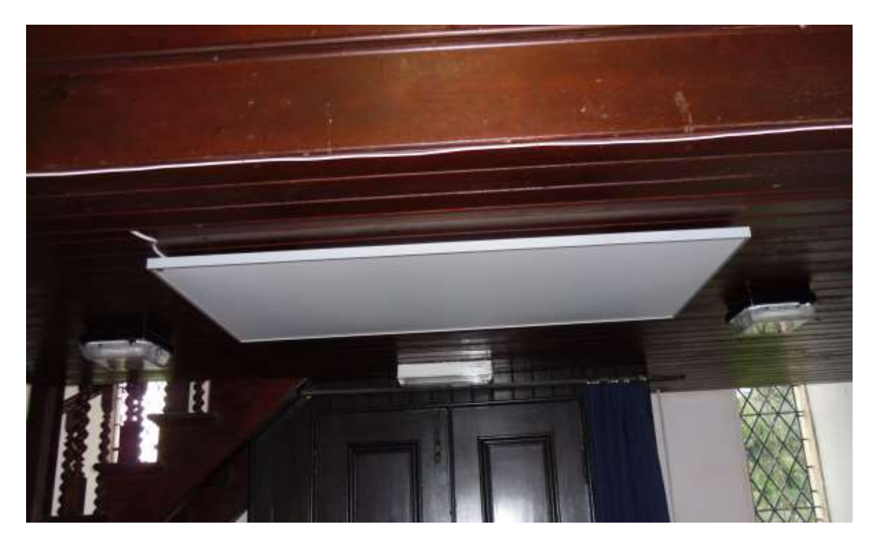
Fig. 6: The radiant panels underneath the mezzanine layer

An Oban based electrical contractor with the supplier of the heaters to ensure that the church had a local contact. The siting of the ASHP indoor fan unit was discussed, and a compromise was reached. It was placed at the top of the stairs, with the aim of providing a good air recirculation path up the small spiral staircase (Fig. 7). The pipes and cables were routed under the floor of the mezzanine layer.