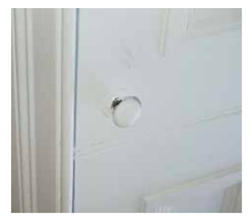
Fig. 6 Both leaves of the shutter, (outer and secondary) folded and concealed within recessed housing.