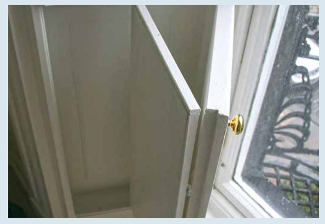
Fig. 5 Shutter divided horizontally into two separate hinged sections, designed to allow light into the room whilst maintaining a level of privacy.

The rails and the stiles are fastened with traditional mortice and tenon joints. The panel between the stiles and rails are filled with thinner recessed panels. Earlier shutters typically had flush mouldings at the join between the stiles and recessed panel, and later 19th century ones had raised mouldings.