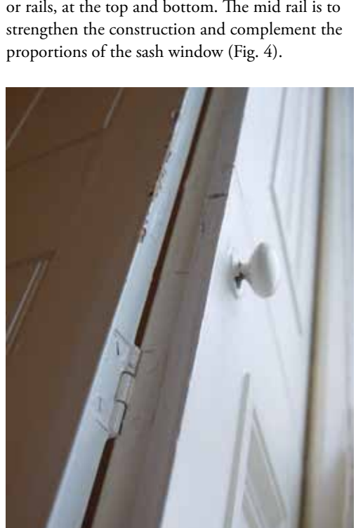
Fig. 3 Shutter half open showing the outer panelled leaf and the middle leaf, with rebated joints to reduce light penetration when closed.

Each leaf consists of vertical timbers or stiles which extend its height with horizontal pieces, or rails, at the top and bottom. The mid rail is to