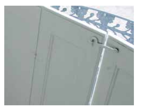
Fig. 8 Small latch used to hold shutters in the closed position at the stiles.