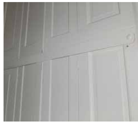
Fig. 7 Iron stay bar in position, spanning the width of the window opening.