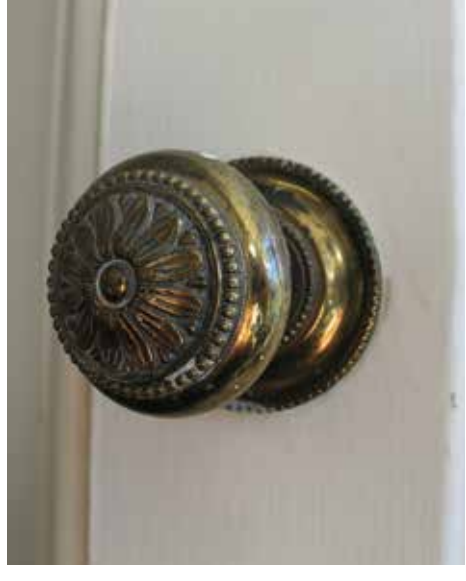
Fig. 11 Brass shutter knob fitted to shutter's outer leaf.