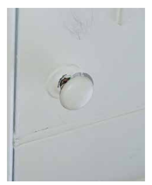
Fig. 10 Painted timber shutter knob fitted to shutter's outer leaf.

Shutters that survive out of use have often become inoperable due to years of overpainting, sealing the shutters into the case. This may be simply remedied by the careful use of a craft knife, cutting through the paint at the shutter edges and gently prising it open. If this is not successful it may be that a previous owner has nailed or screwed the shutters to their housing; close inspection should reveal if this is the case. Once again great care should be taken by gently unscrewing or slowly withdrawing any existing nails, making sure not to damage surrounding timberwork. It should be noted that not all moulded shutters were designed to be used; by the late 19th century in some buildings they were simply decorative panels. The absence of hinges will quickly show whether they are operable.