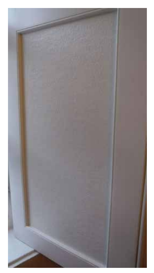
Fig. 12 Newly instated insulated timber shutters.