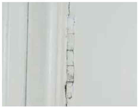
Fig. 9 Butt-hinge connection between the shutter and the shutter case.