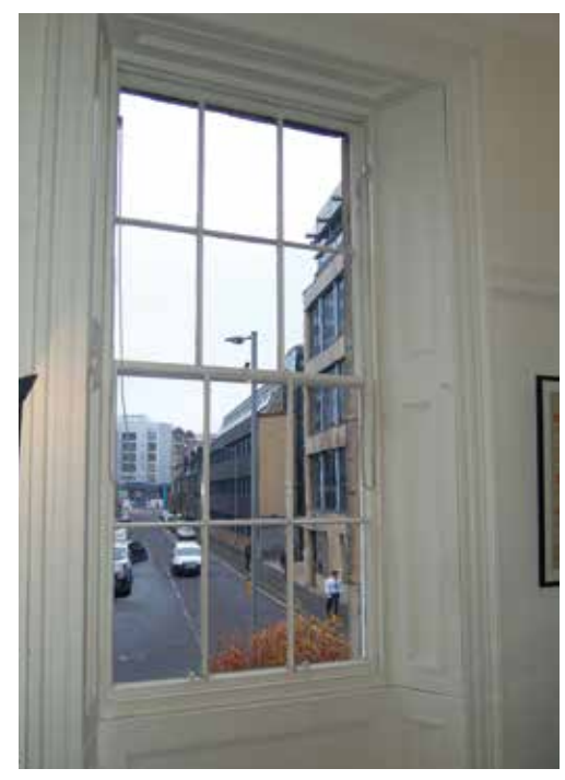
Fig. 4 A pair of window shutters in the closed position. Note the mid rail is placed to match the centre of the sash window.