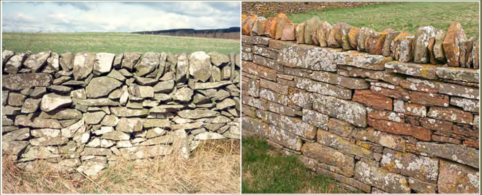
Fig. 1: Two regional variations showing how local geology influences walling style.