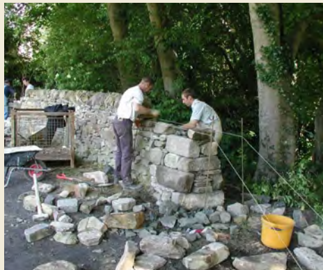
Fig. 9: Rebuilding a section of a dry stone wall - note the construction of the wall-head.

at least once a year, and the following maintenance tasks carried out: