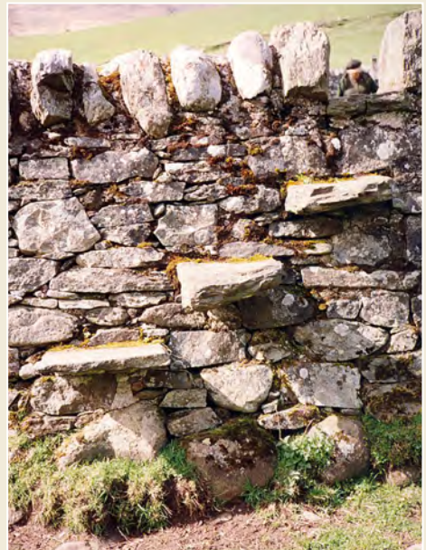
Fig. 7: Stiles built into dry stone wall.