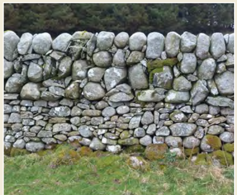
Fig. 4: A galloway dyke.