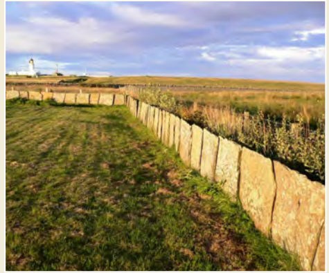
Fig. 5: Caithness flag fence.

above the course below, except for through stones. This helps to maintain an A-shape in the cross section, called 'the batter' (Fig. 6).