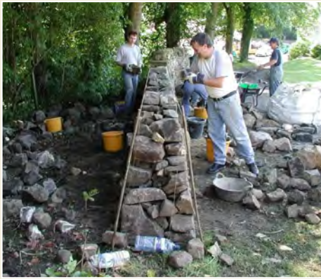
Fig. 6: Rebuilding a section of a dry stone wall - note the use of a batter frame.