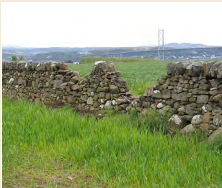
Fig. 8: Even where a lack of maintenance has led to collapse, repair is always possible and can utilise much of the fallen material.

stone walls is deliberate destruction. This can be due to the enlargement of fields, the cost of upkeep, and changes of use from pasture to arable land.