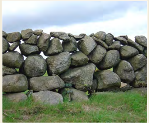
Fig.3: Single wall or boulder dyke.