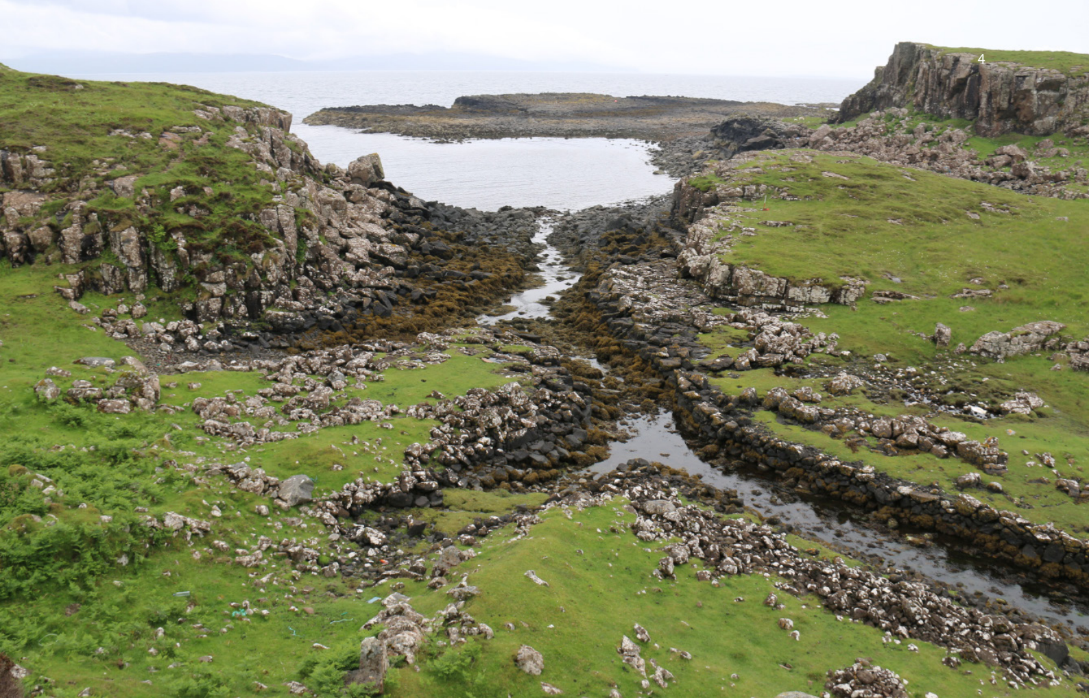
Above: The remains of a medieval canal leading into Loch na h-Airde on the Rubh'an Dunain peninsula, Skye. This site became a scheduled monument in 2017. View from above the canal towards the sea ( SM13676 ). Below, Cables Wynd House, Leith is among the best of Scotland's post-war mass urban housing schemes. It was listed at Category A in 2017 ( LB52403 ), CC BY-SA 2.0 Tom Parnell.