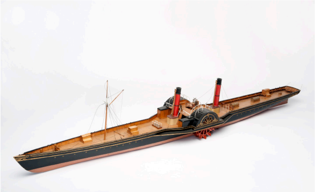
Above: The wreck of the Clydebuilt paddle steamer Iona I, Firth of Clyde, was designated as a Historic Marine Protected Area in 2016. It is of national importance as the well-preserved wreck of a Clydebuilt 19th-century passenger paddle steamer purchased by Confederate agents to run the blockade of Southern ports during the American Civil War (HMPA 8), © CSG CIC Glasgow Museums Collection.