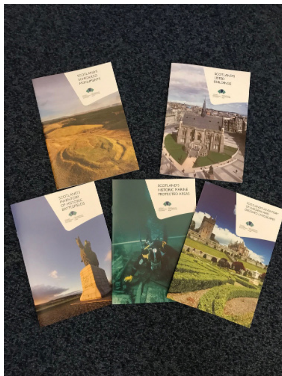
Below: Our updated leaflets about listing, scheduling, the inventory of gardens and designed landscapes, the inventory of historic battlefields, and historic marine protected areas are available from our website.