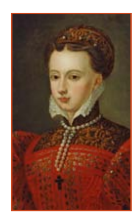
This queen had her honeymoon at Huntingtower. Who was she?