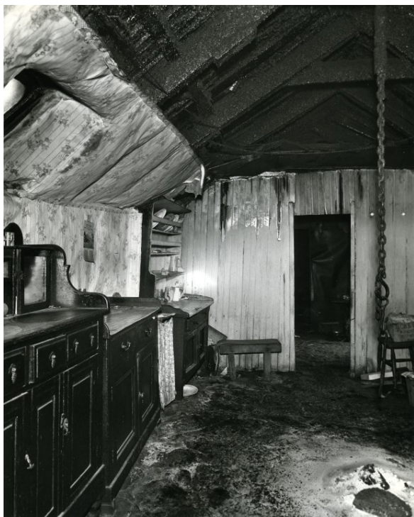
Interior view from living room looking through to porch and byre