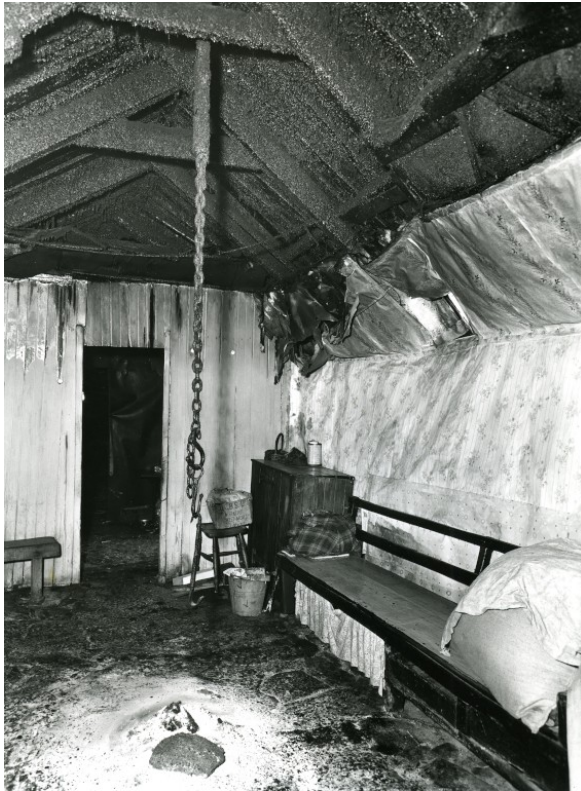
Interior view from living room looking through to porch and byre