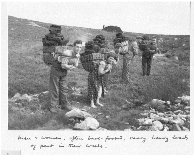
Figure 1: Carrying home peats in creels. Note the men have shoes and the woman is in bare feet!

cart to the house. Once home, it would be built into one large stack ( cruach ), to last the year. There is a peatstack at the back of blackhouse no.42.