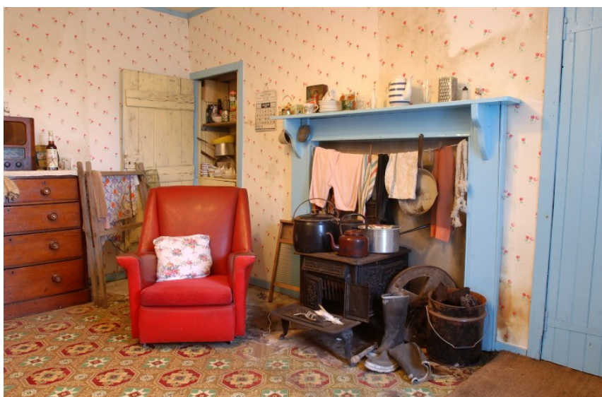
Interior of the Whitehouse

Immediately on entering the front door, there is a small hallway with stairs opposite leading up to an open space on the second floor. This loft-space is floored and although never the case in this house, these lofts sometimes had a weaving loom (beart) in them. To the right is the kitchen (which also has a box-bed), and the to left a living room. Most of the artefacts in the house are not original, but it is interpreted and displayed as from the 1950s.