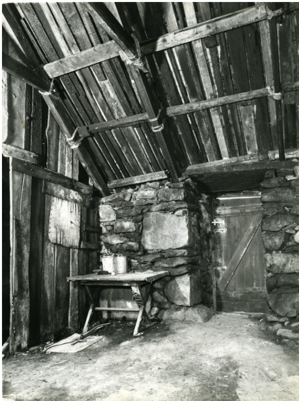
The porch area showing exterior door