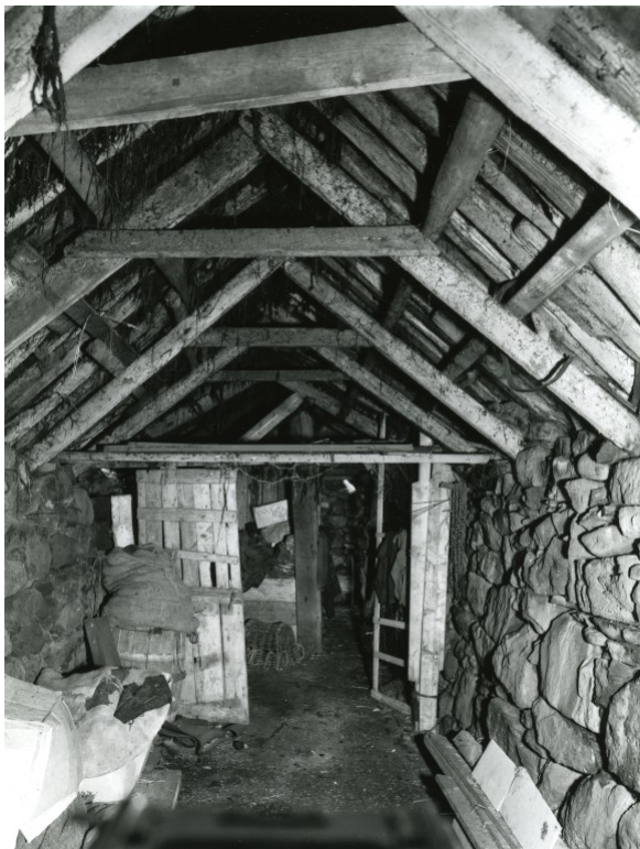
Interior of barn