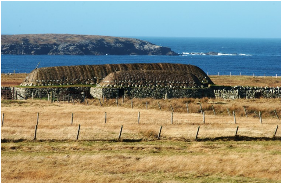
Exterior view of Blackhouse No. 42 from the croft behind the house, illustrating how well it blends into the surrounding landscape

The blackhouses at No. 39 and particularly No. 42 Arnol have an extremely high aesthetic value. Built entirely with natural materials, stone walls and straw thatch, they blend with the landscape and illustrate in many ways the close relationship the people of the area had with the land. The low height and rounded corners provided protection from the strong atlantic gales to which it was exposed. The enclosures around the buildings are made of drystone, and outside No. 42 there is a peatstack and some haystacks which further enhance the experience.