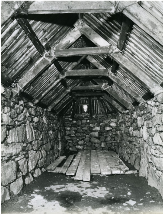
Roof timbers above the barn section of No 42

There are several photographs of the blackhouse at the time it was taken into care (see Appendix 4). Together with the invaluable memories and oral histories of local residents, and accounts of No. 42 and similar houses from visiting travellers over the years we have a relatively complete record of the conserved building.