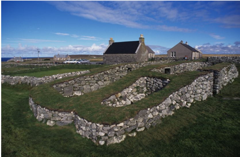
The consolidated ruined blackhouse at No.39, with the whitehouse and the 1960s bungalow (visitor centre) behind it.

There is no exact date for when this blackhouse was built. It does not appear on the 1st edition OS map in 1853, but it had been built by 1897 when the 2nd edition came out. We know it was built by the father of Alan MacLeod who built the white house around 1920. 21 It is possible it was built shortly before 1879, when the new estate regulations were introduced which stipulated features including a window in the gable end. Archaeological investigations have shown that the original house did not have a window which could suggest it was built before the regulations were published and subsequently altered. 22 However Catriona Mackie has shown that in general the estate regulations were not always adhered to in Lewis 23 , and the sanitary report 24 from 1905 notes that none of the blackhouses in Arnol had windows, so it is not necessarily reliable to use this as a point of reference for when the house was built or altered.