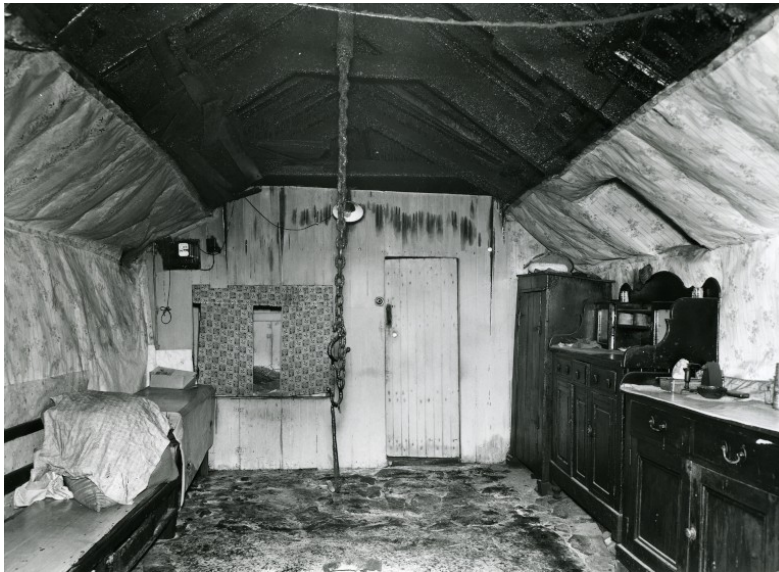
Figure 2: Interior view of Blackhouse No. 42 showing kitchen with furniture and the slabhraidh (chain) hanging down from the rafters over the central hearth. The door leads through to the bedroom. 1966.

The living area round the hearth is paved with stones, and as well as a box bed there is a bench and sideboard, with items such as crockery, a spinning wheel, milk churns etc. Several small windows have been added later to the roof to let light in through the thatch. At the far left the bedroom contains two box-beds, and a window which is a later addition.