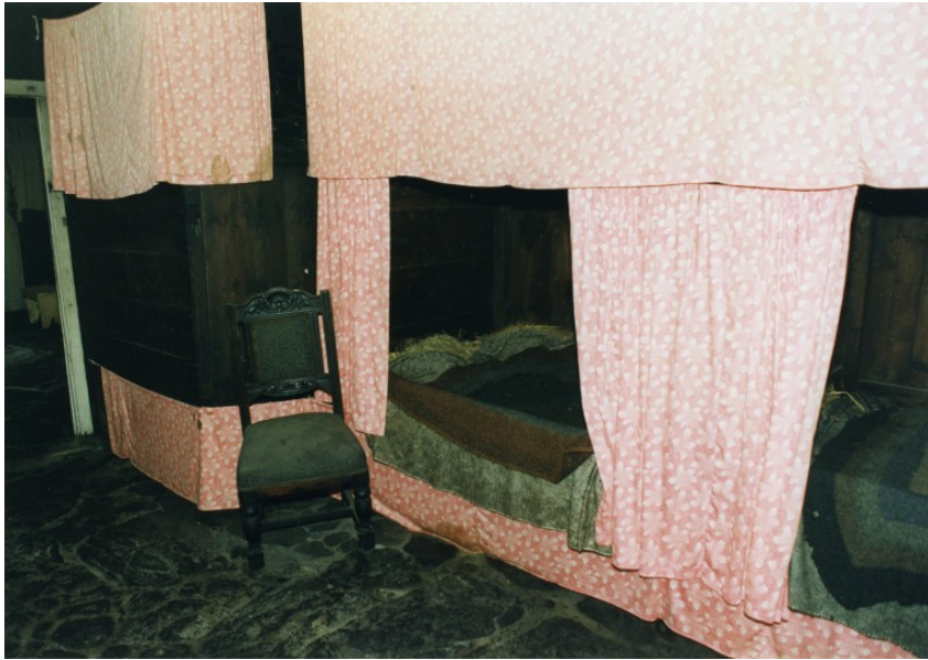
The boxbeds in Blackhouse No 42