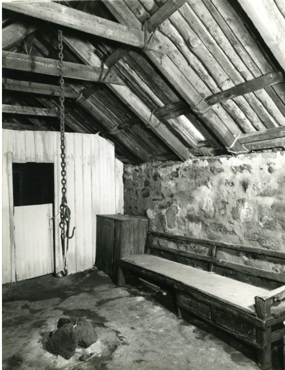
The seise (bench/settle) in living room