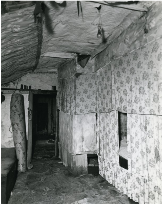
Interior of bedroom and boxbeds (note walls and beds all covered in fabric/paper) looking through to living room