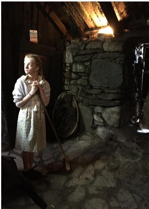
Junior guides filming in Blackhouse No. 42

The Arnol Blackhouse site works with the local school, Sgoil an Taobh Siar, to run a very successful Junior Guides scheme. The children visit the site, and learn about life in a blackhouse and white house, then present guided tours to the public. A video called An Tac an Teine (Beside the Fire) has been produced featuring the Junior Guides of 2016. This is available online nationally and internationally to help viewers understand what life in a blackhouse was like. 38