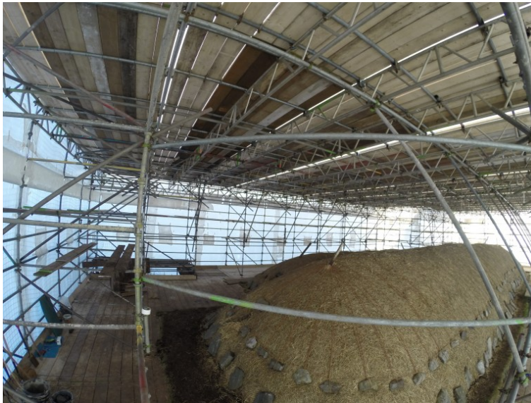
Interior view of the covered scaffolding which was used during the last full rethatching process to protect the collection of artefacts inside among other reasons

to an entirely different set of precepts and traditions than more conventional monuments. It offers the opportunity to support and foster traditional thatching and vernacular masonry techniques. In addition there is a collection of original artefacts in situ. The management of the site also includes the whitehouse which in itself is another interesting example of preservation and conservation.