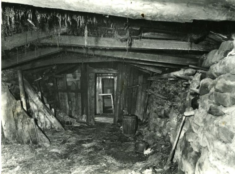
Interior of the byre at No 42 at the time it was taken into care, illustrating the sagging trusses