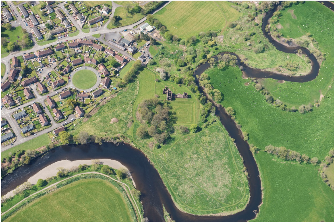
Aerial view of Lincluden and Cluden Water, with neighbouring residential development. DP 276110