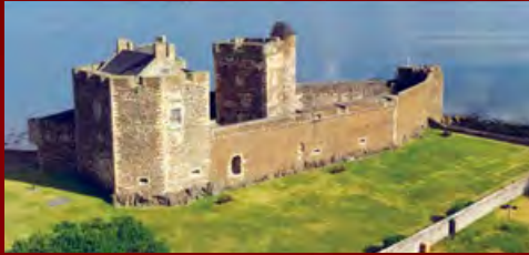
1 Blackness Castle Postcode EH49 7NH

Known as 'the ship that never sailed', Blackness becomes Yorkshire Castle.