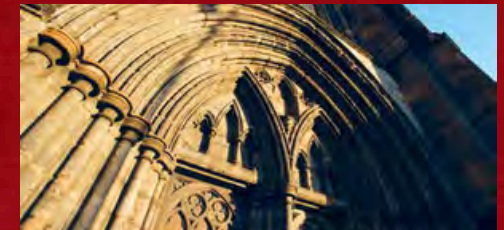
6 Glasgow Cathedral

The place where medieval monarchs were laid to rest plays Westminster.