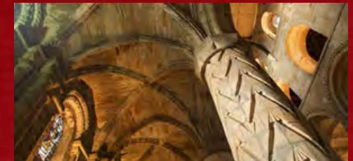
5 Dunfermline Abbey Postcode KY12 7PE

Popular filming location Doune becomes Douglas castle and church.