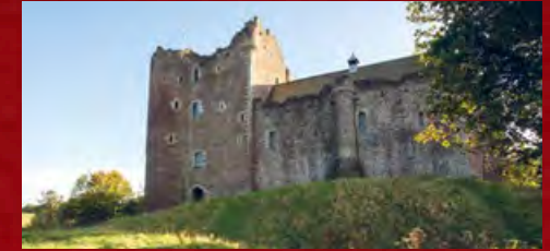
4 Doune Castle Postcode FK16 6EA

A superb Renaissance residence, Linlithgow plays Bruce's castle chapel.