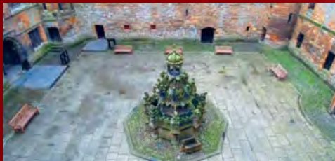
3 Linlithgow Palace Postcode EH49 7AL

Edinburgh's 'other castle' stars as Bruce's castle and village.