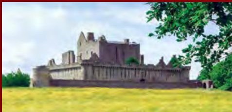
2 Craigmillar Castle Postcode EH16 4SY

Known as 'the ship that never sailed', Blackness becomes Yorkshire Castle.