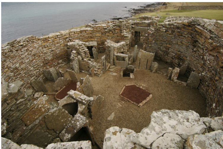
Gurness broch interior