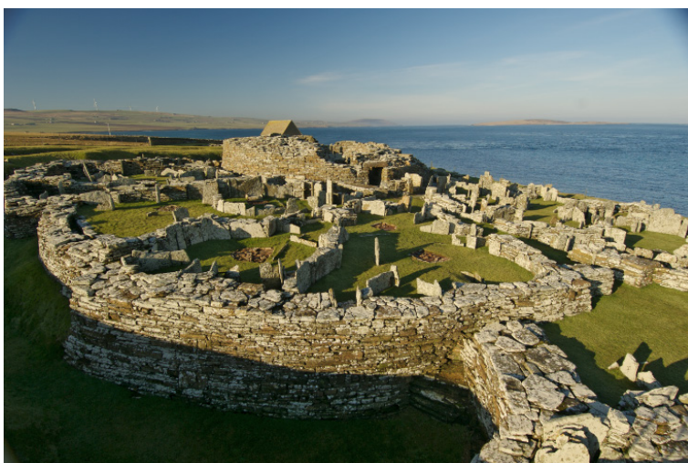
Gurness "village" showing perimeter wall and entrance way