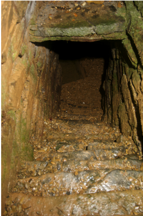
Gurness broch, "well", looking down