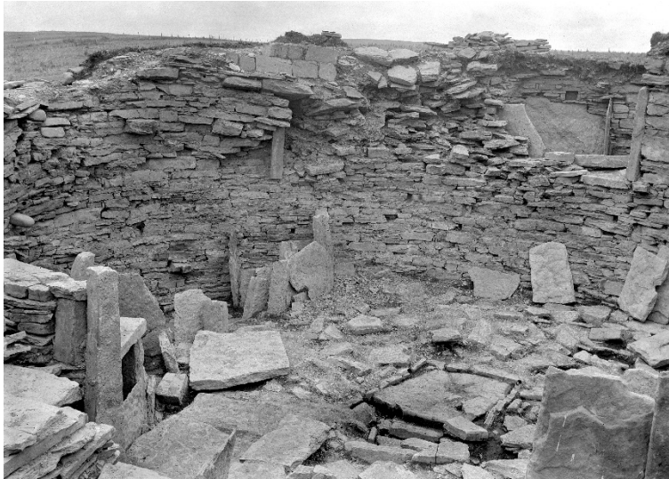
SC 1214992 Gurness, broch interior immediately after emptying (c. 1934) to demonstrate how far today’s neat stonework represents comprehensive reconstruction