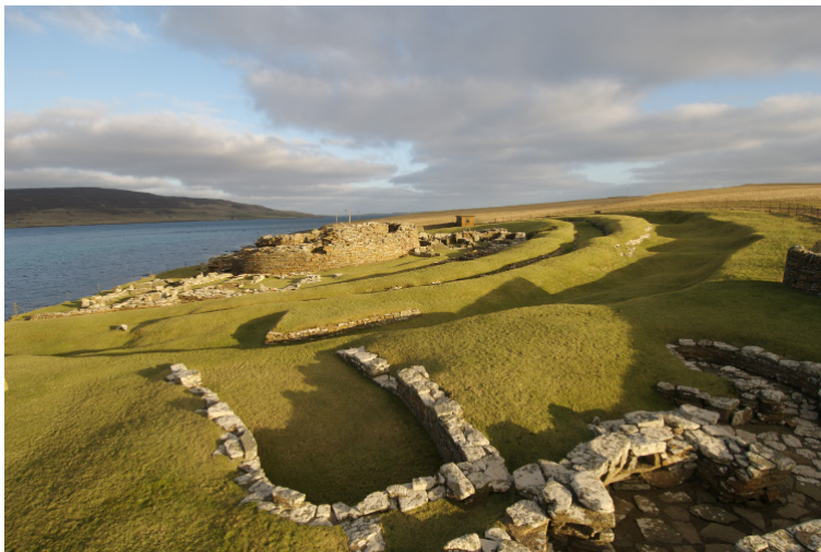
Gurness, longhouse (with broch in background)