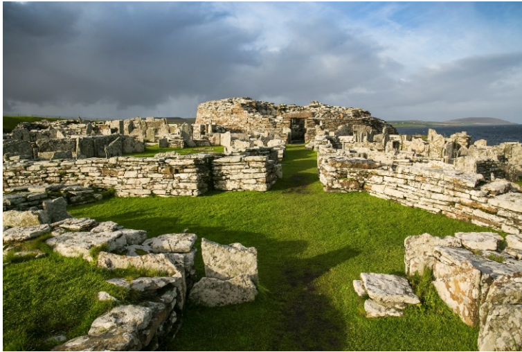
Gurness, entrance way through ditches towards broch