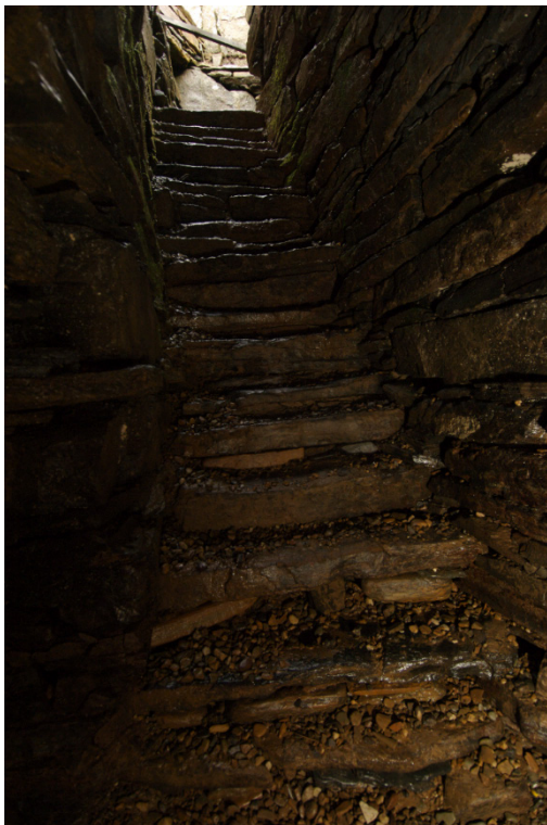
Gurness broch, "well" looking up