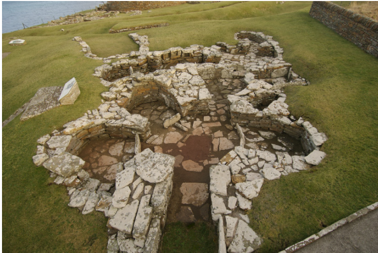
Gurness, "shamrock" house