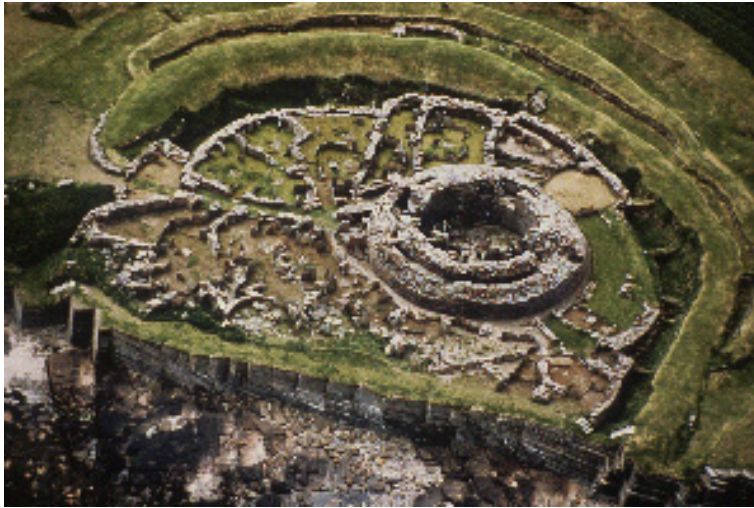
Gurness, aerial view