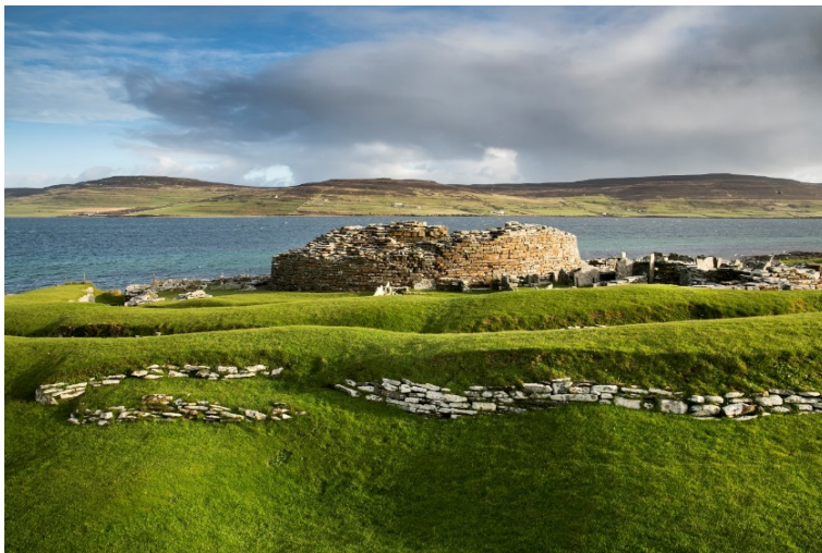
Gurness broch, ditches and Eynhallow Sound