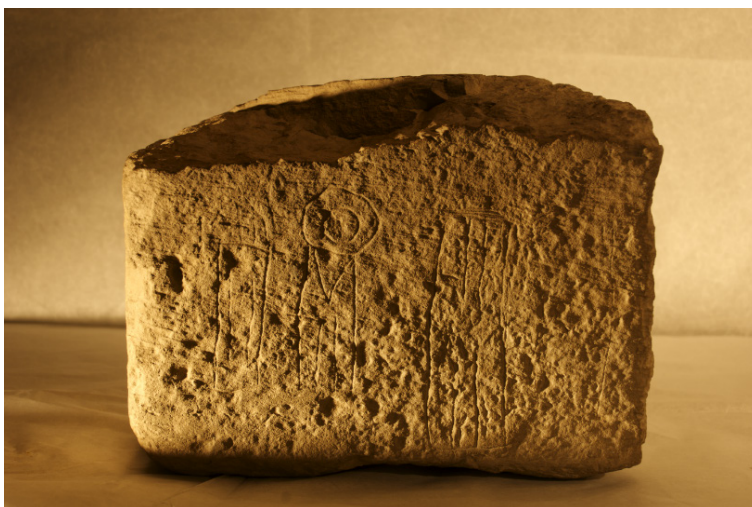
Gurness, Pictish symbol stone