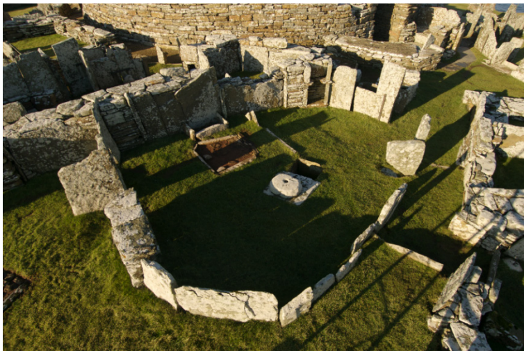
Gurness, sample external building in the "village"