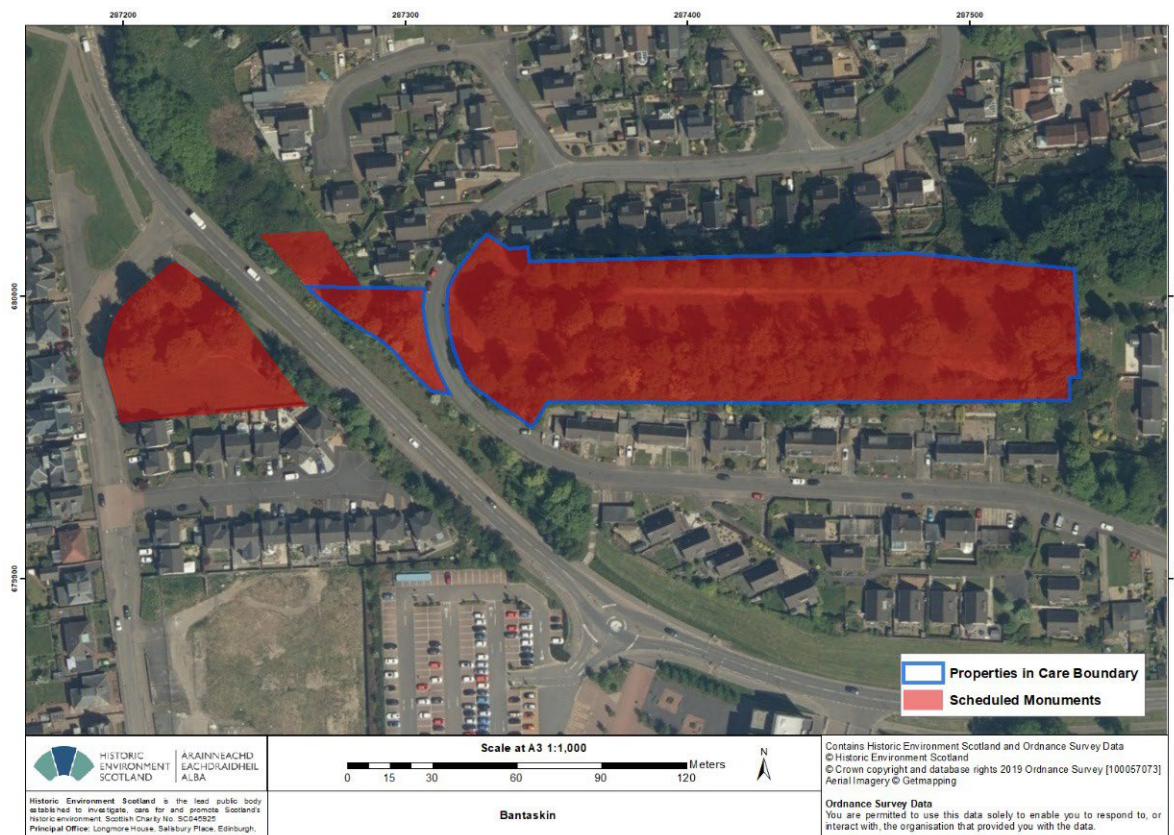
Scheduled Area and Property in Care boundary, for illustrative purposes only.

This property is part of the Antonine Wall Roman frontier and comprises three sections of the Roman Ditch, the largest of which is 217m long and the other two being 49m and 20m long. It is set upon a narrow ridge within a residential housing area, and offers a fine venue for short walks, with good views over Falkirk and the Ochil Hills to the north. Formerly within the grounds of the Bantaskin estate, the property featured visible portions of the Roman frontier within the Bantaskin House gardens; it is possible that the frontier's Ditch and Outer Mound served to highlight the estate's northern boundary. A large number of beech trees, probably planted for the Bantaskin estate, provides a pleasant shaded environment within an area of extensive recent development.