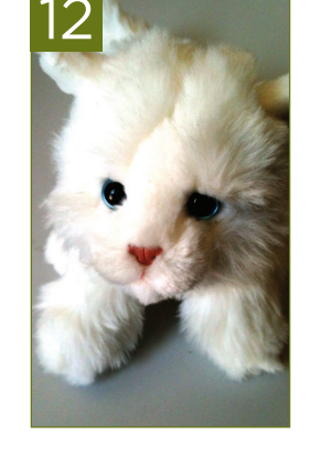
How many cats are in the great kitchens?