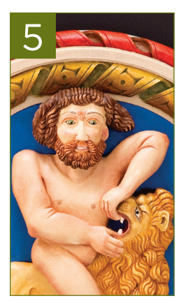
Find the carving of the hero Hercules among the Stirling Heads. How many lions are with him?

What creature is shown being hunted on the tapestries hung around the Palace?