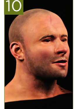
What probably killed the medieval knight whose grave