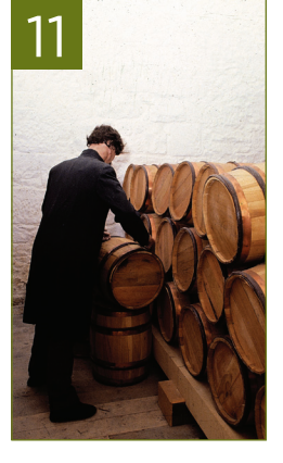
What was kept inside the powder magazine?