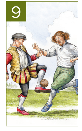
In which part of the castle was the world's oldest football discovered?

Carvings of which creatures sit on the roof of the great hall?