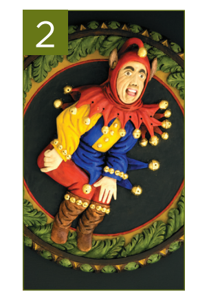
What colours are the feathers on the tickling stick in the jester's vault in the Palace?