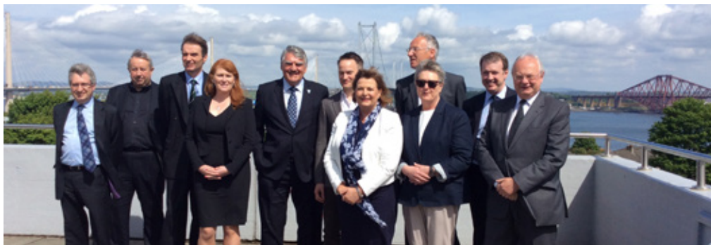
Strategic Historic Environment Forum, May 2017

The outcome of the 2016 EU Referendum has brought with it new challenges and uncertainty. As a sector, we need to deal with both the immediate and longer-term impacts of the UK vote to leave the EU. The full impact of the EU referendum and what a Brexit deal might look like for Scotland is likely to remain unclear for some time to come.