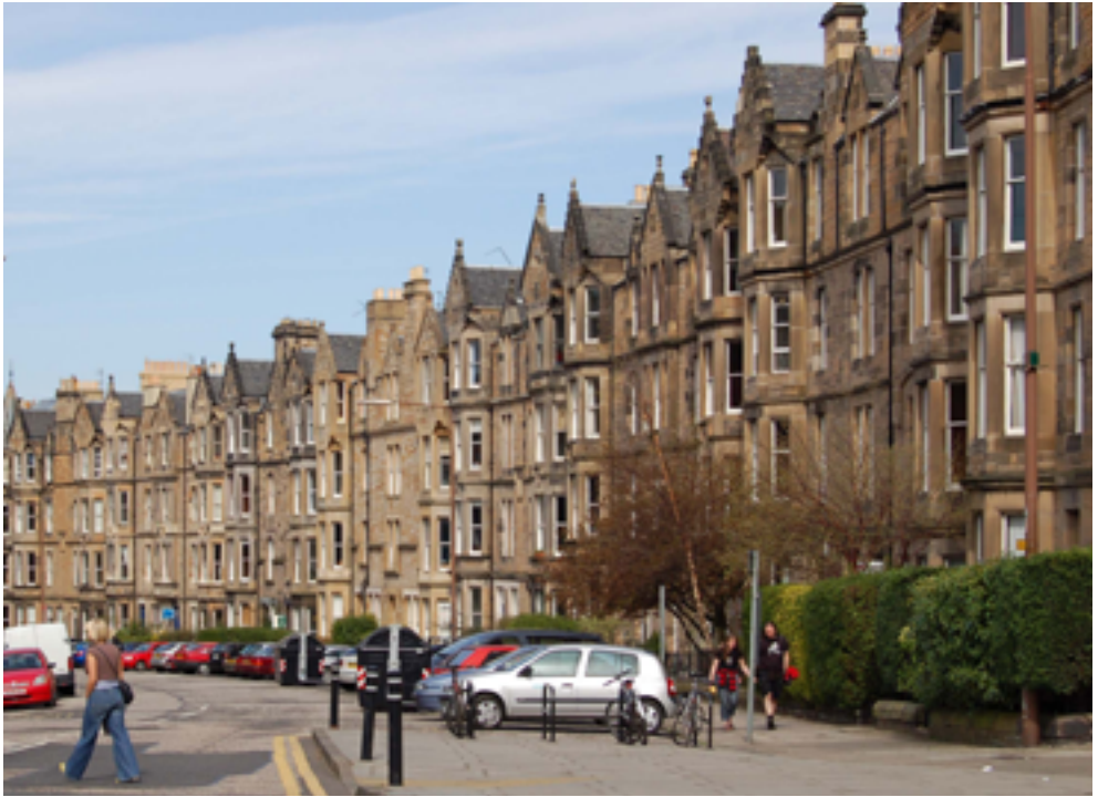
Fig. 2 Ashlar buildings became common in Scottish towns and cities during the 19th century.