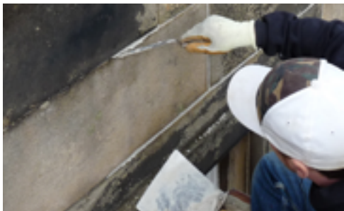
Fig. 12 Repointing ashlar using a fine pointing key.