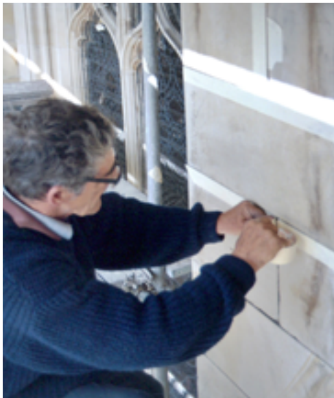
Fig. 10 Taping around joints to prevent staining and damage of stone.

As the mortar starts to set it should be tamped back with the tip of a bristle brush to eliminate any shrinkage cracks. Once it has firmed up sufficiently, the mortar surface can be finished by lightly scraping with a small wooden spatula or similar instrument. Where protective tape has been used, this should only be removed once the mortar is sufficiently dry but before it becomes hard; this allows any disruption to the mortar caused by the removal of the tape to be easily pressed back into place.