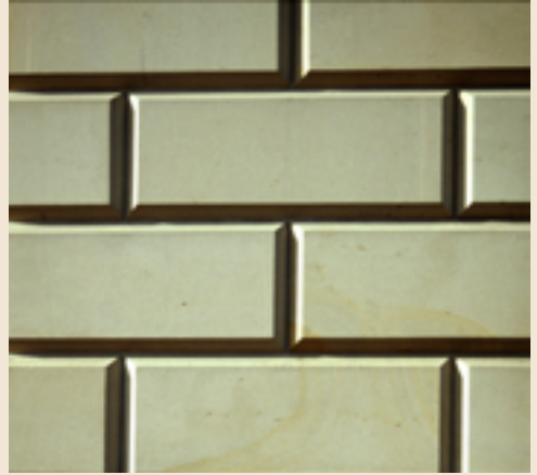
Fig. 4 Chamfered ashlar masonry.

The care and attention which was exercised during the original construction process needs to be recognised when repointing work is carried out to ashlar masonry. The precision required to repoint ashlar correctly demands a great deal of time and skill and should not be underestimated.