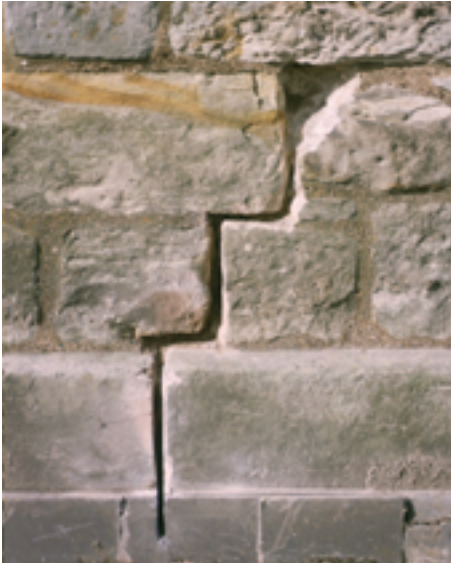
Fig. 9 Damage caused through the use of inappropriate power tools for removal of pointing mortar.

material out by means of a handheld hacksaw blade inserted into the joint and gently pulled forward. It is generally not advisable to use power tools to cut out the decayed or loose mortar from the fine joints due to the risk of damage to the stone (Fig. 9), although, when used by a highly skilled operative good results can be achieved. Traditional hand tools such as chisels can equally cause damage as these simply do not provide the precision required for the fine joints in ashlar masonry.