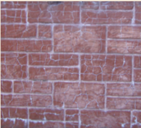
Fig. 7 Cement coating over ashlar showing crazed cracking over the surface.