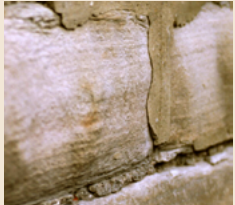
Fig. 6 Cement coating smeared on stone. The fine original joints can be seen where the superficial cement pointing has failed and detached causing considerable damage to the masonry.