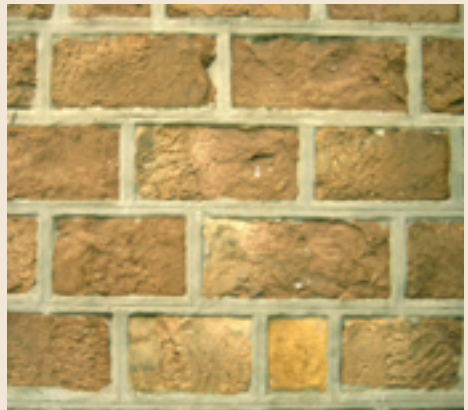
Fig. 8 Superficial over-pointing of stone with cement mortar.