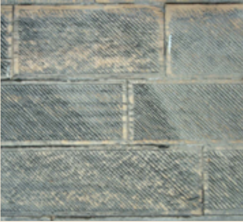
Fig. 3 Fine joints on a tooled ashlar façade.

of a building is compromised, there can be a number of negative consequences, these include masonry deterioration, internal damp and rotting timbers. The most common cause of such problems is the use of impermeable mortars and/or coatings, the most widespread of which is cement (Figs. 5 and 6).