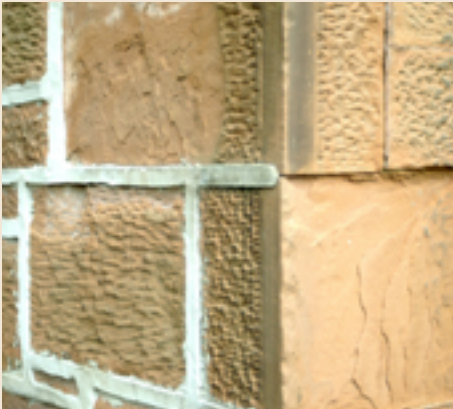
Fig. 5 Projecting cement pointing causing stone deterioration.

Care must be taken, and the appropriate tools used, in the preparation of ashlar for repointing if damage is to be avoided. Decayed mortar should be removed ('raked out') by carefully picking it out with a thin steel hook, or by easing the redundant