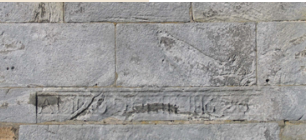
Fig. 1 Example of ashlar masonry with letters shown in relief.

Although well-established by this pedigree, it was only from the mid-19th century when stone quarrying and working techniques became more mechanised and economic that it became possible to build domestic dwellings that incorporated ashlar façades (Fig. 2). Found equally on city tenements, villas, and rural farmhouses, this approach to building lasted into the early decades of the 20th century.