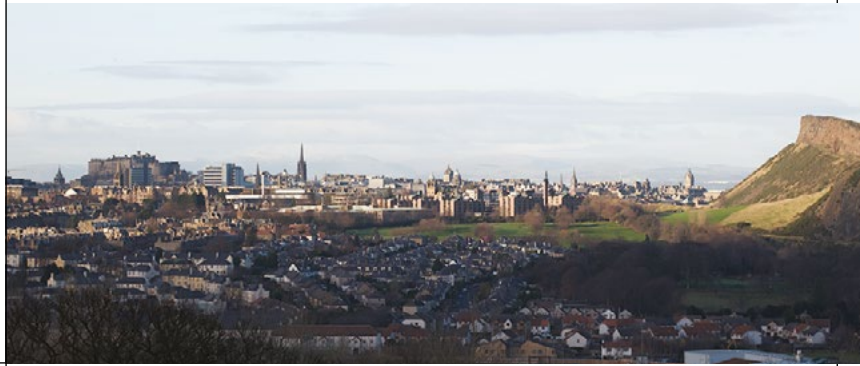
Skyline from Holyrood Park

Edinburgh has been the capital of Scotland for over 500 years, and became particularly renowned for its writers, artists, philosophers and scientists. It was home to the economist Adam Smith, the philosopher David Hume, and the authors Sir Walter Scott and Robert Louis Stevenson.