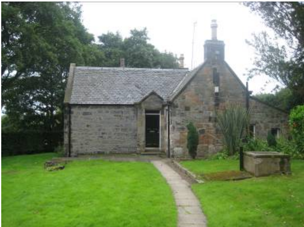
Fig. 1. View of Wells o' Wearie Cottage from the North

The cottage used for this upgrade trial is a small single storey detached building dating from the early 19 th century, with an addition to the east dating from c.1880, and is Category ‘B’ listed. It is constructed of sandstone rubble, bound with lime and finished with ashlar quoins and margins (Fig. 1).