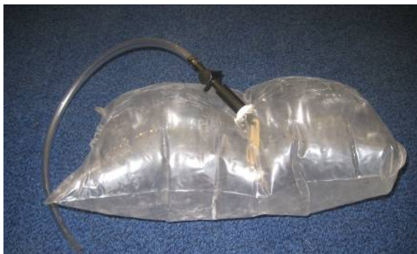
Fig. 13. Chimney balloon used to temporarily close off the flue