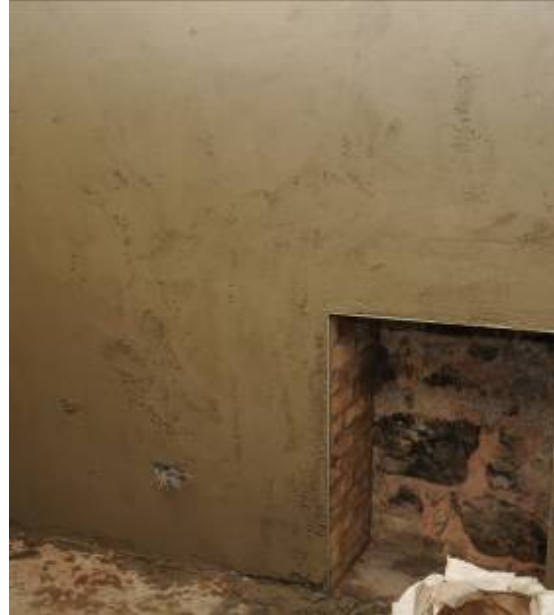
Fig. 12. First coat of plaster on top of the mesh/insulation layer