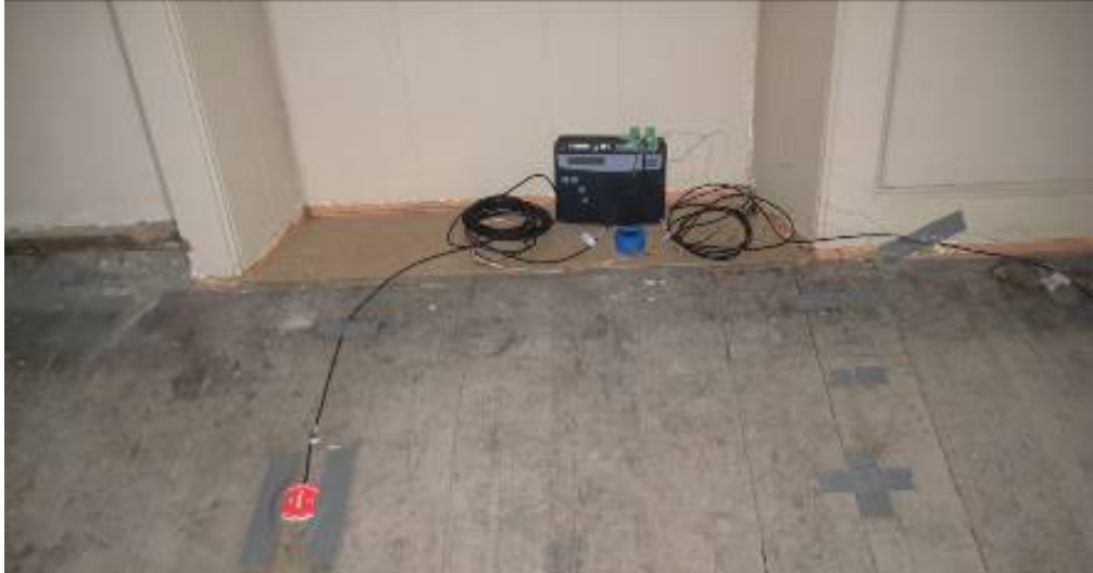
Fig. 3. The heat flux meter and other equipment configured for floor measurements

order to judge the effectiveness of the upgrade works (Table 1). Techniques and the analysis are described in Historic Scotland Technical Paper 10 , and the specific results for this site are described in Technical Paper 17 . The results are very similar to other in situ measurements that Historic Scotland has monitored in traditional built fabric, and as such need no further discussion here.