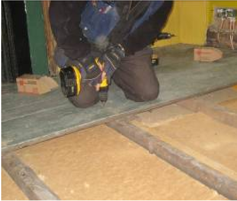
Fig. 8. Floor being fixed down over wood fibre bats