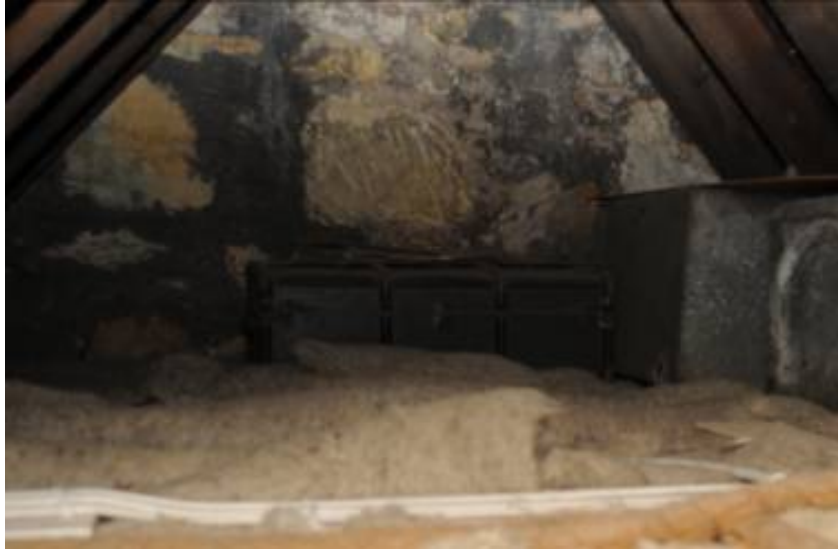
Fig. 5. The sheep's wool insulation laid in the attic space