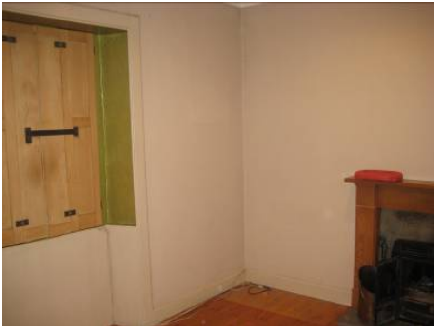
Fig. 2. The living room, prior to commencement of the works

Most of the external masonry elevations have been subsequently cement pointed to various degrees. The roof is pitched Scots slate on sarking with zinc ridges and the un-floored attic is used for storage. The accommodation comprises of three rooms, plus a bathroom and a kitchen. The property is managed by Historic Scotland as part of the policies of Holyrood Park, and recently became vacant at the end of a lease. The area used for the trial was limited to a single room, the living room, which is the later addition seen on the left hand side of Fig. 1. Prior to commencement of the works, the room had been cleared and was in reasonable order (Fig. 2). The building is situated in a sheltered dell, and as such there were no exposure issues or considerations of wind driven rain which can be common in more exposed areas of Scotland.