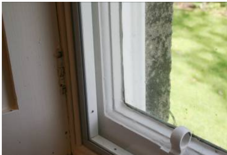
Fig. 6. Polycarbonate secondary glazing in place; note the shutter is free to close

The existing windows were of traditional sash and case pattern, in good condition with working shutters. As the sashes were '6 over 6' (six panes in each sash), the cost of inserting double glazed units into the existing sashes would have been considerable for such a small glazed area. Conventional secondary glazing would likewise have been expensive, so an alternative polycarbonate system was used – this is essentially a single sheet cut to size and applied with magnetic strips onto timber bearers within the staff beads (Fig. 6). This glazing arrangement allowed the shutters to continue to function, addressed thermal heat losses and air leakage and, while not to the standards of more mainstream options, it nevertheless made a significant difference.