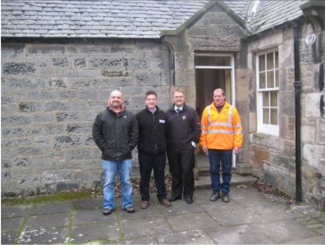
Fig. 4. The contractors and suppliers for the project