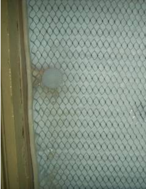
Fig. 11. Aerogel blanket held behind mesh

In this case, issues of vapour permeability are not considered significant, as the existing void behind the lining is successfully managing the vapour, and passage of water vapour through the plaster layer is not important from a building fabric point of view. Likewise, the type of paint on the plaster is also not important, as it is not required to transfer moisture. As with other measures, skirting boards were replaced and the wall finished with lining paper and a modern distemper.