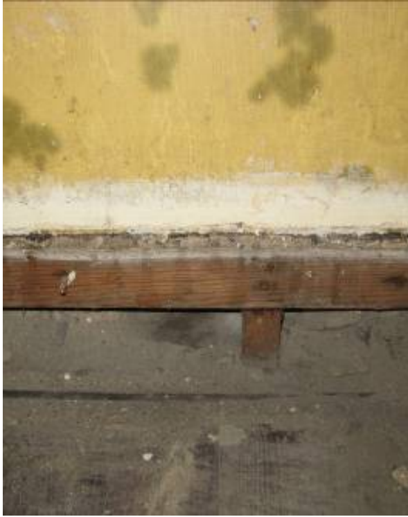
Fig. 9. Skirting boards removed to check wall and floor junction