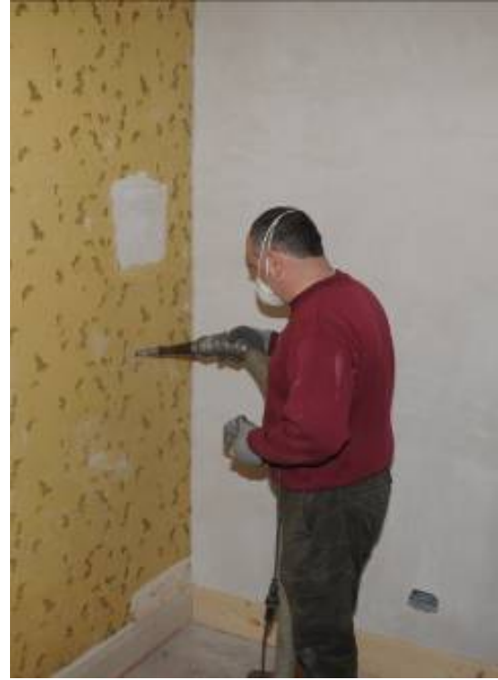
Fig. 10. Blowing in the cellulose fibre