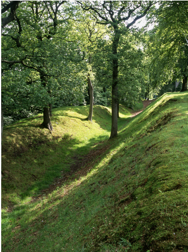
Rampart and ditch at Watling Lodge

Internationally, as part of the Frontiers of the Roman Empire World Heritage Site, staff and communities connected to the Antonine Wall liaison and network with counterparts along Hadrian's Wall and the German Limes . This has included: joint European funding bids; networking trips; hosting / attending international meetings and delegations; and conferences and seminars. There has also been successful engagement with wider European Roman frontier networks.