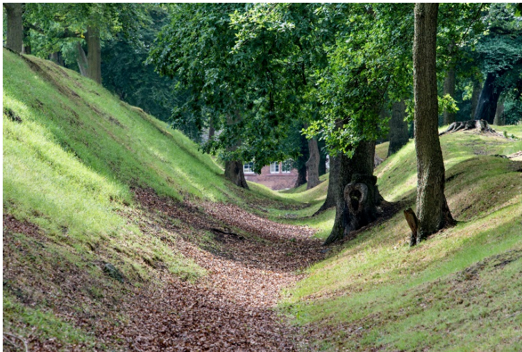
View of Rampart and Ditch, Watling Lodge

Almost nothing can be said about the architecture of the medieval motte, except that it was located upon – and took advantage of – the Roman period Outer Mound, and utilised the Antonine Wall Ditch for its own southern defence. Sir George Macdonald, drawing upon information from Mungo Buchanan – who had observed the motte's destruction – indicates that the motte was raised significantly higher than the Outer Mound and that around 2m of its height had been completely removed in order to make a level platform for the Watling Lodge villa 30 . Alexander Gordon may have earlier described this feature as a 20m x 20m “square watch tower” 31 , but Buchanan's description indicates that it projected north from the normal edge of the Outer Mound to create a semi-circular shape without protruding south into the Antonine Wall Ditch 32 .