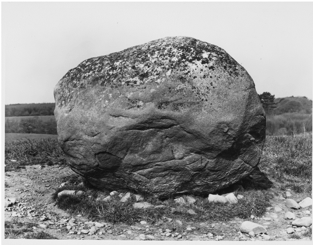
Figure 8: General view of the Wren's Egg Boulder. Photograph taken in 1958.

The Wren's Egg also contributes towards our understanding of the development of the (now) Historic Environment Scotland estate. Its association with Pitt-Rivers and the mechanism through which it was brought into state care, along with more recent research on the subject, has helped to highlight how sites were valued not just for the historical or archaeological importance but also through their value to local communities.