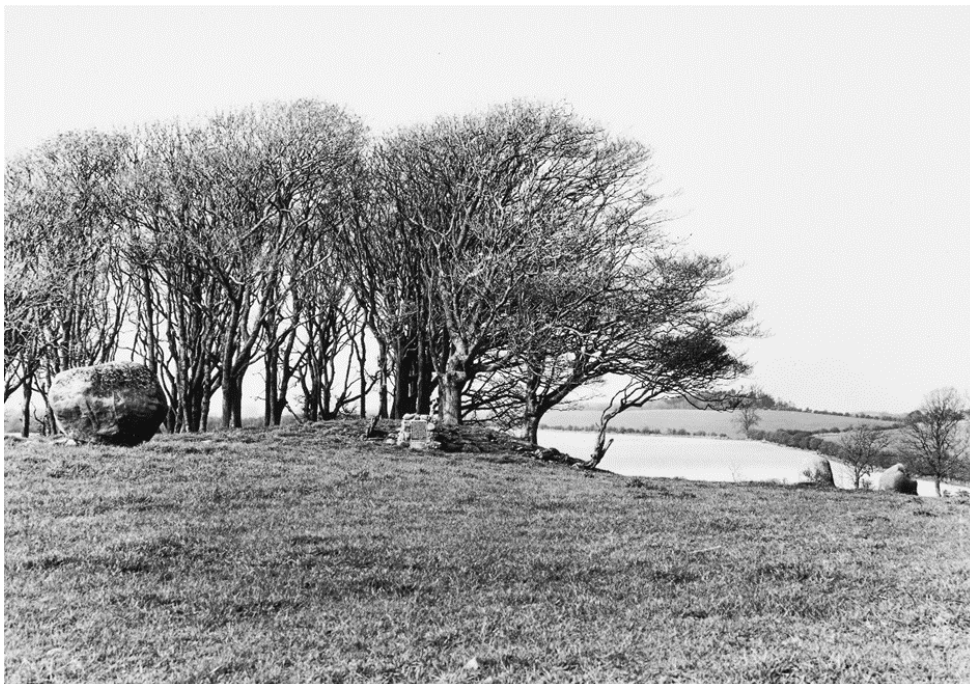
Figure 5: General view of the site with the small sign positioned between the Wren's Egg Boulder and standing stones.

The decision was reconsidered, and it was agreed to bring it into state care 'because of the value imposed on it by local communities, led by Sir Herbert Maxwell'. 30 It also seems that the historical significance of the site had been restated by Maxwell who suggested that the standing stones formed part of a larger stone circle, and that whereabouts of the missing stones was known by the estate for eventual re-erection.