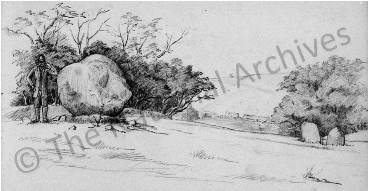
Figure 4: Pitt-Rivers sketch of Wren's Egg.

General Pitt Rivers, who became the first Inspector of Ancient Monuments following the passage of the Ancient Monuments Protection Act, 1882, did not include the Wren's Egg on the initial Schedule for the introduction of the Act. 23 Instead, the 'Standing stones at Blairbowie, locally known as "The Wren's Egg"' were included in the Schedule by Order in Council on 8th February 1890 and taken into guardianship by Deed of Appointment on 10th April 1890. It was the twelfth monument (in Scotland) to be included in this way, and the 21st guardianship monument in Scotland overall. 24