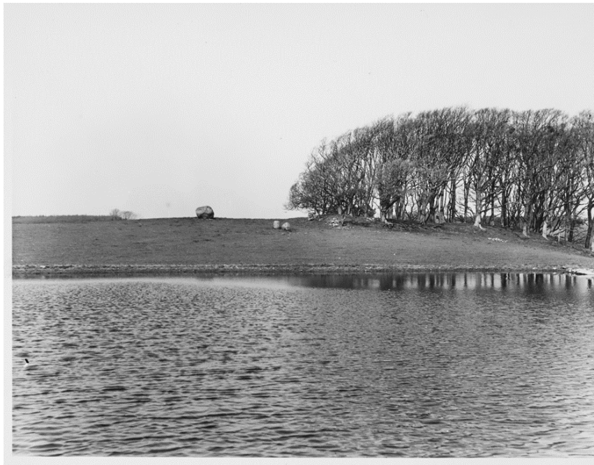
Figure 9: View of the Wren's Egg from the south-east. The body of water is flood water and is not a permanent feature. Photograph taken in 1958.

Relationship to the wider landscape is important to our appreciation of the monument today and no doubt was an important factor in its original design and siting.