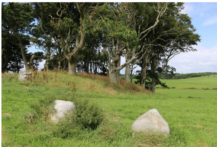
Figure 3: The Wren's Egg Stones. The eastern stone has a triangular form while the western stone is flat topped.

Many standing stones and stone pairs are far from megalithic in stature, 12 and the Wren's Egg Stones are no different measuring just under 1m in height. Dimorphism is a noted characteristic of stone pairs whereby one stone, is often shorter and/or more triangular in shape than the other, which is deemed the 'pillar'. 13 At the Wren's Egg the eastern stone (Stone 1) has a definite triangular form compared to the western (Stone 2) which is flat topped.