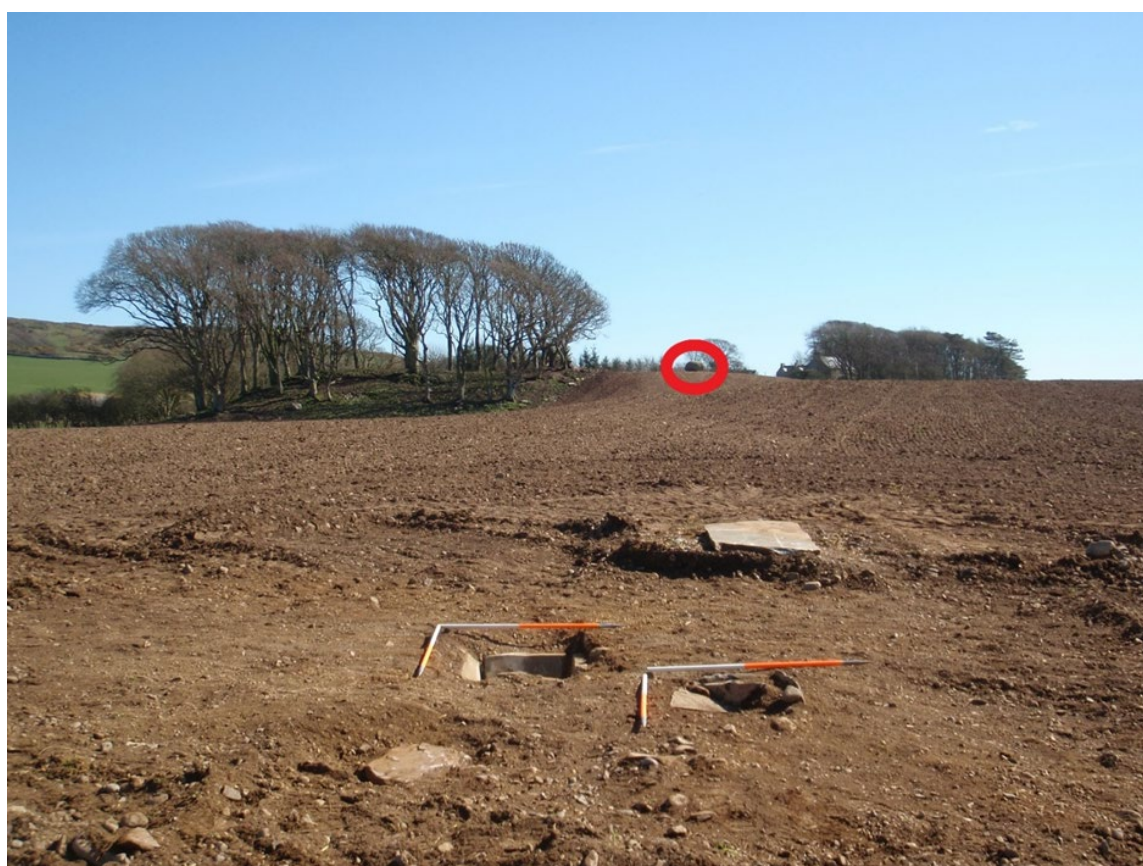
Figure 6: View of the cists in relation to the Wren's Egg. The Wren's Egg is further up the slope, highlighted by a red circle.

Three stone cists were disturbed by ploughing 150m to the northwest of the Wren's Egg in 2012. One cist contained skeletal remains and no artefacts; the other two cists did not contain skeletal remains or artefacts. All of the cists lay on a slight ridge leaving them at risk from further damage by agricultural practices. 40 Post-excavation analysis of the skeletal remains showed that they were of a juvenile, approximately 9-12 years of age, suffering from malnutrition. Radiocarbon dating of the remains gave a date of 2027-1886 BC, placing it in the Early Bronze Age. 41 The excavators of the cists suggested that the Wren's Egg may have formed a focal point for ritual activity within the local landscape, especially given the previous cists unearthed in the area.