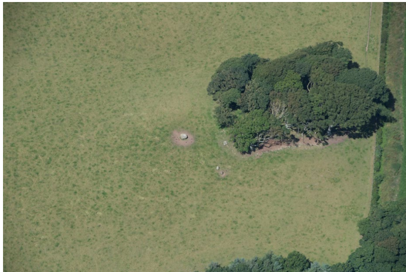
Figure 10: Aerial view of the Wren's Egg with the cope of trees to the north of the boulder known as the Wren's Nest.

The monument and surrounding landscape is not (in 2022) covered by any Natural Heritage designations.