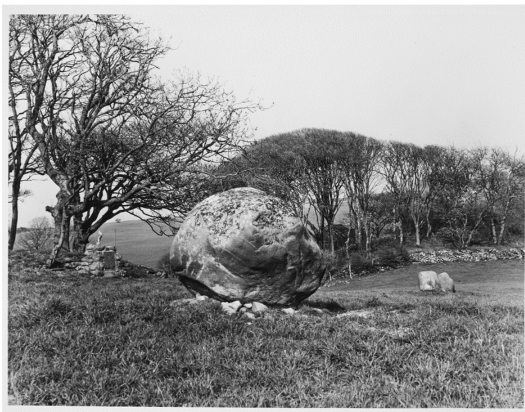
Figure 2: Wren's Egg Boulder and the two standing stones down the slope to the east of the boulder. The picture was taken in 1958 © HES.

The pair of standing stones are around 20m downslope to the east, set about 1.5m apart and both are of unworked granite set just under 1m in height above the current ground surface.