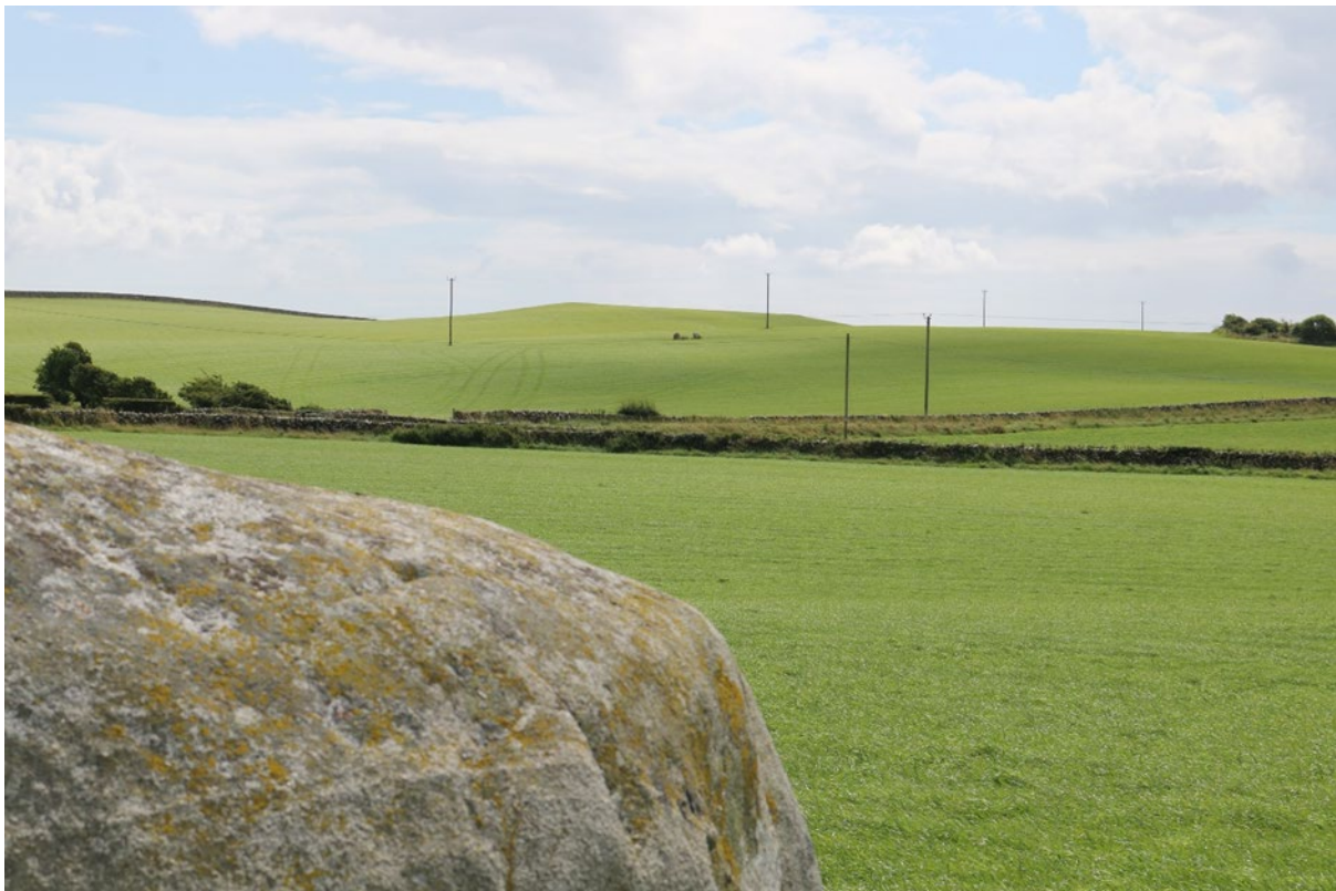
Figure 7: View from the Wren's Egg Boulder to the Milton Hill Stones which are included in the schedule SM90316 but not in the PIC boundary.

Whilst not within the Property in Care area, the presence of burial cists in the immediate landscape provides further evidence of a Bronze Age funerary landscape, potentially centred on the Wren's Egg. Any contents of the cists could provide evidence about the inhabitants of the area during the Bronze Age.