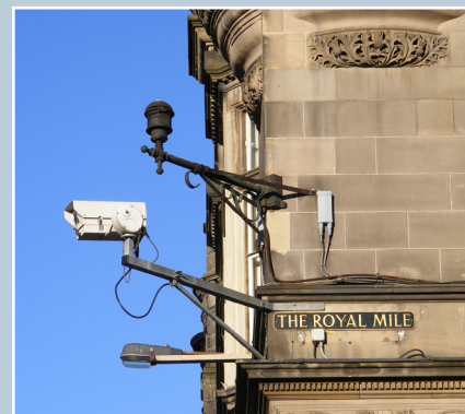
Here the corner profile of the building is broken by the brackets for a security camera, an old lamp, and modern street lamp. High Street, Edinburgh.