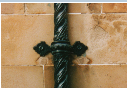
A later 19th-century cast-iron 'barleysugar' downpipe and decorative bracket in Rothesay, Isle of Bute.

18th century the range and complexity of fixtures expanded enormously. Some fixtures were planned from the outset of a building, whilst others were added at a later stage. Fixtures can demonstrate a combination of architectural, associated and historical interest: