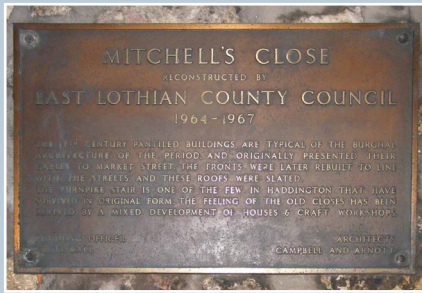
A small, discreet, brass plaque commemorates the reconstruction of Mitchell's Close in Haddington, East Lothian.