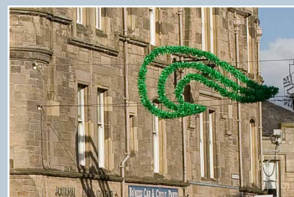
Discreet stainless steel eye-bolts are re-used each year for the Christmas decorations in Bo'ness.