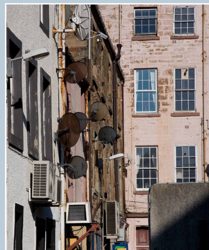
The cumulative effect of modern fixtures, including satellite dishes, air conditioning units, signage and street lighting, is damaging to the character of this 18th-century building.