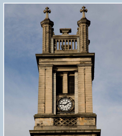
The landmark tower of St Stephen's Church (1828), Edinburgh. Telecommunications antennae are positioned on either side of the clock face and on the parapet above behind GRP (glass-reinforced plastic) material that replicates the colour of the surrounding stonework. All the works are easily reversible if the technology changes or becomes redundant.