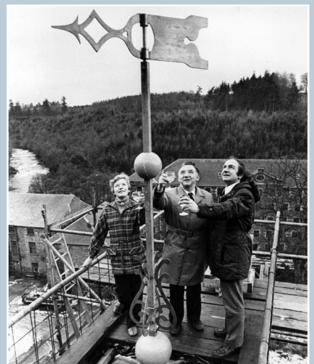
The weather vane at New Lanark mill village was restored in 1980, made by a local craftsman with the names of the villagers stamped on the shaft.