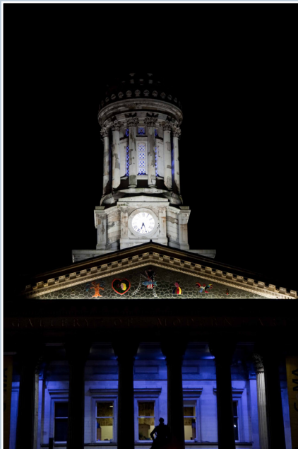
Gallery of Modern Art, Glasgow. The floodlights are positioned behind a cornice and on the roof, therefore making little impact in daylight but providing atmospheric lighting after dark.

locations. Planning authorities are able to condition the removal of equipment when it becomes redundant.