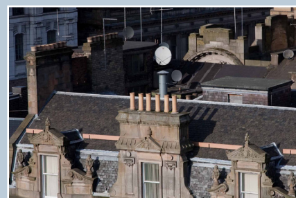
These satellite dishes are positioned in a roof valley and are not visible from street level. Fixed to later service features, they do not damage architectural details.