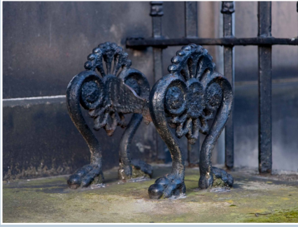
An elaborate cast-iron bootscraper at the entrance to a house in Randolph Crescent (1829), Edinburgh. Such fixtures were common in the early 19th century when road surfaces were generally muddy.