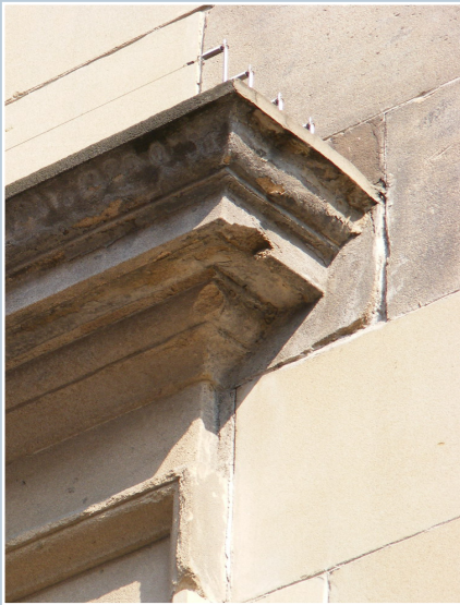
Discreet sprung wires are attached to the top surface of this cornice to deter birds. Miller Street, Glasgow.