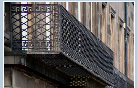
A cast-iron balcony marking the principal room on the first floor of a townhouse in Regent Terrace, Edinburgh, part of the development planned by William Henry Playfair in 1825 and built 1826–33.