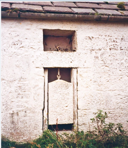
A cheese press built into the wall of a farm cottage at Reay, Highland. Although the press is no longer used, it provides insight into the type of farming of the area and past methods of cheese production.