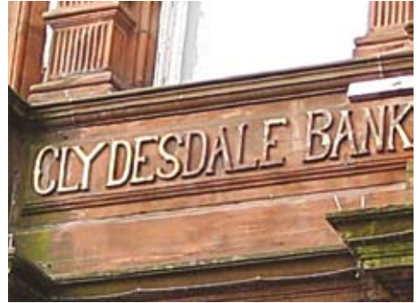
Deteriorated external gilding

this occurs and the loss of either external or internal architectural gilding is evident, action to halt the flow of moisture contributing to the deterioration of the substrate will be necessary before re-applying the gilding.