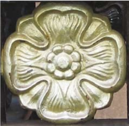
Gold paint oxidising and losing its shine

Due to the cost and difficulties in carrying out appropriate repair to gilding, it is always advisable to seek advice from a suitably qualified professional with an appropriate knowledge of the techniques that were originally used.