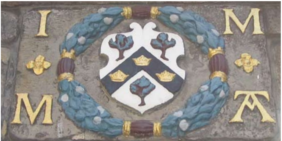
External gilded decoration