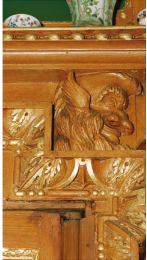
Internal gilded decoration

Where the deterioration of the prepared surface is the cause of damage, the application of size or similar glue based material can stabilise flaking gesso or bole. If the protective surface coating has been worn away to expose the leaf this should be replaced to prevent further wear.