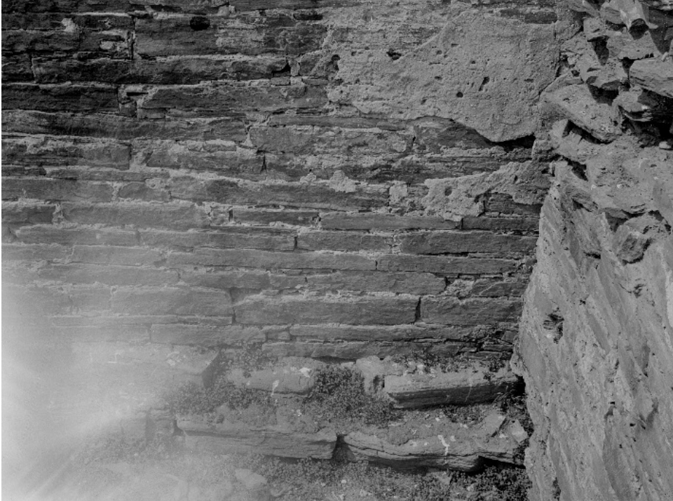
Figure 5: Photo of fragments of harling on wall of building at castle, location unknown SC 1247583

orientation of a garderobe flue facing the entrance to a site is not unusual. The masonry of this extension is not dissimilar to that from Phase 1, and is laid in mortar. From its wall thickness, it is doubtful if this wing was taller than two levels; that is, ground and first full-height floor.