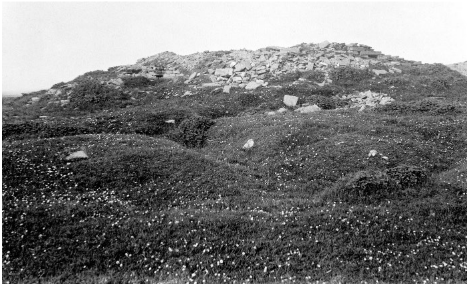
Figure 4: Photograph of Cubbie Roo's, possibly before clearing works. Undated SC 1168501 © Crown Copyright. Note the volume of slabs, of seemingly similar character to the fabric of the primary built phase, scattered around.

noted from the beginning that Cubbie Roo's Castle bears no architectural features which are able to guide dating on the basis of similarity to chronologically diagnostic features. The ascription of dates to features is discussed later. More recently, research on the mortars of both buildings argues for the castle and chapel being constructed in a broadly coeval period 13 .