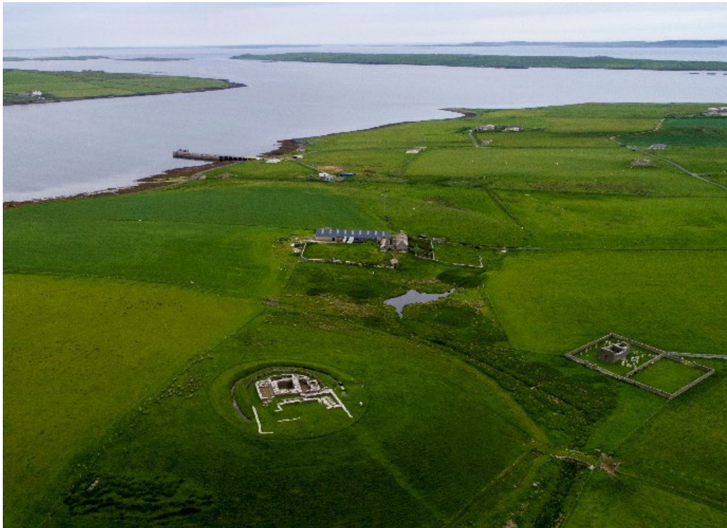
Figure 2: Aerial view with Cubbie Roo's Castle (in foreground), The Bu farm (centre), St Mary's Chapel (far right), with views to Rousay and Egilsay beyond. DP 255198

Prehistoric (undefined): Several features around Cubbie Roo's testify to prehistoric occupation, though beyond this identification, a tighter chronology has not been suggested. An uncertain number of burial mounds c.700m south-west of the castle site were asserted in 2006 east of Testaquoy 4 . A further burial cairn was identified c.450m south-west of the castle, near Braes of Ha'Breck 5 . A probable Prehistoric stone setting s was recorded c.1000m east of the castle by Loch of Oorns, and an individual standing stone at Skirmie Clett nearby is also suggested. 6