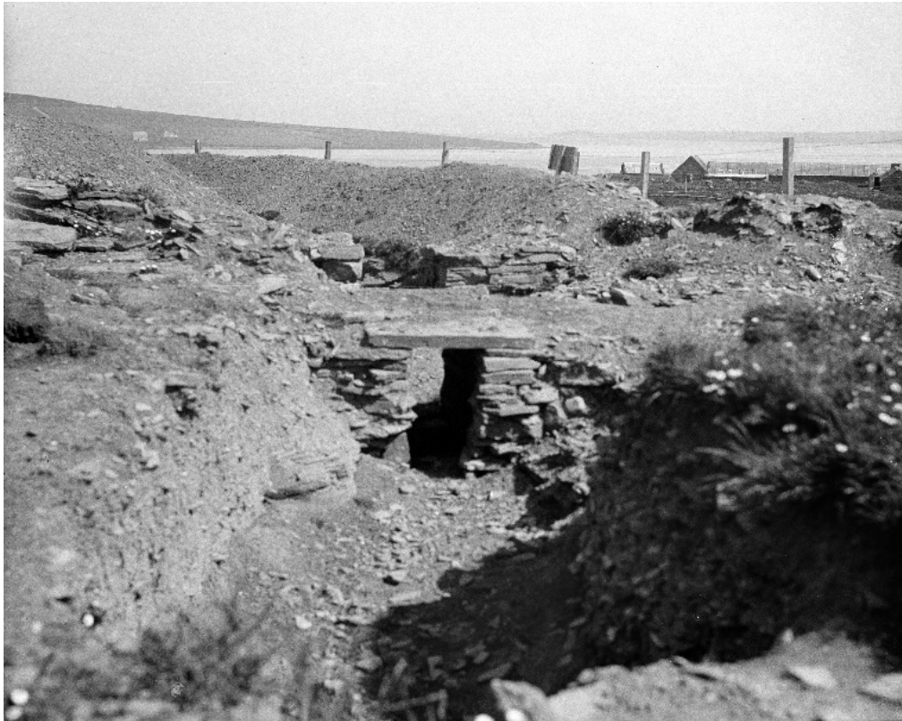
Figure 6: Photograph of both pairs of piers in the ditch on the E side of enclosure. SC 1247581 © Courtesy of HES.

The final area of features of uncertain phasing is a series of walls and corners south of the Phase 1 building, and indeed south of all of the earlier phases at the site. The Inventory identified the presence of a hall with large, shallow fireplace and centrally-framed doorway on an east-west wall c.3.04m south of the Phase 1 building. What is certain is that in contrast to the earlier phase built around the Phase 1 work, this building shows a less tangible relationship with the other buildings on site. It lies at the northern end of a flattened area of land whose construction necessitated the demolition of the ditch and banks enclosing the castle's southern third. Its construction was not the sole direct cause of this demolition, however. The 'hall' is in phasing terms coeval with two large tanks east of it, whose location lies in the path of a conjectural reconstruction of the inner bank 26 . Therefore the tanks, and the hall, must have necessitated the destruction of the bank.