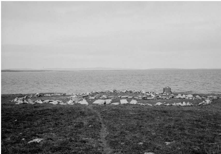
Figure 3: General view of Skirmie Clett prehistoric enclosures, 1934. SC 1254117

The Bu, a large farm c.180m north-east of the castle and c.150m north of the chapel, probably represents the site of an earlier settlement with medieval origins. It is sited on a large mound whose margins demonstrate evidence of middens 11 . Between The Bu and Cubbie Roo's Castle is a pond which may represent the remains of mill infrastructure of uncertain date.