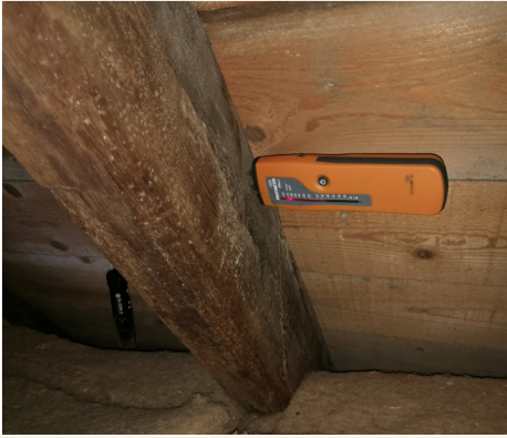
Fig. 7 Measuring moisture in timber. Humid conditions (such as in an unventilated roof space) create ideal conditions for mould to grow.