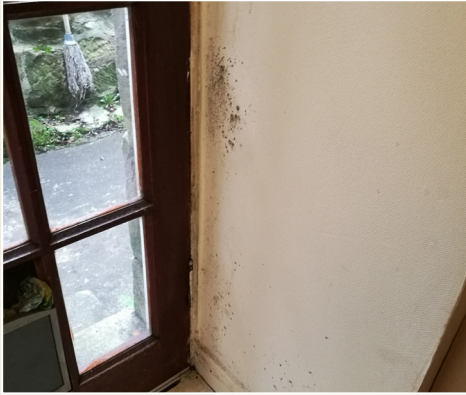
Fig. 2 Mould growth adjacent to a draughty door. This area of internal wall is colder so condensation is more likely.

elevated moisture levels. In contrast, traditional materials such as stone, timber, lime plaster and mortar, as well as some natural insulation materials, are more "breathable." This means they allow moisture vapour to move through the building fabric, and cope better with changes in humidity.