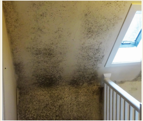
Fig. 9 Substantial mould growth in this stairwell meant the plasterboard had to be removed.

Mould can affect human health and should be addressed as soon as it is detected. Measures to improve conditions include making sure the building is well insulated, the use of humidity controlled extract ventilation, and maintaining existing pathways for air movement. Using breathable materials which help