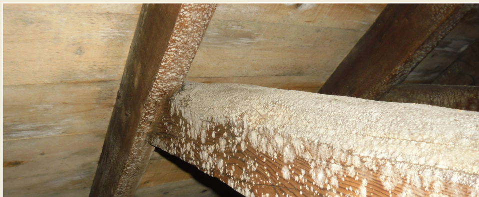
Fig. 4 The positioning of mechanical extract ventilation is extremely important. Here moisture from a bathroom escaped into a roof space, causing a localised concentration of moisture, mould growth and timber decay.

encouraging air to circulate within a building should always be maintained and kept clear of debris (Fig. 3).