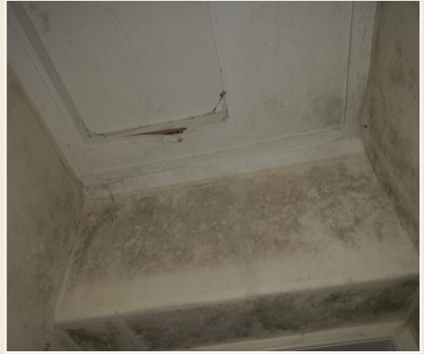
Fig. 8 A cold spot has been created around this uninsulated loft access hatch, leading to mould growth.

Whilst having a well-insulated external envelope can help improve internal conditions, care should be taken when undertaking energy efficiency refurbishments. An increase in air tightness can sometimes worsen existing conditions, or create a humid