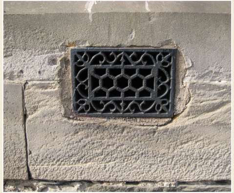
Fig. 3 Traditional buildings were constructed with built-in ventilation which should be maintained and kept clear to reduce moisture levels.

Rarely, mould can also be toxic. The best known is the black mould, Stachybotrys , though not all black mould is toxic. If toxic mould is suspected within a building it is advisable to have it tested and there are private testing facilities that do