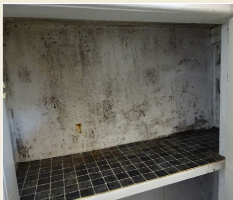
Fig. 6 Mould growth in an unventilated press cupboard.