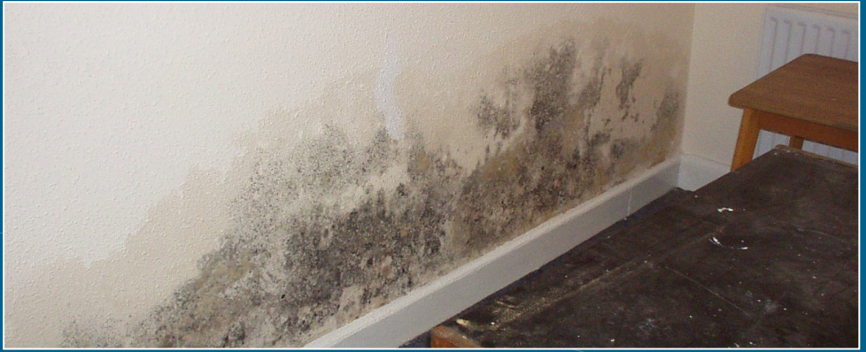
Fig. 1 Mould thriving on a damp (and therefore cold) area of wall. Eliminating the cause of dampness, and improving the heating and ventilation in this area will reduce the risk.