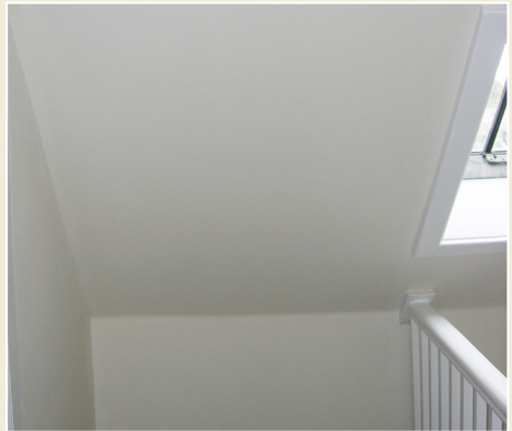
Fig. 10 The same stairwell as in Fig. 9 with replaced plasterboard following ventilation improvements and the installation of breathable insulation.

manage humidity and moisture levels can also improve internal conditions and inhibit mould growth.