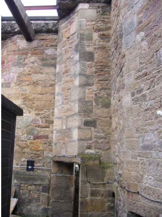
Sentry box(?) at SE corner of Shot Yard/Water Tower 1. Note blocked mural fireplace to left.

The original cylinder was replaced around 1950 with the current steel cylinder. This rests on brick and concrete piers, in sharp contrast to the high quality ashlar blocks provided in 1850 for Tower 1.