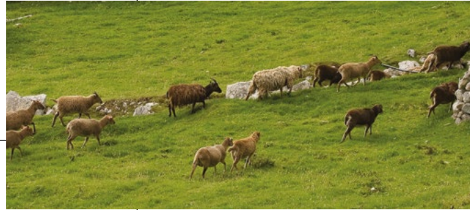
Soay Sheep

St Kilda is a group of five remote islands and sea stacks in the North Atlantic, 100 miles off the west coast of Scotland.