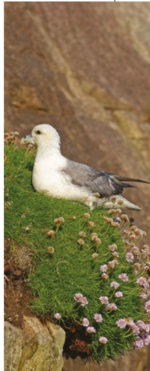
Fulmar and Thrift

In July 2005, St Kilda became one of a few World Heritage Sites to hold dual status for both its natural and cultural qualities.