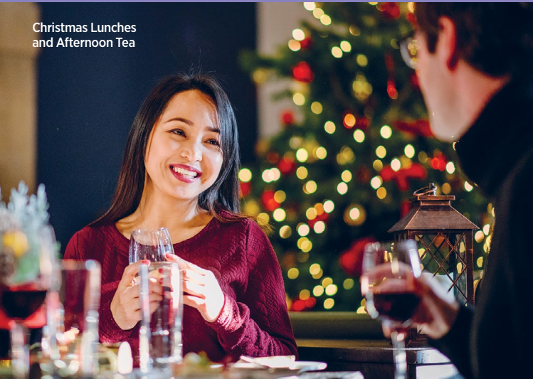
Christmas Lunches and Afternoon Tea