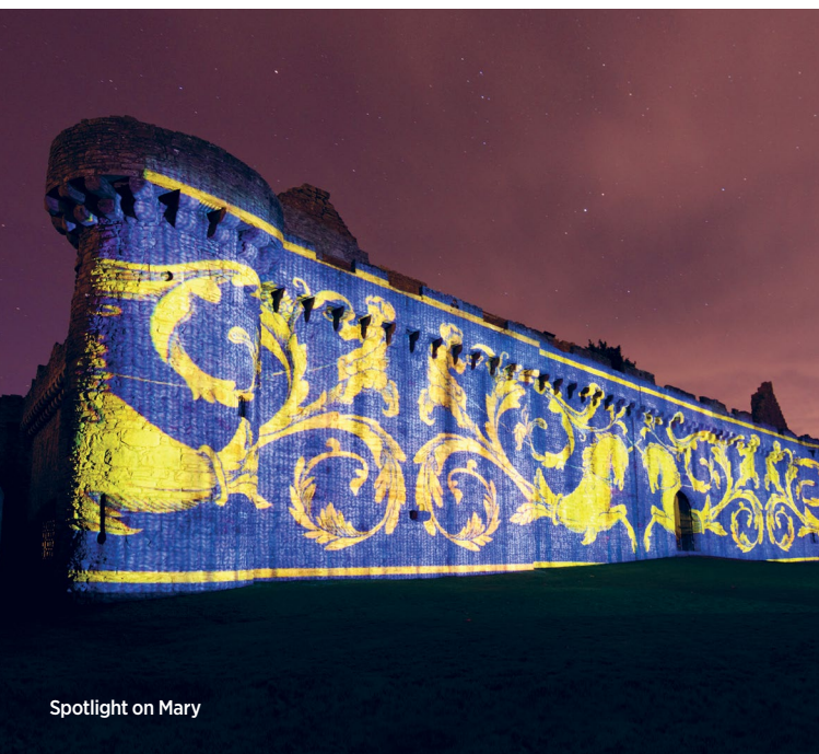
Spotlight on Mary

It is the festive season at Court. While Reformation Scotland shuns Christmas festivities, Mary, Queen of Scots is celebrating the Twelve Days of Christmas with her courtiers. Come and be part of this and join in the fun of celebration. (Included in admission price)