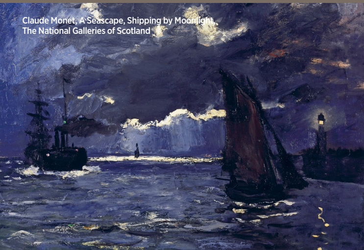
Claude Monet, A Seascape, Shipping by Moonlight The National Galleries of Scotland

Date(s) Event / Venue / Description (Cost) Time