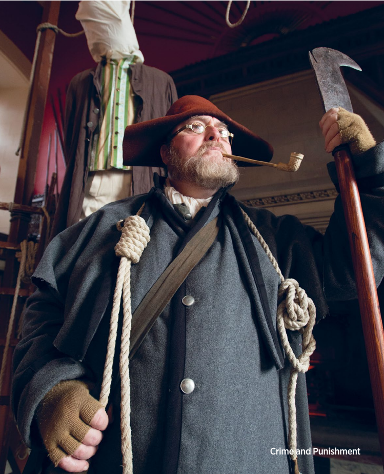
Crime and Punishment