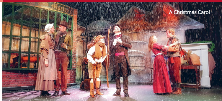
A Christmas Carol

Tue 3 Christmas Shopping Fayre Stirling Castle 6pm-9pm Last entry 8.15pm