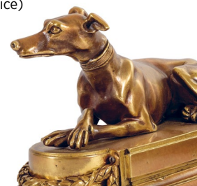
The Dunimarle Library Displays, greyhound desk weight

Oct 15-Jan 9 Romantic Scotland Through a Lens Stirling Castle Presenting photography from the archive, this exhibition explores life in 19th century Scotland and how its rugged ruins, fishing communities and rural life have contributed to understandings of Scottish identity and history. (Included in admission price) 9.30am-5pm Last entry 4.15pm