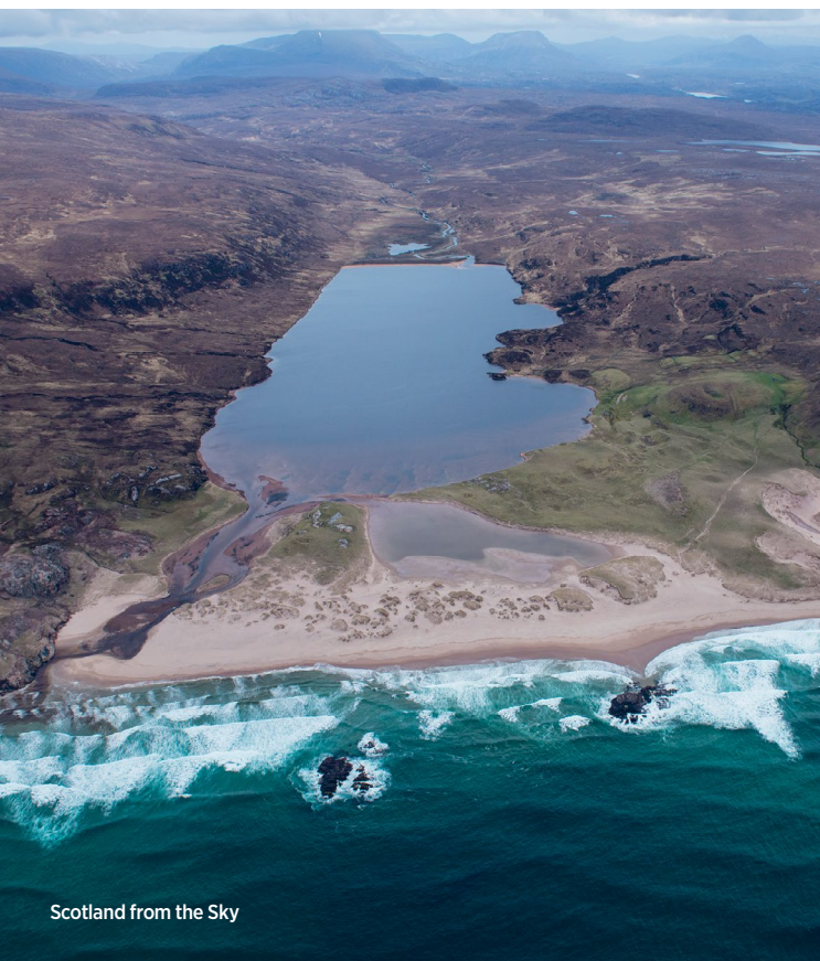
Scotland from the Sky