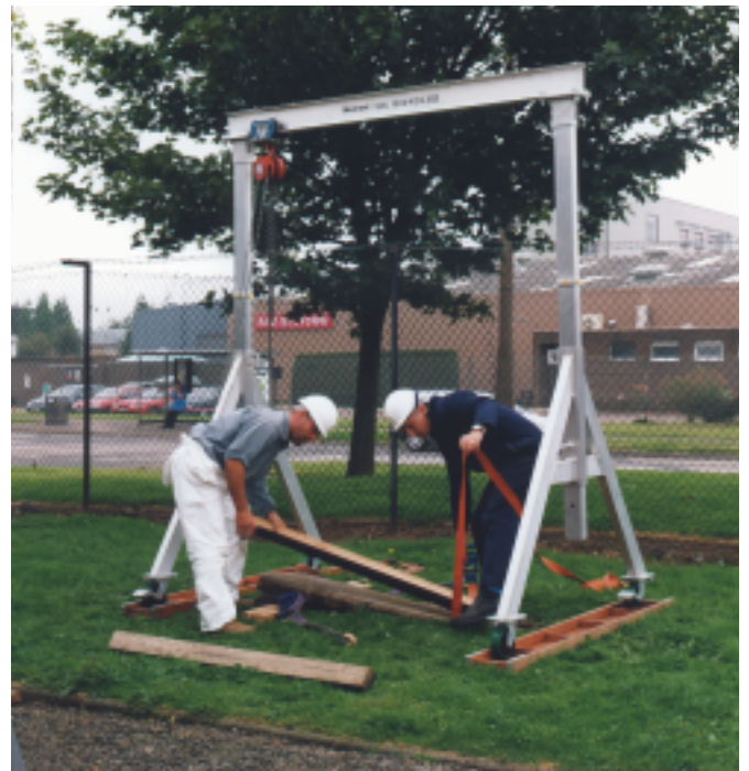
Illustration 2. Preparing to lift a stone – securing the stone to a wooden batten.