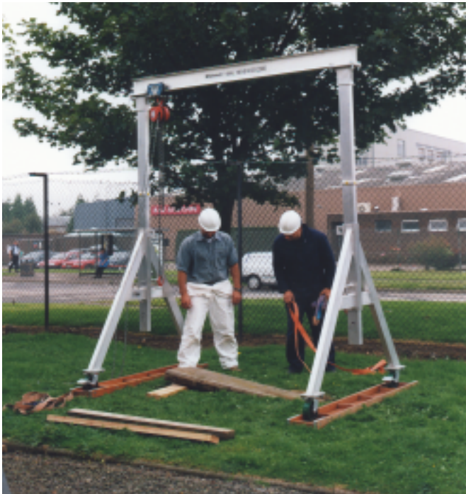
Illustration 1. Preparing to lift a stone – the A-frame is erected securely.