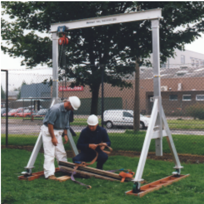
Illustration 3. Preparing to lift a stone – the use of soft strops.