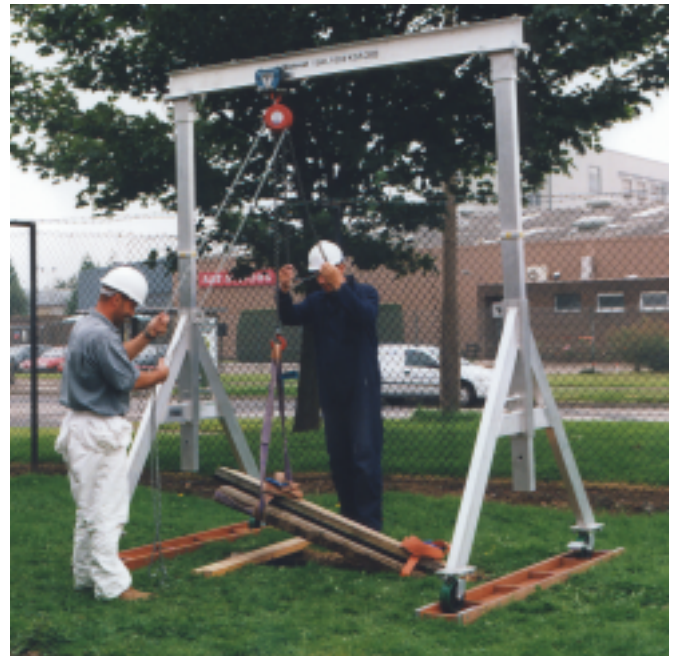
Illustration 4. Lifting the stone.