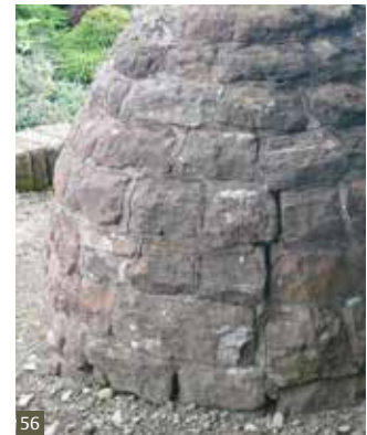
Fig 56 Defective pointing increases the risk of frost damage © Paul Goodwin (2012).

Decayed and loose mortar should be removed carefully using a thin steel hook or knife. Fine joints can also be cut out using an oscillating disc (not an angle grinder or vibrating cutter). The joints should normally be raked out to a minimum depth of 25mm, or twice the width of the joint, whichever is greater. To ensure all the loose and decayed mortar is removed, the joints should be carefully flushed out with water, taking care that the debris is not collected elsewhere on the monument.