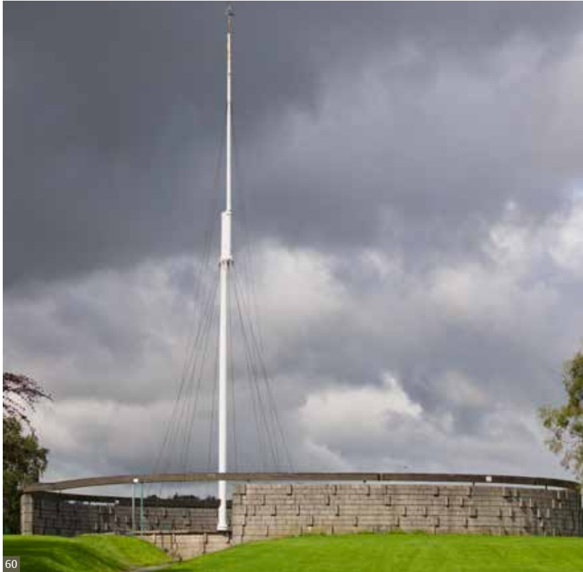
Fig 60 Bannockburn battlefield memorial, Stirlingshire.