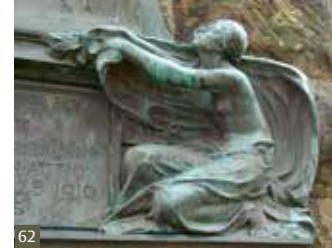
Fig 62 Bronze memorial with verdigris.

Wrought iron armatures may be found within bronze statues, left over from the casting process or as structural support. Wrought iron expands considerably as it corrodes in damp or wet conditions, which can cause 'oxide jacking' of the surrounding material and consequent structural damage to the bronze elements. If water has reached internal armatures the surface of the bronze needs to be checked for physical damage or corrosion and repaired to prevent further water ingress.