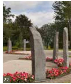
Fig 20 Sanquhar memorial, Dumfries and Galloway © Paul Goodwin (2012).