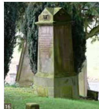
Fig 15 Napoleonic Memorial, Valleyfield Paper Mill, Penicuik.