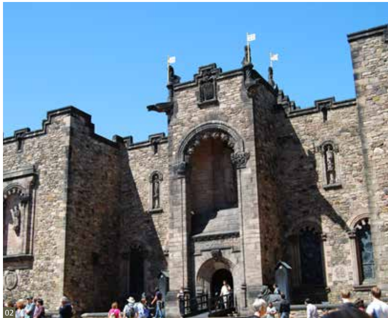
Fig 1 Free standing war memorial, Penicuik, Midlothian.