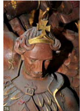
Fig 76 Gilding on the Scottish National War Memorial, Edinburgh Castle.

Carved or painted wooden memorials are quite common in churches and civic buildings, sometimes with gilding or inlaid panels of brass or bronze. Internal war memorials can be at risk from over-cleaning, often by well meaning volunteers or staff. Cleaning should be limited to gentle dusting for painted or varnished wood. Untreated wood can be protected with a natural beeswax polish, applied very sparingly once or twice a year. The use of household cleaners, polishes and water can damage timber elements and should be avoided (Fig 78). Mosaics and other decorative details are sometimes found, although these are not common. Where present and in need of repair, the advice of a specialist conservator should be sought.