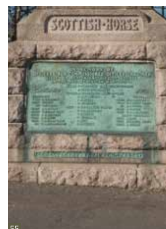
Fig 54 Patchy appearance of masonry following cleaning.