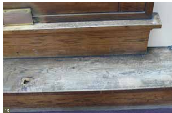
Fig 77 Cleaning gilded elements.