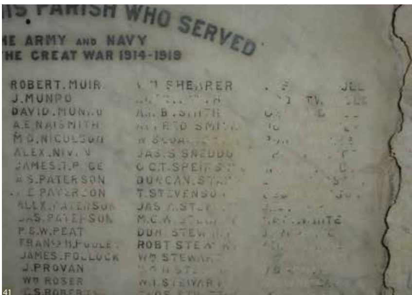
Fig 41 Names can become obscured, defaced or illegible through wear.

Once a record has been compiled, it should be placed in the appropriate Historic Environment Record (HER), locally or nationally. It is helpful to keep old photographs, original newspaper cuttings and documents relating to previous maintenance and repair work. You should also ensure that there is a record of the memorial on the War Memorials Online website and the Scottish War Memorials Project database. Further information may be available in the local HER or the register of war memorials curated by the Imperial War Museum’s War Memorials Archive (see Section 16 Contacts for further details).