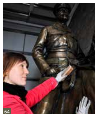
Fig 63 Detail on a bronze memorial obscured by a thick coating of paint © Paul Goodwin.