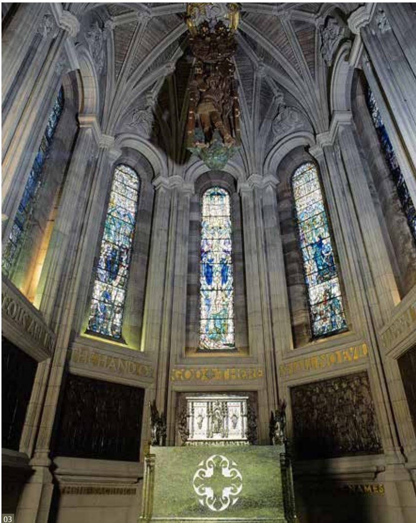
Fig 3 The Scottish National War Memorial, Edinburgh Castle.

This Short Guide summarises the architectural styles and artistic designs of war memorials most often found in Scotland. It considers the types of materials used; the risks to the structures from physical, biological or atmospheric agents; and the appropriate care and maintenance for different types of materials to ensure their long-term conservation. The guidance is focused mainly on monuments, plaques and windows, as these are the most common types.