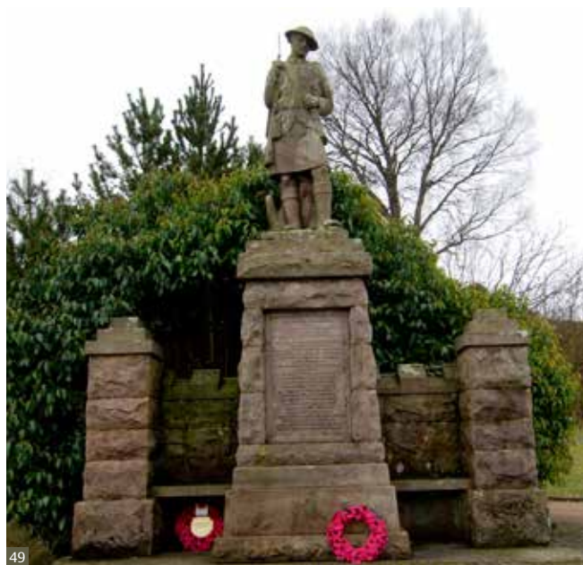
Fig 48 Plant growth shading can encourage damp conditions.