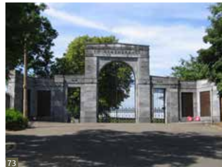
Fig 71 Iron railings enclosing memorial.