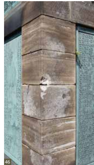
Fig 46 Impact damage to corner of ashlar masonry.