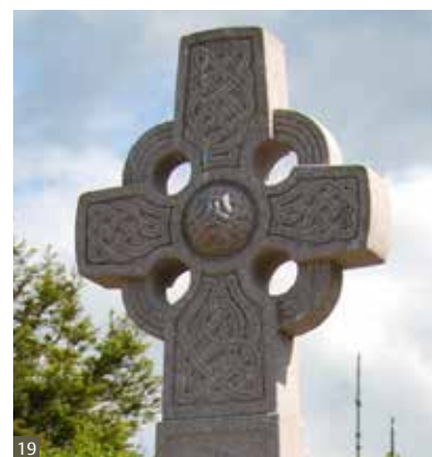
Fig 17 St Martin's Cross, Iona.