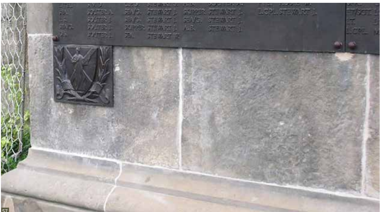
Fig 57 Fine joints re-pointed in lime mortar. Lossiemouth, Moray