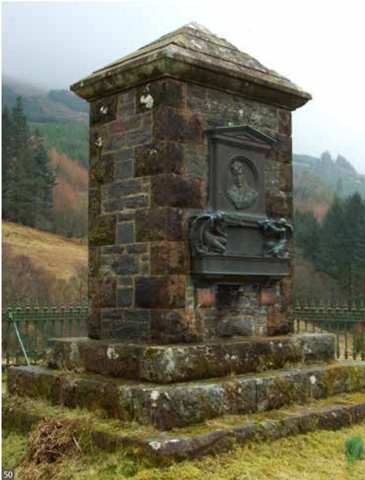
Fig 50 Lichen on old stonework.

As the removal of lichen can damage the stone, it is recommended that removal is considered only in cases where the stone is being adversely affected by the lichen or where inscriptions are obscured. If this is the case, removing the lichen with a stiff bristle brush will usually be sufficient. Where the stone is generally in good condition this can be undertaken by a volunteer. Where the stone is very old or in poor condition a specialist should be consulted. For particularly hard lichen, a water saturated scrim cloth should be applied for a minimum of an hour before attempting to brush or scrape it off. Steam cleaning can also be an effective method of removal and has the added benefit of having a sterilising effect which delays re-growth. Steam cleaning should only be undertaken by a professional.