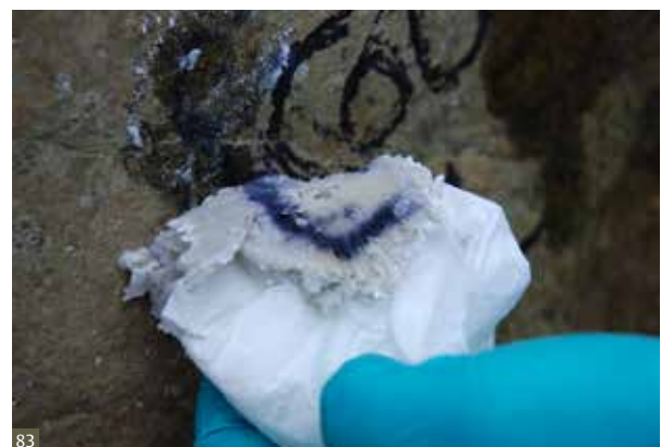
Fig 82 Paint and scratched graffiti on bronze memorial panel.