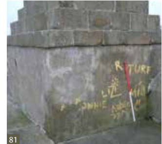
Fig 81 Graffiti on base of monument.

It is impossible to remove graffiti where physical damage has been caused, such as names being carved into the stone. In such cases a judgement has to be made as to whether it is desirable to repair or re-face the affected stone.