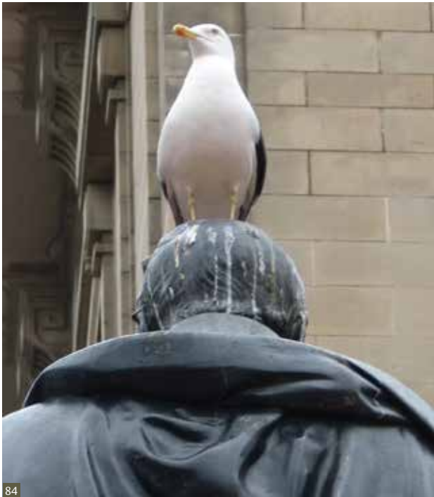
Fig 84 Bird soiling on bronze can be corrosive.

Spikes can be fixed to ledges or flat surfaces to prevent birds landing, however these are visually intrusive and rarely appropriate for war memorials unless the memorial is housed within a larger structure. In some cases, fine netting strung across openings and over roosting sites can physically prevent birds from landing. In most cases this would be unfeasible for war memorials. Bird repellent gels can damage the surface of metals and stone and are not recommended. In some cases, decoys of birds of prey placed nearby may be effective at preventing roosting. For many memorials in urban areas, the only solution may be regular maintenance and surface cleaning to prevent a build up of bird droppings.