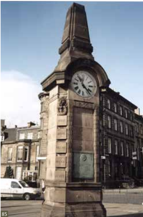
Fig 85 Heart of Midlothian war memorial, Haymarket, Edinburgh.

War memorials are often attached to buildings that were important to communities, such as a church, village hall or factory and these memorials can be vulnerable if the building becomes disused. Proposals to remove memorials sometimes come up when a community relocates, or a building closes or is sold. In such circumstances it may be necessary to relocate the war memorial if it would otherwise become inaccessible. Unless a memorial is listed in its own right, it would cease to be listed upon removal from the listed building, so arrangements as to its future location, care and maintenance would need to be agreed before it is removed. See War Memorials Trust's helpsheet Relocation of war memorials for further guidance.