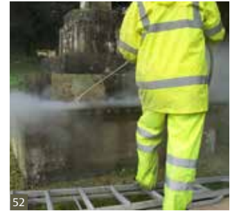
Fig 52 Steam cleaning a war memorial © West Lavington Parish Council (2010).

Proprietary low pressure cleaning systems employ a specialized nozzle, which delivers water mixed with a very fine abrasive powder. The process tends to be less aggressive than other forms of pressure washing as the particles used are very fine and applied in a vortex rather than directly onto the surface. This method can also be used without water to deliver a low pressure abrasive clean and can be effective at removing pollution crusts, particularly from sandstone. The skill of the operative is essential in ensuring no damage is done to the monument. Used incorrectly, such methods can cause loss of definition to tooled finishes and roughening of the stone.