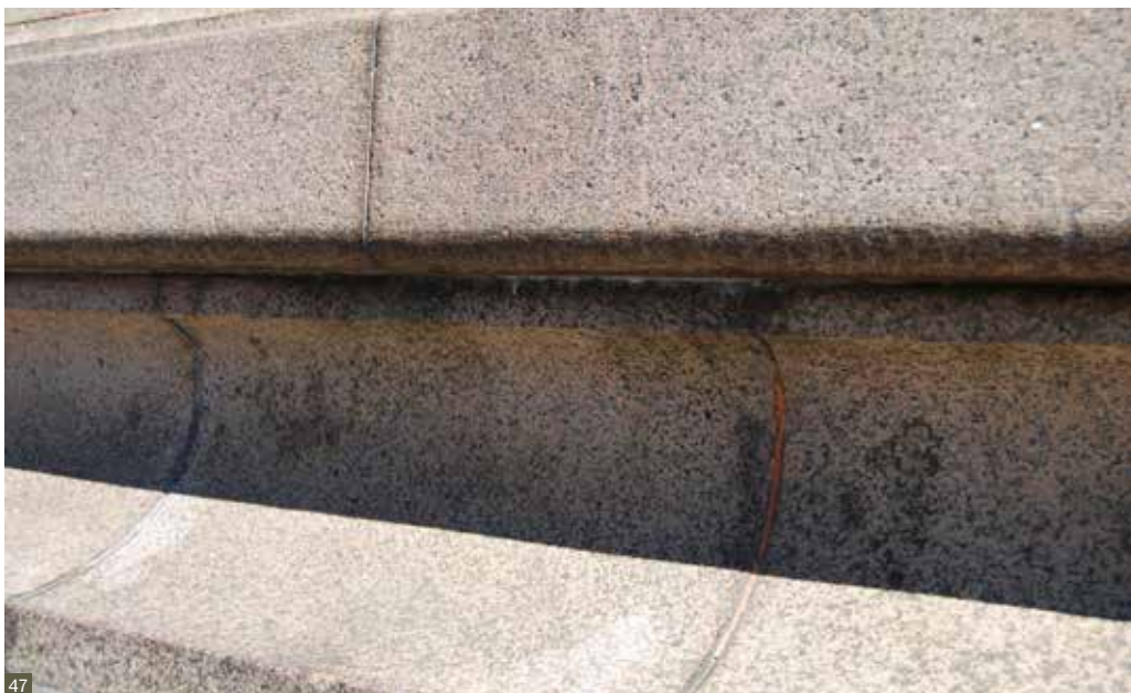
Fig 47 Abrasive cleaning can roughen the surface of polished or dressed masonry.