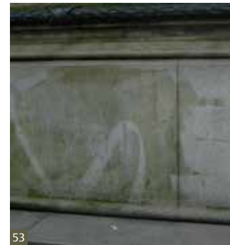
Fig 53 Uneven or aggressive cleaning can cause discolouration.

Poultices are typically applications of fibrous or clayey materials containing water and/or other solvents. They work by drawing the stain out of the stonework. Poultices containing sequestering agents are available for the removal of metallic stains (Fig 55). Sequestering agents chemically isolate specific staining components, forming soluble compounds which can then be removed from the surface. Run-off staining from metal is normally a result of a lack of maintenance of the protective coating (wax, paint or patination oils). If this coating is not maintained after cleaning the staining will re-appear.