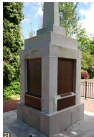
Fig 51 Bio-colonisation after cleaning.

Before carrying out stone cleaning on any monument a small trial panel in a discreet area should be prepared to determine the effect of the cleaning method on the stonework. On memorials where there are different stone types or where there is a variety of soiling, several test panels may be necessary. Once the procedure and level of cleaning has been agreed the trial panel should remain until the majority of the work has been completed so that it can be used as a 'control'. This can also help to avoid disputes.