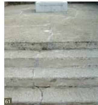
Fig 61 Concrete elements can be vulnerable to cracking, Craigie, Ayrshire © Craigie Community Council (2012).

It is not unusual to find concrete as part of a war memorial, often forming steps, bollards or other boundary elements. Sometimes the entire memorial may be concrete. Whilst not strictly a war memorial, the battlefield monument at Bannockburn is one example, formed of two semi-circular walls of cast concrete representing the opposing sides (Fig 60).