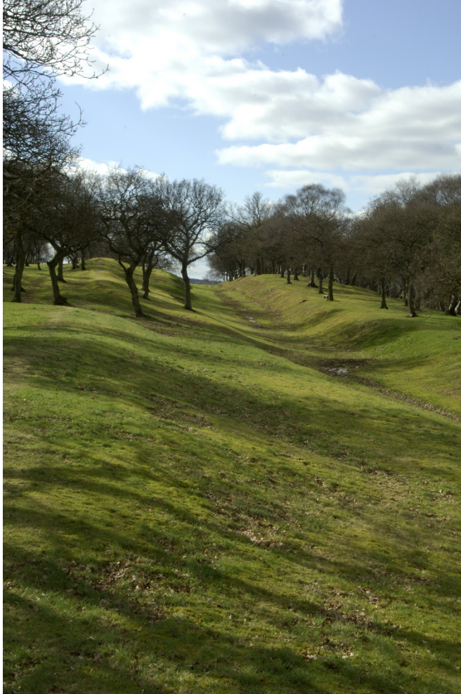
Rampart and Ditch at Seabegs Wood, looking west