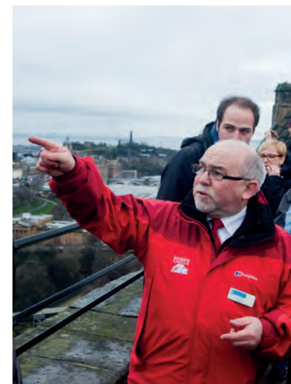
Above left: Expert guides lead the way around Edinburgh Castle

Historic Environment Scotland is responsible for more than 300 properties of national importance. Edinburgh Castle, Neolithic Orkney and Fort George are among the buildings and monuments in our care, along with numerous smaller sites. Together they draw millions of visitors each year.