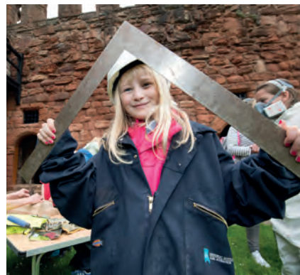
Clockwise from left: Schoolchildren taking part in a traditional skills workshop at Bothwell Castle; Scotland's new Engine Shed, an interactive learning hub where the past meets the future; The Edinburgh Traditional Building Festival Event at Craigmillar Castle; World Heritage Day – children using the latest in cutting edge virtual reality headset technology