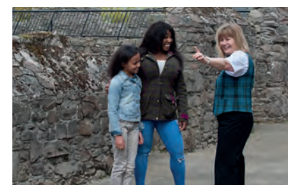
Left: Help is always on hand