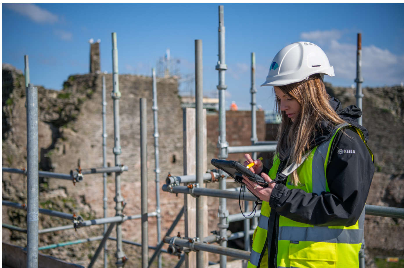
Image: Inspections taking place at Rothesay Castle

We want the historic environment to make a real difference to all our lives: to our health, to our economy, to our culture, to our environment. We want heritage to involve everyone so that all can benefit.