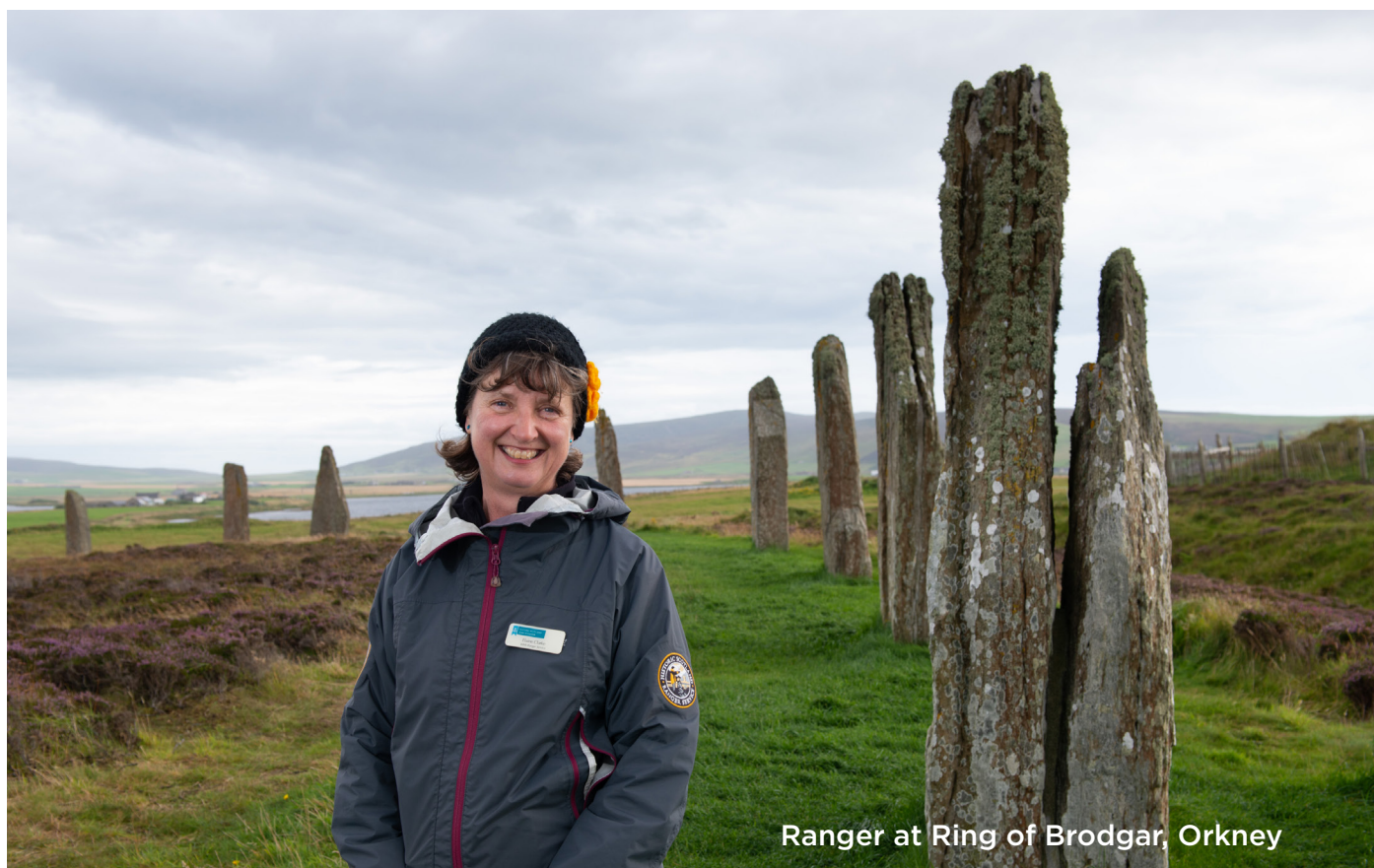
Ranger at Ring of Brodgar, Orkney

- Not Achieved: Delivered less than 60% of the annually planned digital activities and the approved investment project milestones by 31 March 2025