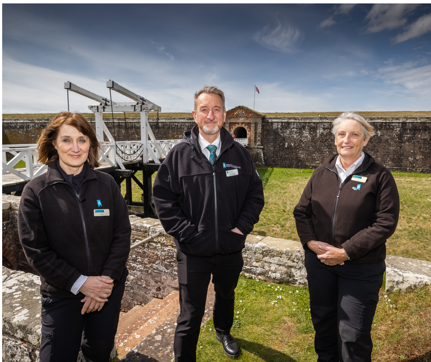
Image: Stewards at Fort George