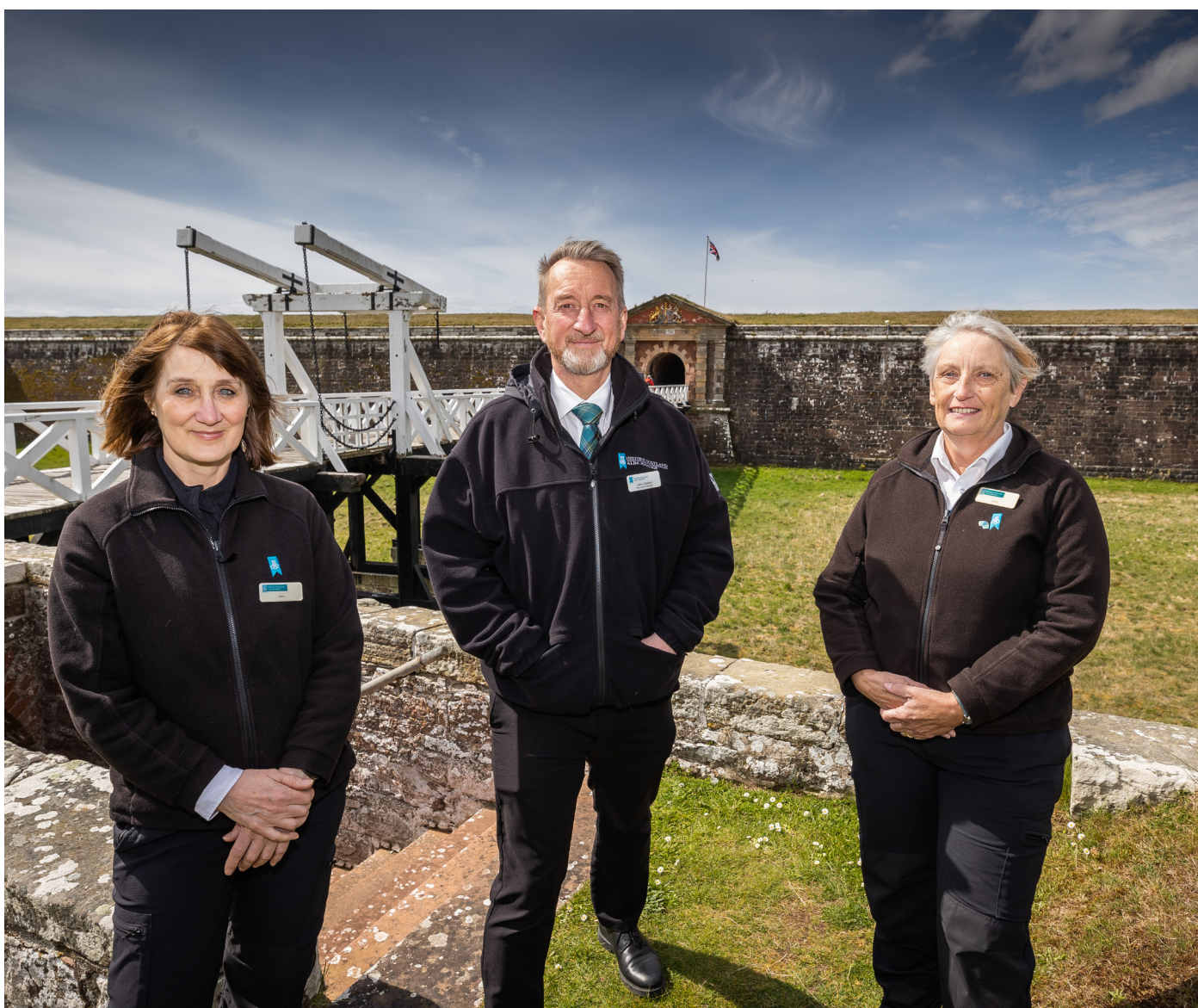
Image: Stewards at Fort George

- Not Achieved: Delivered 49% or less of actions planned for 2024-25 by 31 March 2025