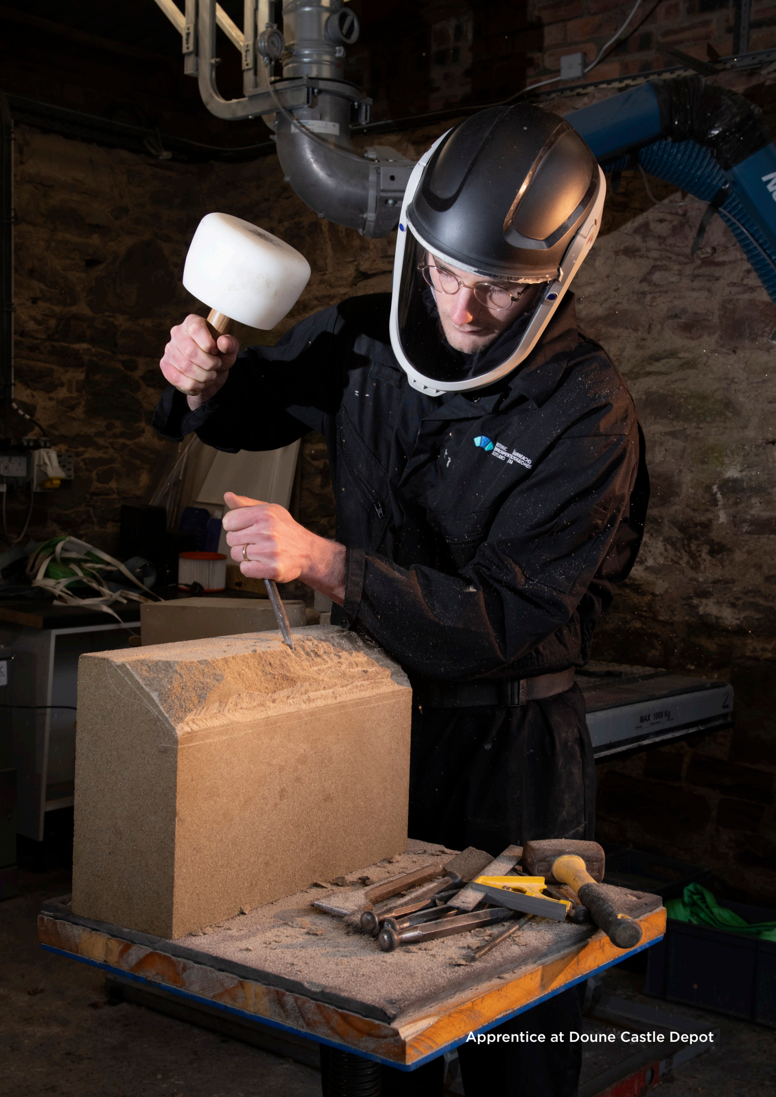
Apprentice at Doune Castle Depot