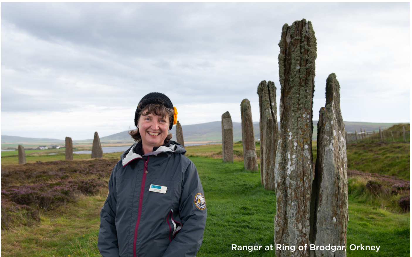
Ranger at Ring of Brodgar, Orkney

- Not Achieved: Delivered less than 60% of the annually planned digital activities and the approved investment project milestones by 31 March 2025