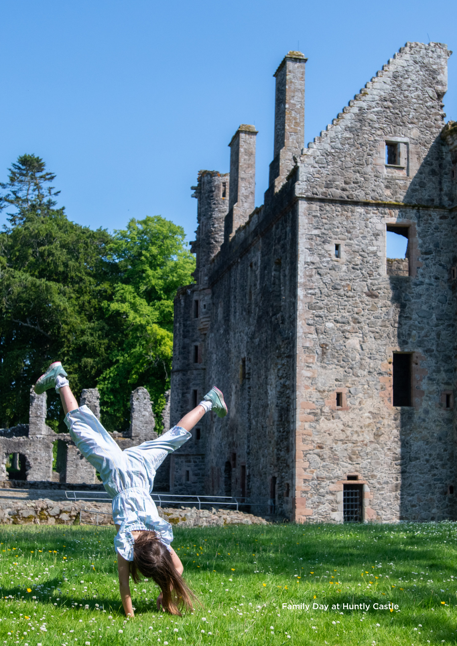
Family Day at Huntly Castle