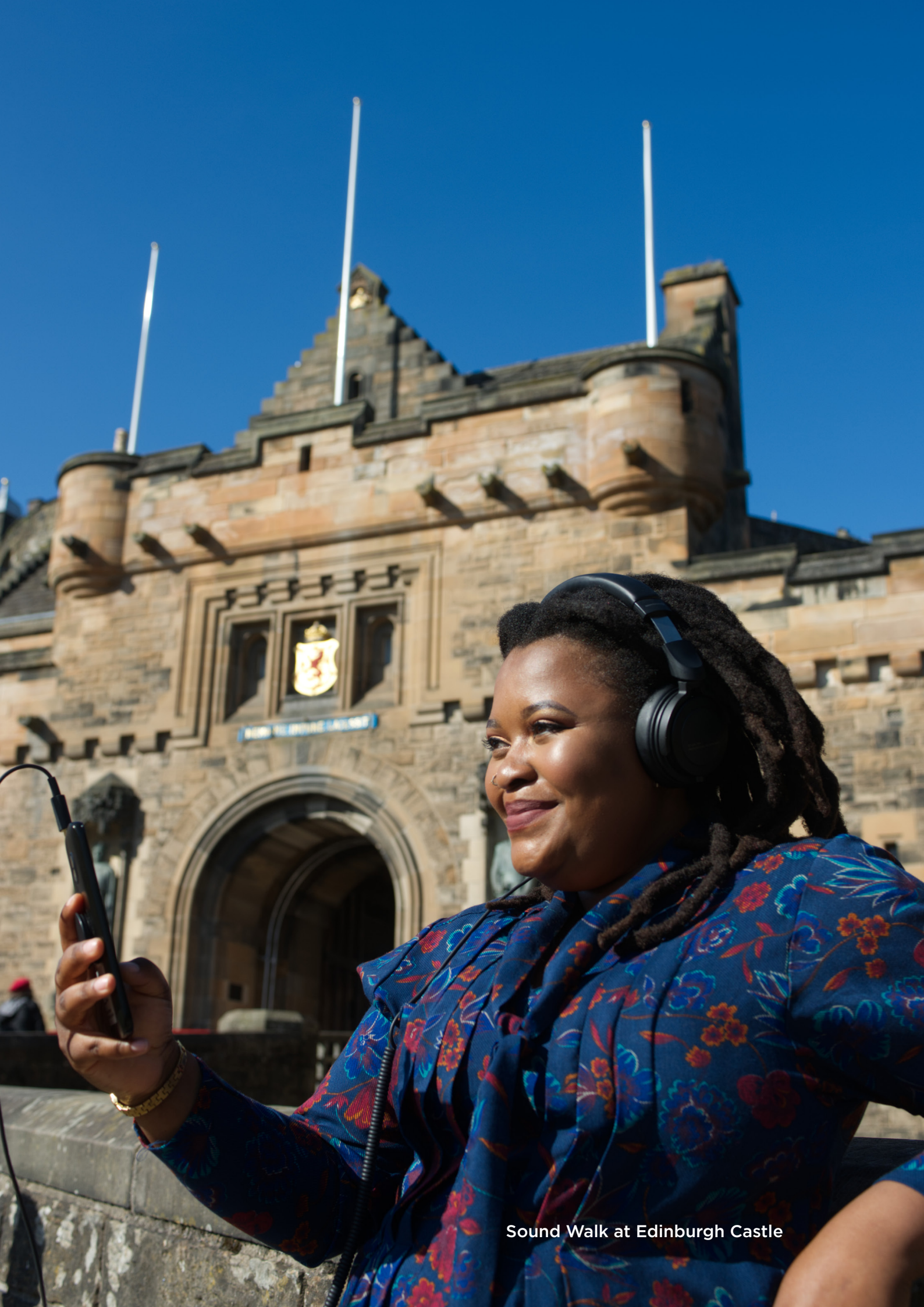
Sound Walk at Edinburgh Castle