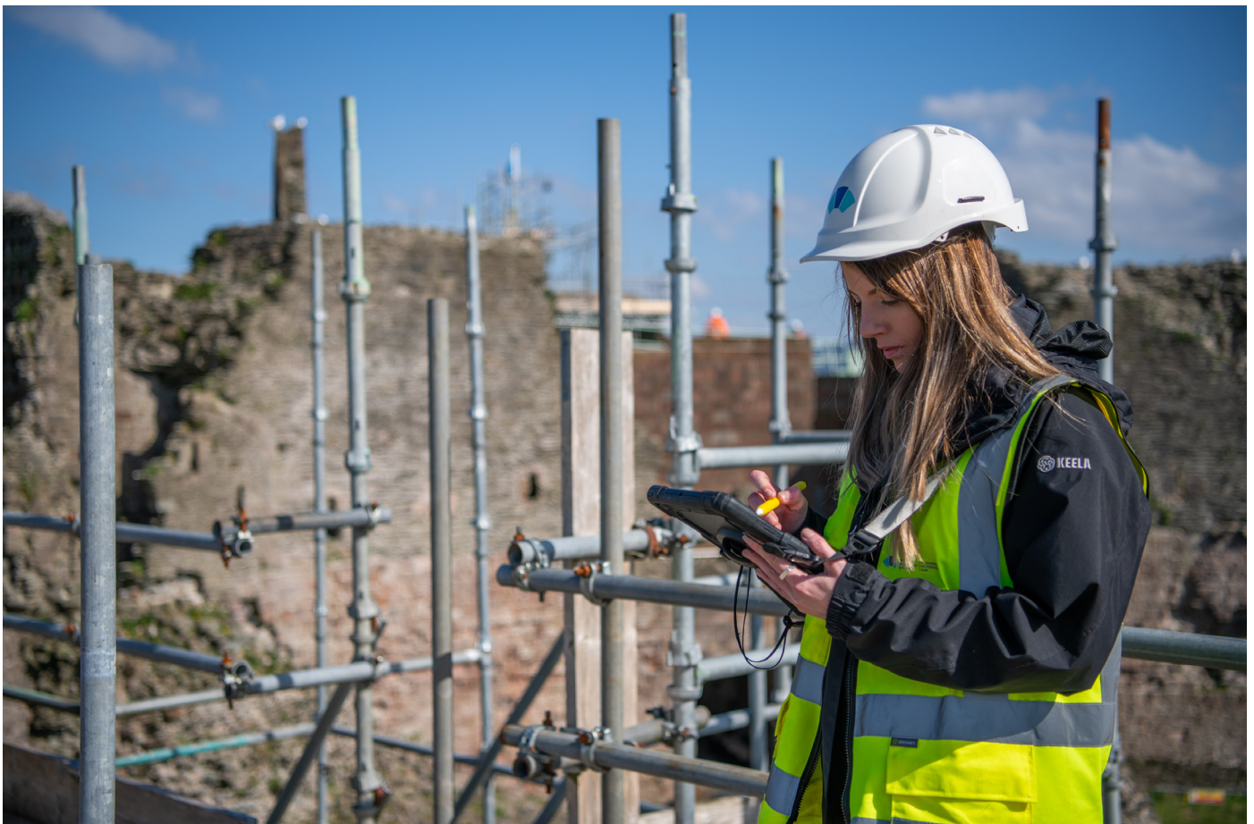
Image: Inspections taking place at Rothesay Castle

We want the historic environment to make a real difference to all our lives: to our health, to our economy, to our culture, to our environment. We want heritage to involve everyone so that all can benefit.