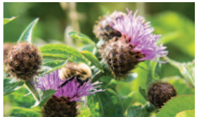
Common carder bumblebee, Croy Hill

Although the Antonine Wall WHS runs through the highly urbanised and industrialised central belt of Scotland, large areas of it still remain in rural or non urban settings. These areas may include protected habitats or species, important geological sites, or sites with natural heritage designations as well as cultural heritage designations. Balancing the needs of both can sometimes prove challenging for Partners and stakeholders. Land management regimes, for example, that benefit the cultural heritage and landscape, may not meet biodiversity needs, and could even be harmful for certain species or habitats. Similarly, managing the impact of nature on the archaeological resource, in terms of land use/maintenance and animal activity, poses specific pressures at different areas of the Site. Agricultural activity such as ploughing or stock control issues may require discussion on land management approaches.