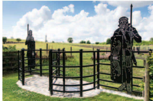
New access gate, Castlecary, erected by North Lanarkshire Council