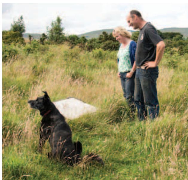
Visitors at Croy Hill

An Interpretation Plan and Access Strategy was written during the period of the first Management Plan, with part of the work including an audience survey to determine public perceptions of the wall and to gather evidence of needs and expectations from visitors. It highlighted a suite of works along the length of the Wall that should be undertaken to optimise visitors' experiences, enhance enjoyment and understanding for both local people and other visitors, and extend overall appreciation of the universal significance and status of the Antonine Wall WHS and its setting. As part of the process a new 'brand identity' was created for the Wall with a logo and guidance for all Partners on the standardised production of interpretive and promotional materials. Following a public consultation exercise the plan has been adopted by all Partners and they are now drawing up action plans to deliver key elements of these proposals.