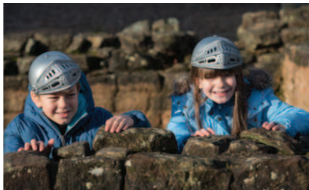
Getting into character at Bearsden Bath-house