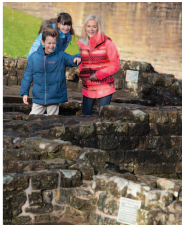
Exploring the Antonine Wall