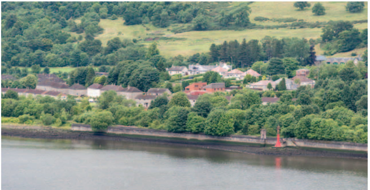
Olk Kilpatrick, site of the most westerly Roman fort on the Antonine Wall

It is hoped that by the end of this five-year management Plan period, the Antonine Wall will be more strongly positioned as a national and international visitor destination, that management and monitoring approaches will be more closely aligned internationally and, crucially, that people should continue to have the opportunity to actively contribute to the development of the World Heritage Site.