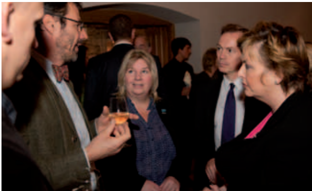
The Cabinet Secretary, Fiona Hyslop, with international partners from the Antonine Wall, Hadrian's Wall and the German Limes

To contribute to the development of management principles for the international community on the identification, recording, research, protection, conservation, management, presentation and understanding of the Roman frontier