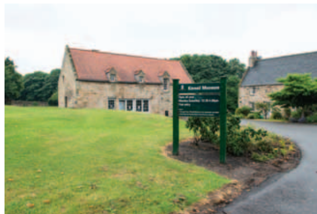
Kinneil Museum, Bo'ness

In Glasgow, the Hunterian Museum's Antonine Wall redisplay opened in September 2011 and other museums with Roman interpretation exist at Callendar