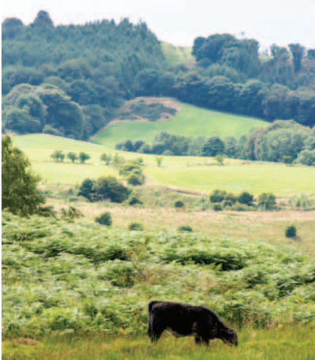
Forestry Commission cattle on Croy Hill, with Bar Hill in the background

During the consultation process to develop this Management Plan, several recommendations and requests were made for inclusion in the Plan that could not be accommodated within this five-year Plan period. This may be because of financial constraints, because the infrastructure required to deliver them is not yet developed, or because other priorities are more urgently required and thus assume precedence in developing the site.