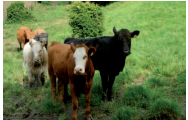
Cattle poaching can damage the site

Objective 1.4 Capacity Building to ensure that knowledge and understanding of the OUV of the World Heritage Site remains current amongst decision makers risk. Thus international co-operation and management of the sections of the FREWHS in line with best practice will be essential