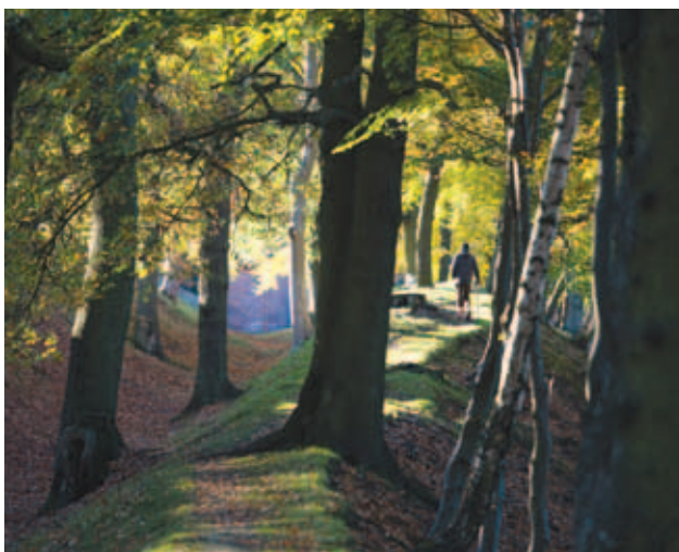
Autumn at Watling Lodge