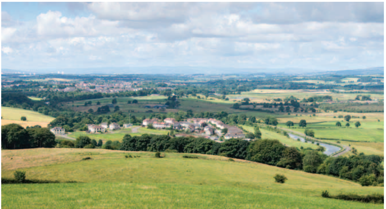
The Antonine Wall’s location in central Scotland means that both residential and industrial development must be carefully managed to protect the WHS and its setting