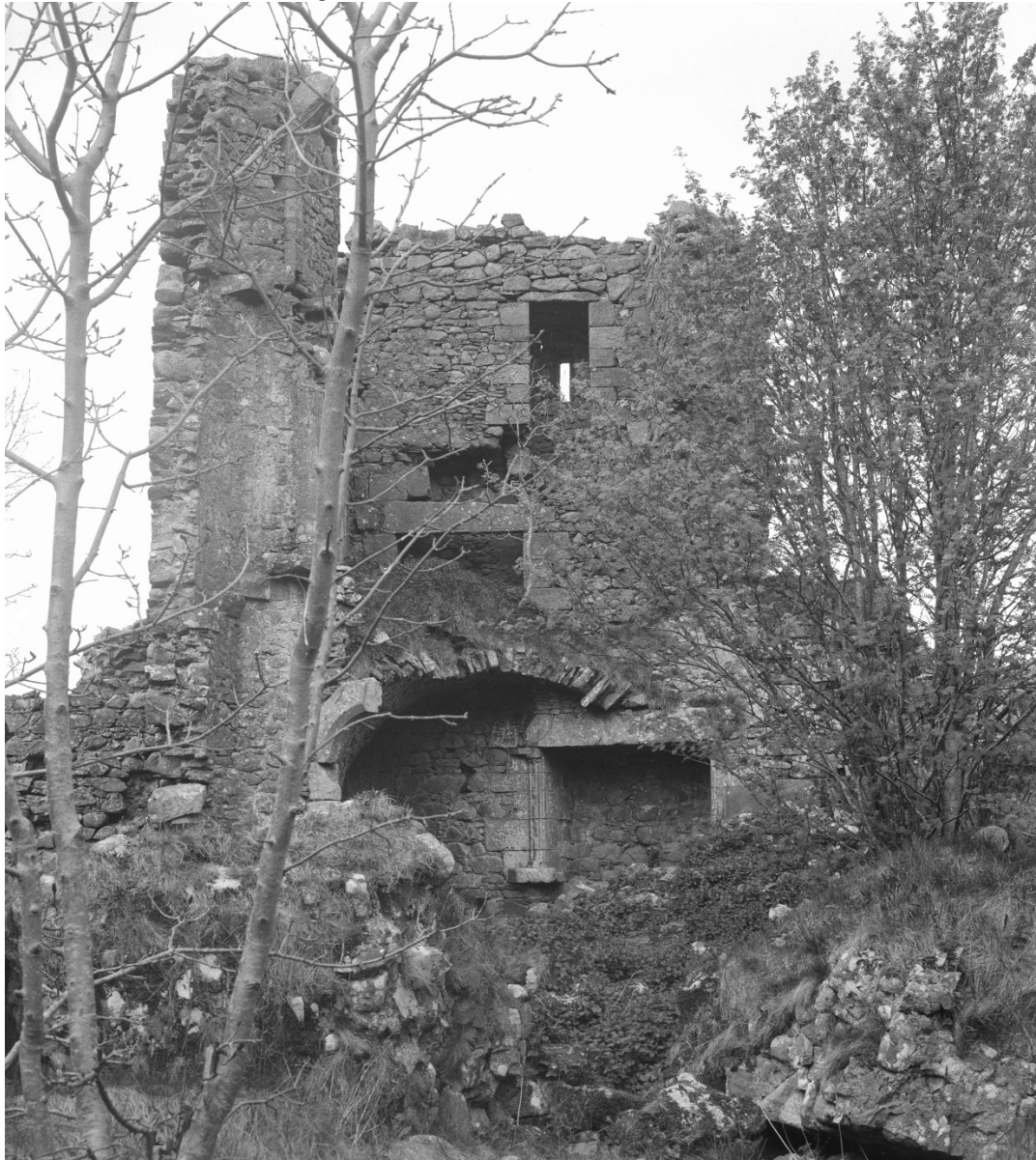
Figure 11: Interior of the Kennedy tower. The fireplace obscured here by a vault is considered to be pre-dating the construction of the tower. The tower was not re-constructed on the shore (SC 1206929 © HES (Scottish Development Department)).

A keep constructed against the western curtain wall of the castle is believed to originate in the 16th century. It rose to at least four stories with a vault at first-floor level. This appears to have been crudely inserted into the curtain, with the upper two floors of the tower lying on a slightly