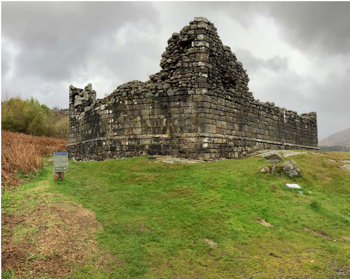
Figure 3: Loch Doon Castle walls from south-west.

some evidential potential to remedy this, though disturbance, exposure and rising water levels may be detrimental to their condition.