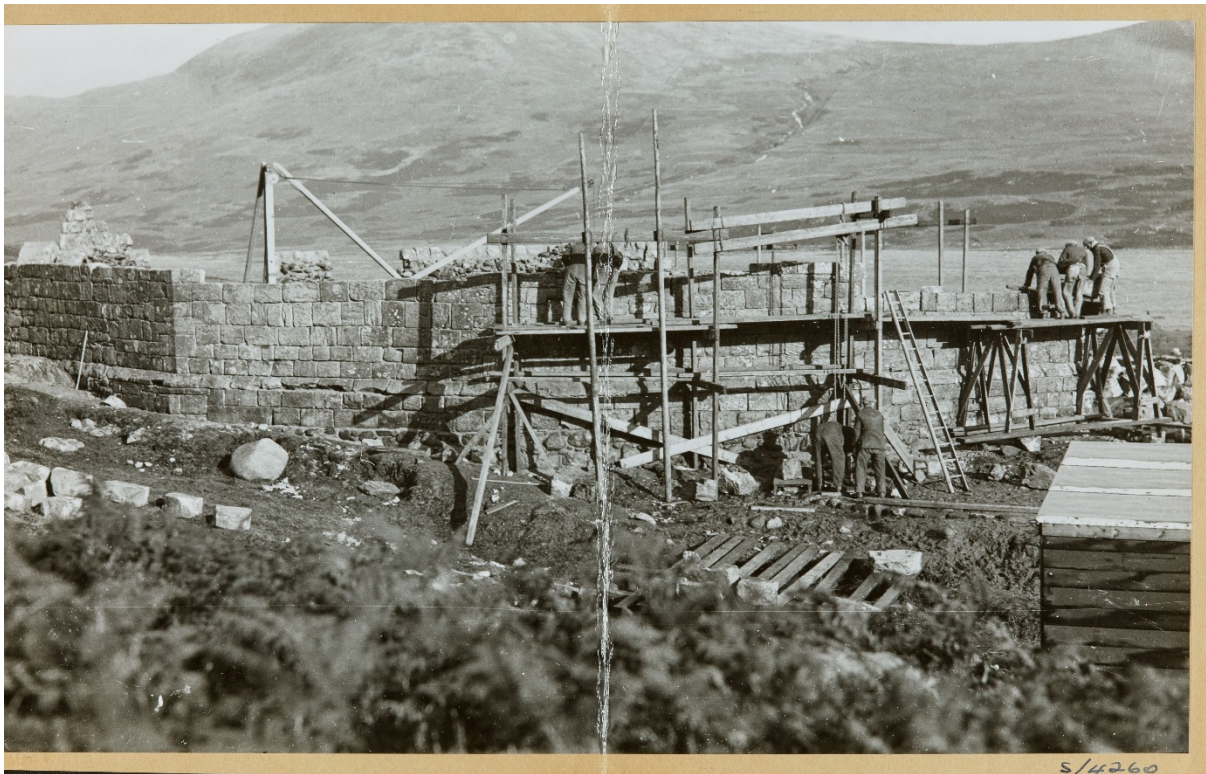
Figure 14: Photograph of the re-erection work during the 1930s (SC 2021811)

Loch Doon was to be dammed in 1936, raising the water level by 38ft (11.6m). 69 This would submerge much of the castle and, as a consequence, the Ministry of Works (MoW) embarked upon a truly monumental task: the dismantling, removal, and exacting reconstruction of the castle on the Loch's shore.