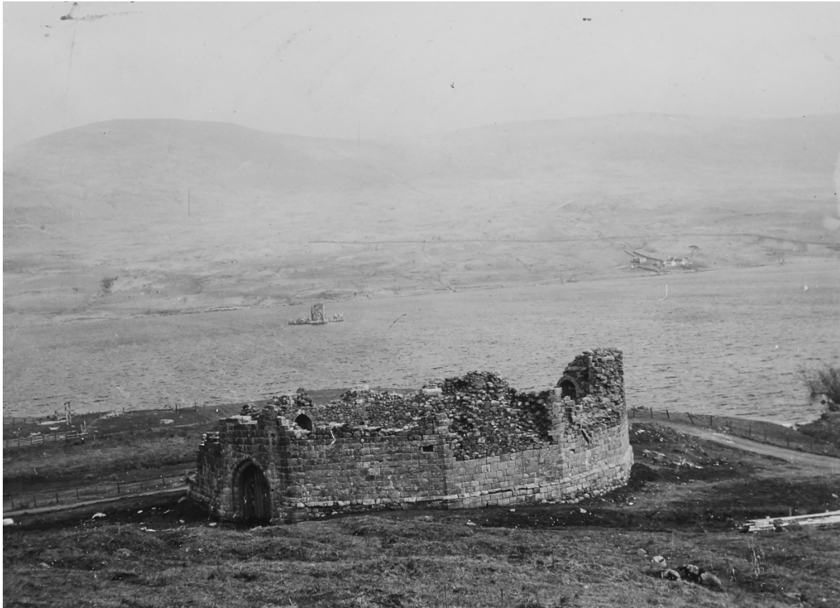
Figure 12: Photograph taken in April 1937, shortly after the re-erection work was completed. In the background is Castle Island with the Kennedy tower before it collapsed (SC 2021834) © Crown Copyright: HES.

Proposals to dam Loch Doon were made in the 1930s, and it was this that prompted the dismantling of the castle to be re-erected on dry land. For the castle's re-erection, each stone was numbered, removed, and then rebuilt into the castle on the shore. The later tower was not reconstructed in 'order to leave the more interesting early castle unencumbered'; 49 however, as discussed above, the rising costs of the reconstruction meant some elements were left on the island. It is likely that logistical considerations also contributed to the tower not being rebuilt, as this would have required significantly more scaffolding to reach the heights required. It is unknown if the foundations of the buildings, besides those of the tower, are based on layouts observed in the original castle. It seems likely, however, that those of the hall and the building on the north side, are conjectural – these buildings are not visible in aerial photography of the original castle.