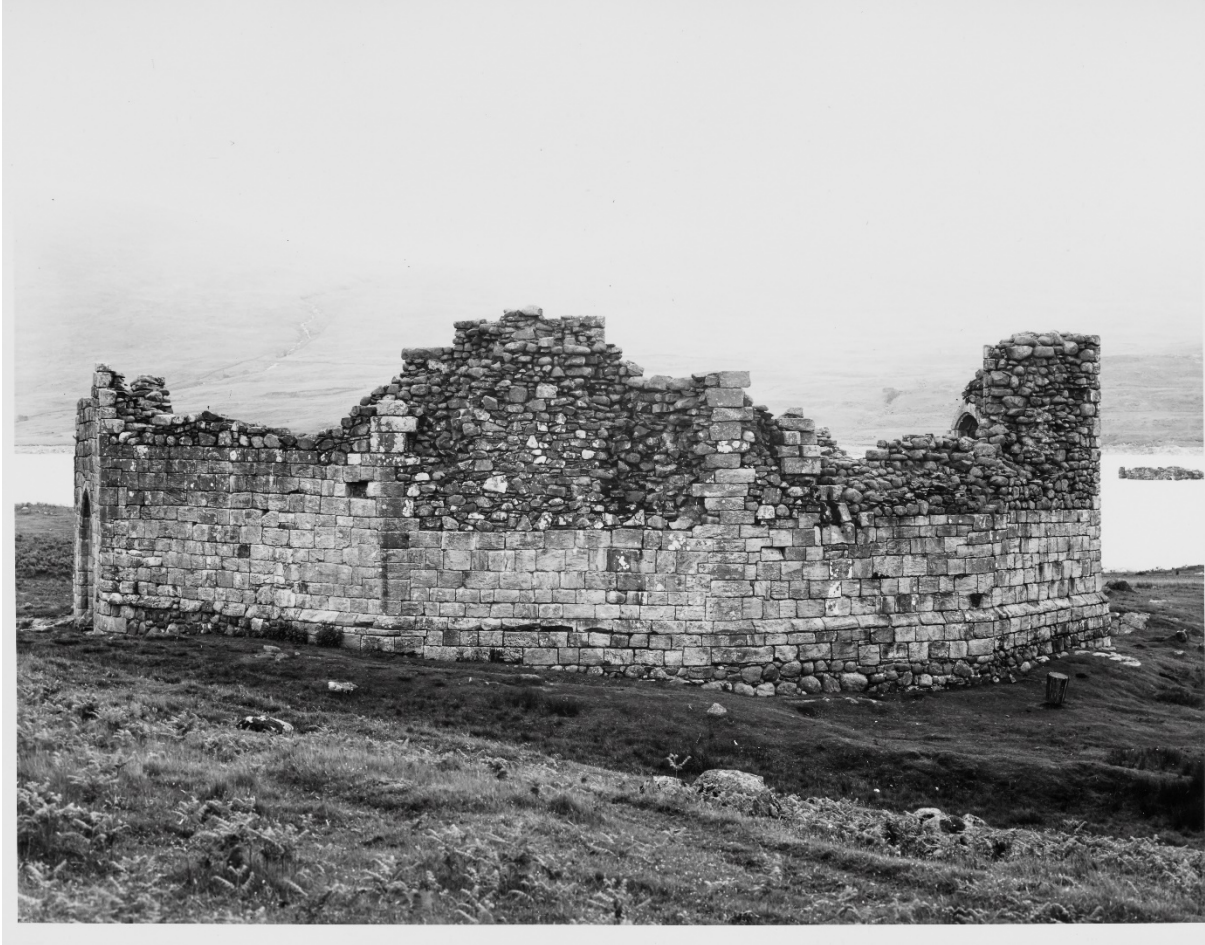
Figure 7: Exterior view of the curtain wall (SC 2021676)

There is an obvious change in masonry within the curtain wall where the lower courses are formed from very fine ashlar blocks and the upper curtain wall and the tower are created from 'inferior rubble work'. 37 The traditional view is that Loch Doon Castle was destroyed by fire before being reconstructed in the 16th century. Ostensibly this explains the obvious change in masonry, however, in photographs of the castle in its original location, very few ashlar blocks are visible in the rubble around the castle. Had the original castle been constructed of ashlar in its entirety, it is reasonable to expect that much of the remains of this would be apparent, either in the tumble around the castle, or incorporated into its rebuild in the 16th century. There are a number of reasons as to why so much ashlar may not be visible: