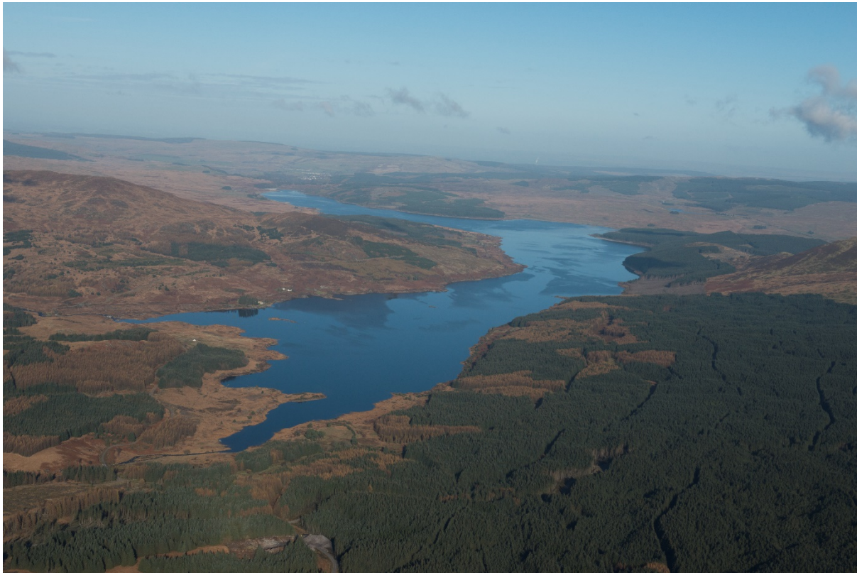
Figure 13: General oblique aerial view of Loch Doon, looking north-east (DP 201166)

With their often-compact size and strong curtain walls, castles of enceinte were often strongly defended and challenging for would-be attackers. Loch Doon Castle is exemplary in this regard as a secluded, remote stronghold that would be difficult to access. Though relocated to the loch's shore, the Property in Care retains many of these characteristics, and the surviving visual relationship with the castle's original island location allows its unusual setting as a building on water to be readily appreciated. Castles of enceinte with similarly remote and watery settings are unusual, the most obvious example being Lochindorb Castle in Highland.