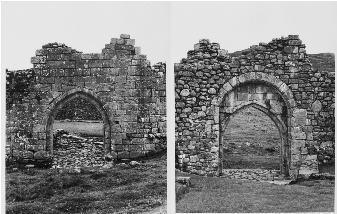
Figures 9 and 10: External (left) and internal (right) view of the entrance gate to Loch Doon Castle in its current location (left: SC 2021678 and right: SC 2021677, both images © Crown Copyright: HES).

The main entrance to Loch Doon Castle comprises a simple but imposing pointed arch of two chamfered 43 orders. The curtain wall is at its thickest across this entrance, with the plinth course rising in height before it meets