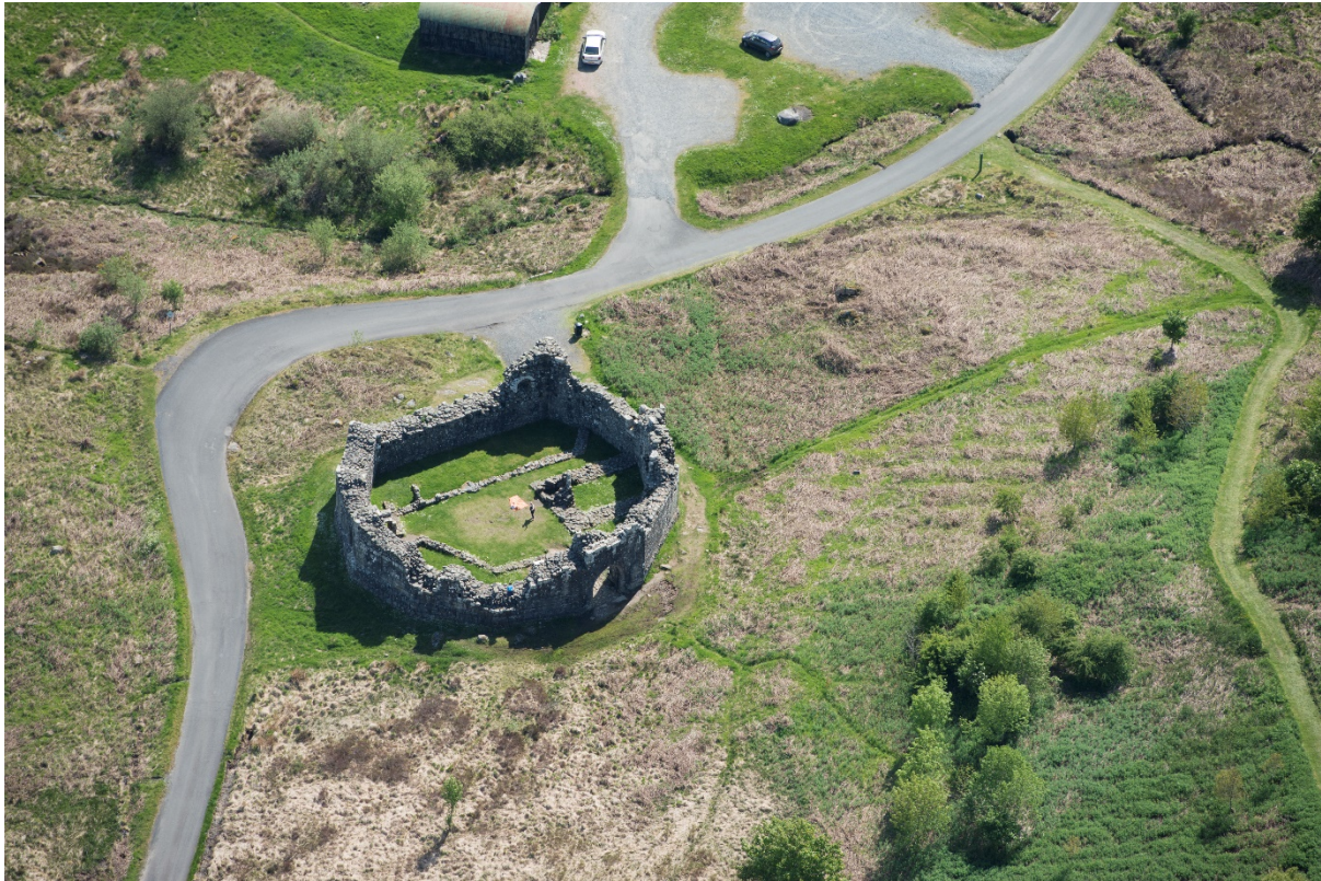
Figure 2: Oblique aerial view of the re-erected site of Loch Doon Castle, looking to the south-south-west (DP 159783).

The castle's enceinte is uniquely eleven-sided and D-shaped on plan. The shape may have been determined by the shape of the island, however, architectural licence was most likely also involved in the final form of the castle. The longest side faces the south, likely to maximise the benefits of sunlight in a building range of which this side of the enceinte was the south wall. The enceinte's outer face distinctively comprises two dramatically different construction methods: finely dressed ashlar blocks form the lower courses up to a height of approximately 2-2.5m, laid beneath more randomly arranged rubble. The reason for this change is uncertain. The ashlar extends to the castle's detailing, which include finely moulded pointed archways throughout. The castle's main entrance, to the north, is large for a castle of this size, and would have contained a portcullis. A small postern (side) gate is located in the enceinte's eastern side. To the west are the remains of a later medieval keep, believed to have been added to the castle in the 16th century. The re-erected remains do not include this later tower.