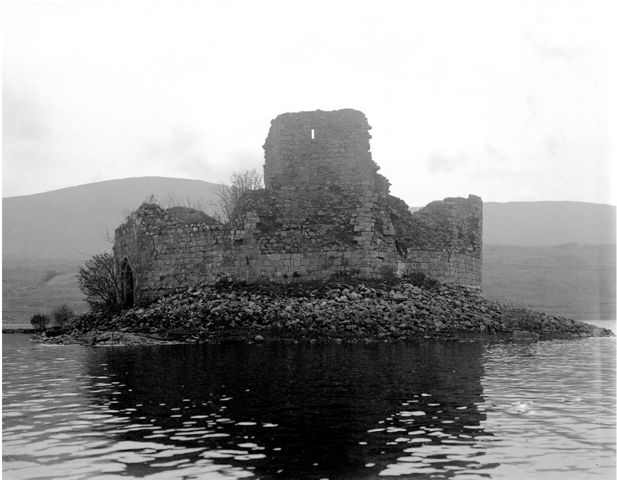
Figure 5: External view of Loch Doon Castle on Castle Island before it was dismantled in 1935 (SC 1206923) © HES (Scottish Development Department).

In the 19th century, the castle's ruins were quarried for the construction of a nearby shooting lodge, prior to which 'a large portion of this remote insular fortress was entire, and it contained a magnificent staircase of seventy steps'. 34