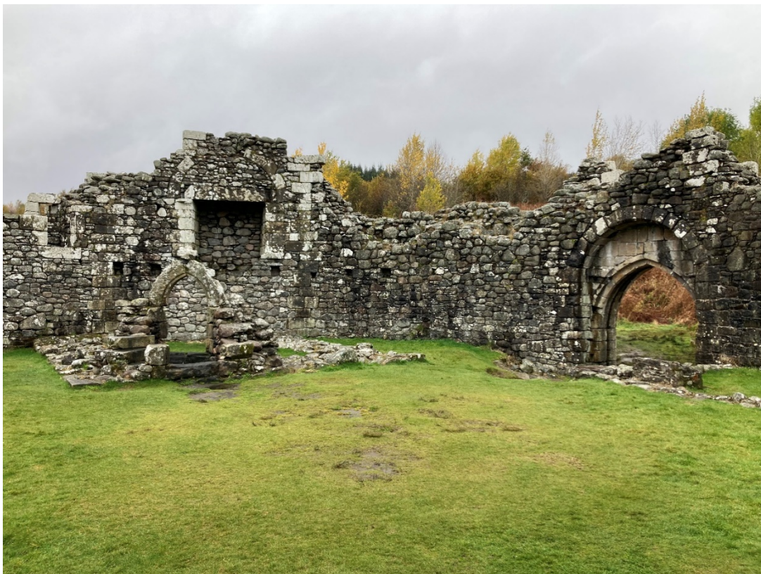
Figure 8: View of the central fireplace in the western wall with the supporting arch disturbed and infilled with rubble in the re-built © Joss Durnan.

The second run of putlog holes, those in the west elevation, may be indicative of a domestic chamber to be used by the castellan or earl when in residence. The large fireplace in the curtain is positioned centrally in this run of putlog holes, and the disturbance of the supporting arch above it by the later tower's vault demonstrates that it existed prior to the later tower's construction.