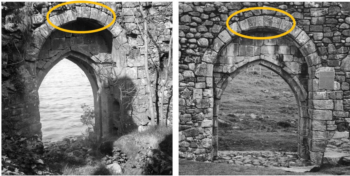
Figure 4: The slipped voussoir of the main entrance to the castle on Castle Island (left photograph) and the re-set voussoir of the main entrance to the castle on the shore (right photograph). (SC 1206901 on left © HES (Scottish Development Department) and SC 2021677 (cropped) on right © Crown Copyright: HES).

The castle's re-erection has resulted in any subtleties present in the castle's phasing being lost. This includes, for example, any repairs or modifications to the castle's masonry (particularly in the rubble elements where this would be more discernible) that occurred prior to its dismantling. The re-erection also shows evidence of minor structural problems having been rectified when it was relocated, for example the re-setting of slipped voussoirs (wedge-shaped stone forming one of the units of an arch) in the main entrance and postern.