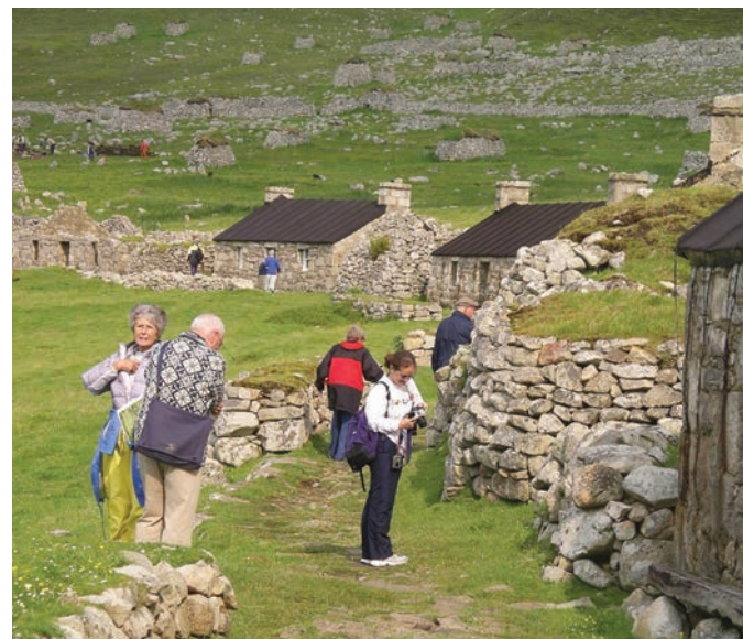
Visitors explore the village.

NTS own and care for the WHS. A Strategic Management Group and an Operational Management Group, composed of representatives of all the Partner organisations, coordinate and implement the aims and objectives set out in the WHS Management Plan. Effective coordination between the Partners is achieved through the NTS, who lead on the implementation, monitoring and revision of the Management Plan and associated action plans and objectives.