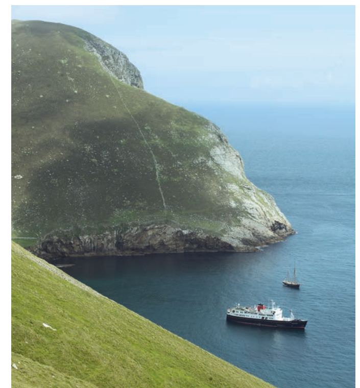
Precipitous slopes and cliffs characterise the islands; © Crown Copyright HES.