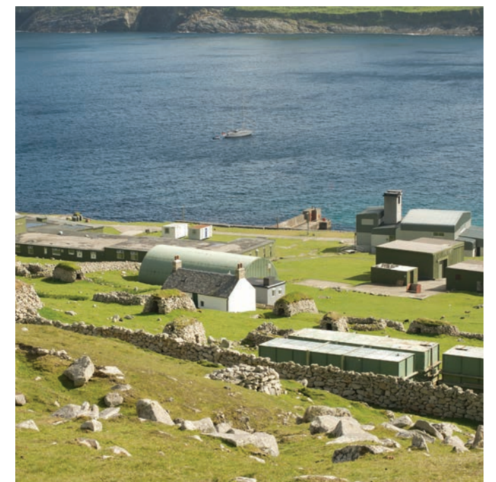
MoD base in Village Bay; © Crown Copyright HES.

Management of St Kilda is defined by NTS's Conservation Principles; Access, Enjoyment and Education Principles and other relevant Trust policies; and by UNESCO's Operational Guidelines for the Implementation of the World Heritage Convention . The Management Plan sets out a series of ten Guiding Principles. Together they provide the framework for long-term management of St Kilda and a basis for selecting and assessing objectives.