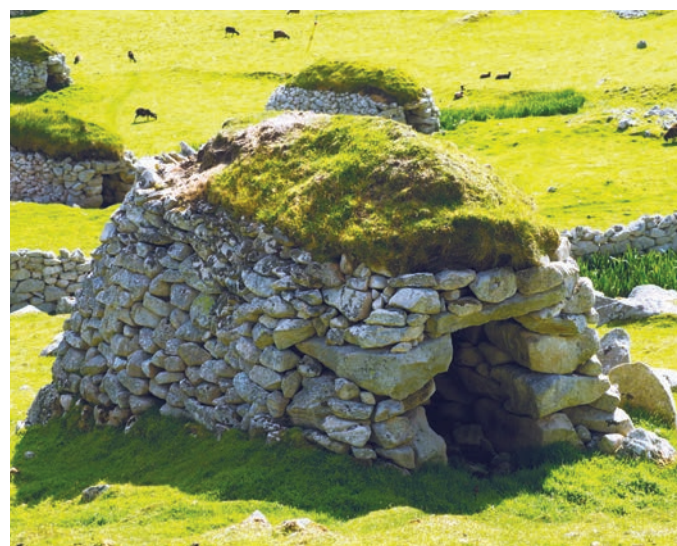
A cleit; © Crown Copyright HES.