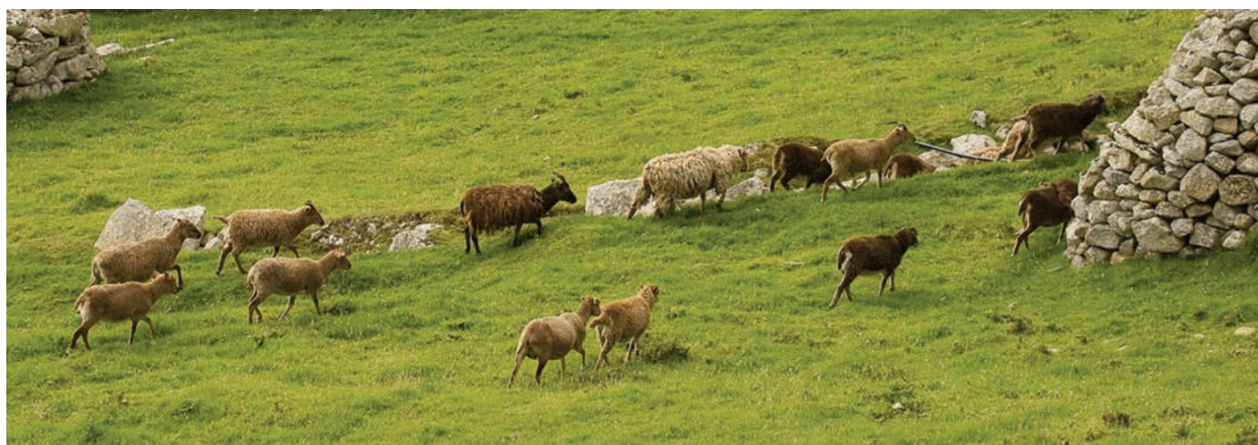
Soay sheep roam the landscape; © Crown Copyright HES.

The cultural landscape of St Kilda is an outstanding example of land use resulting from a type of subsistence economy based on the products of birds, cultivating land and keeping sheep. The cultural landscape reflects age-old traditions and land uses, which have become vulnerable to change particularly after the departure of the islanders.