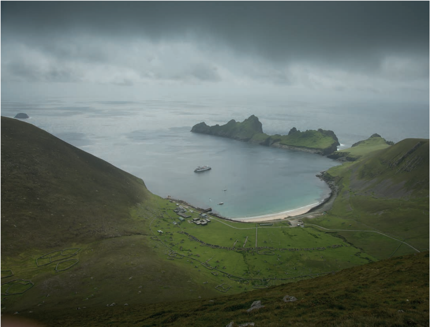
Village Bay seen from the slopes above.