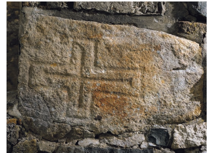
Early Christian carved cross; © Crown Copyright HES.

Criterion (x): Contain the most important and significant natural habitats for in-situ conservation of biological diversity, including those containing threatened species of outstanding universal value from the point of view of science or conservation.