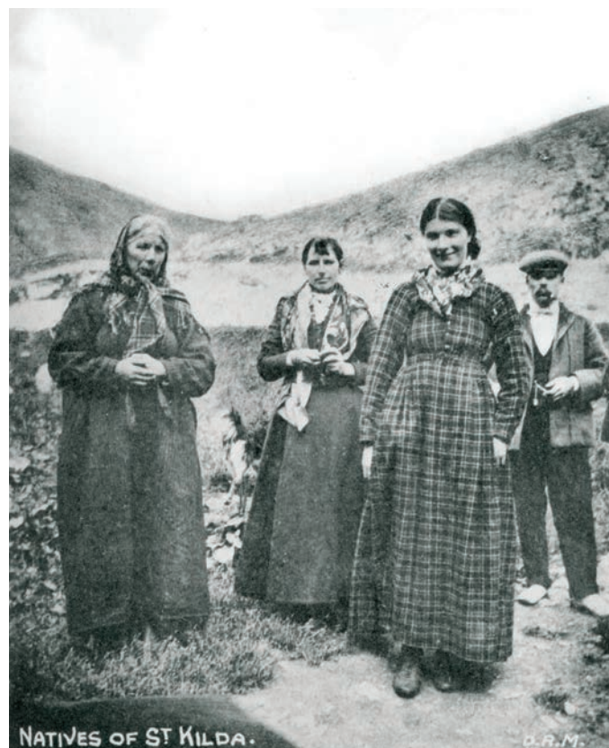
St Kilda residents ; fulmar and thrift