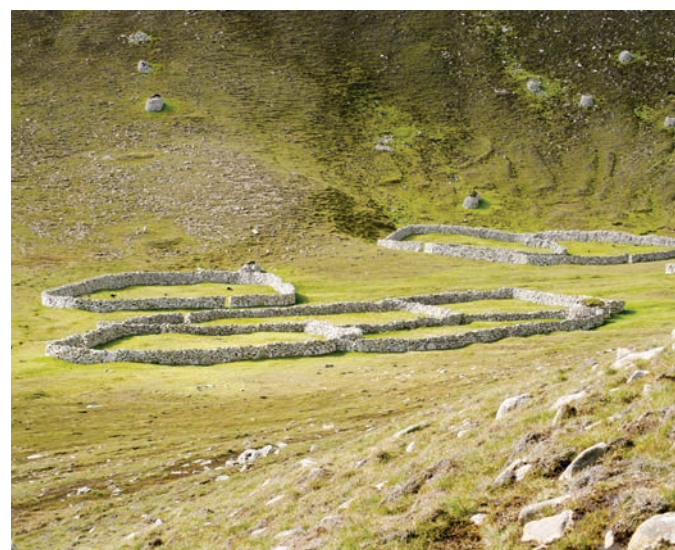
Drystone enclosures; © Crown Copyright HES.