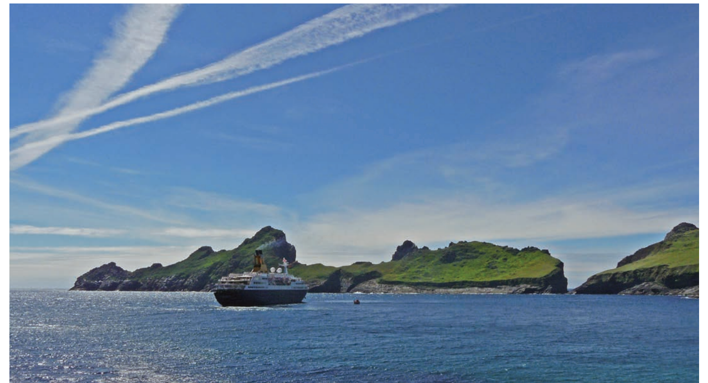
Cruise ships visit St Kilda in the summer.

St Kilda WHS on the HES website: www.historicenvironment.scot/st-kilda