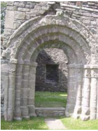
Doorway in the nave

The son of Robert the Bruce, David II, visited Whithorn in 1327. He had had two arrow heads stuck in his body since a battle. He couldn't get one of them out until he made the pilgrimage when miraculously, the arrow left his body!