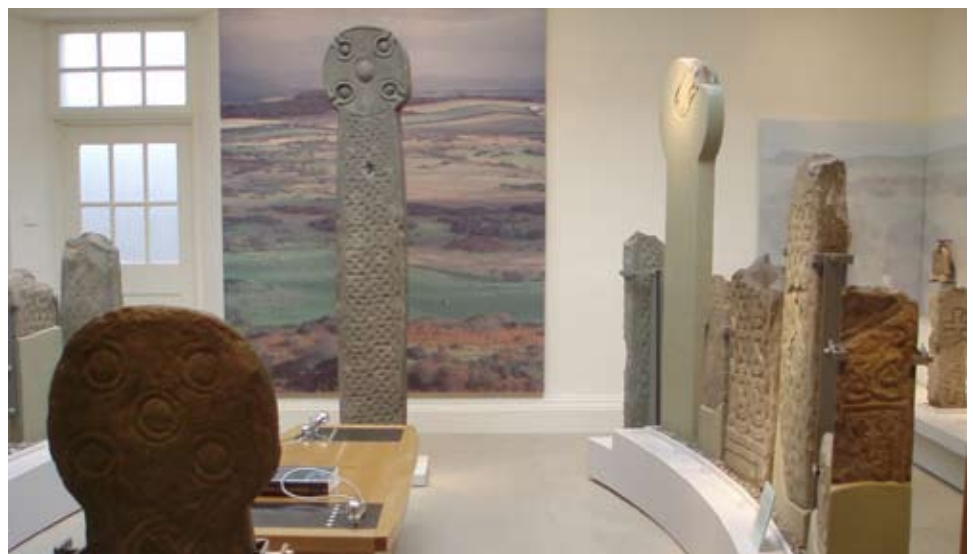
The stones in the Museum