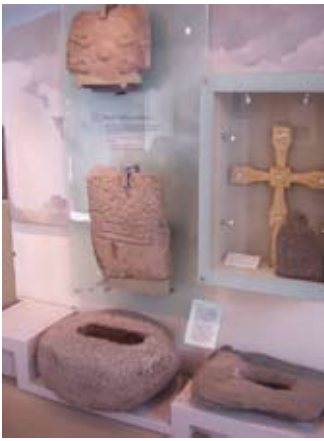
Heads, shafts and bases

Church services were often held in the open air in the early days. Some of the stones marked parts of land which were set aside for religious purposes.