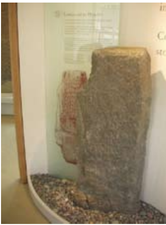
The Latinus Stone

Many Romans were Christians too, so there had been Christians in Scotland even before Ninian.