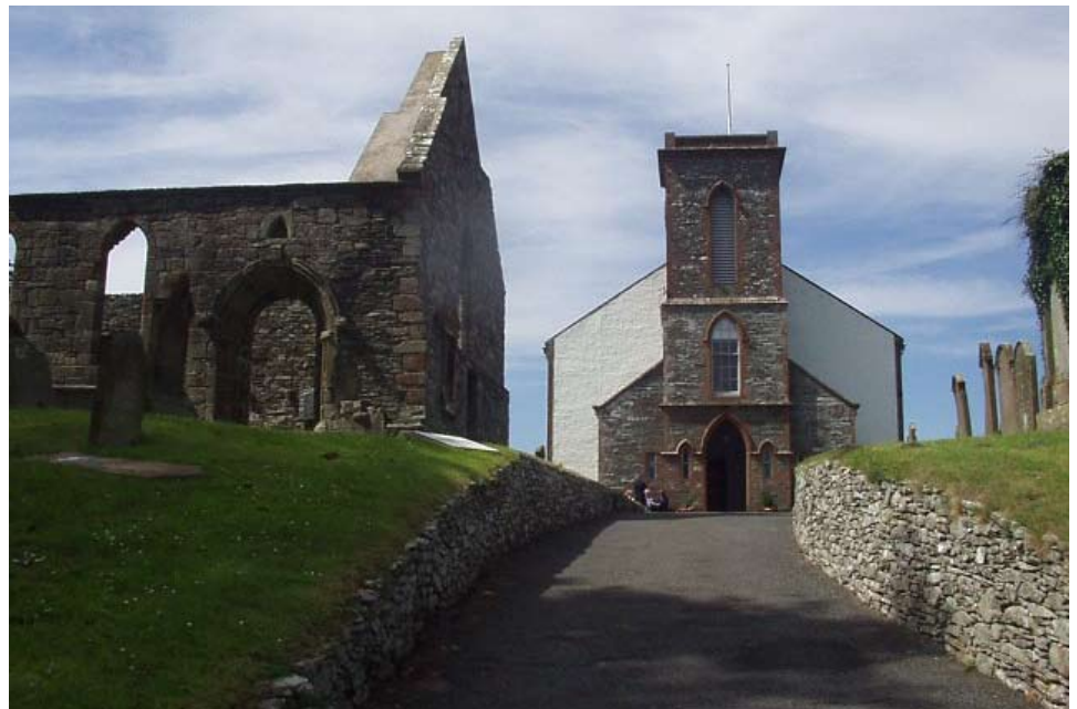
View of Priory site: the nave is to the left, modern church ahead and older remains to the right of the path

Leave the Museum and turn right towards the site of the old priory and the church. Stop by an information panel on the left, which shows what the old church and cathedral complex might have looked like. It is quite high up on a bank, so pupils may have difficulty seeing it.