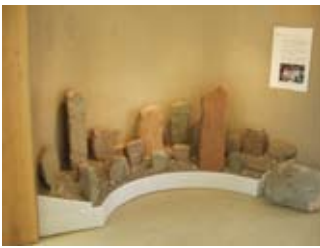
Stones from St Ninian's cave

An annual pilgrimage to St Ninian's Cave still takes place every year on the last Sunday in August.