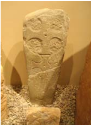
Stone 58 – Pillar slab from St Ninian's cave