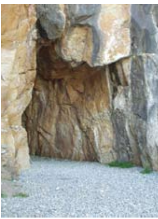
Entrance to St Ninian's Cave