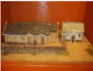
Model of the first church – from The Whithorn Story