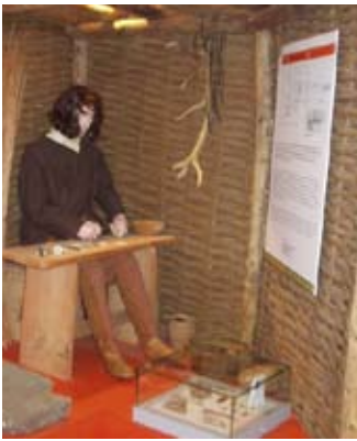
Craftsman at work – display in The Whithorn Story

People travelled across the Irish Sea in tiny boats called curraghs , made from ox-hide.