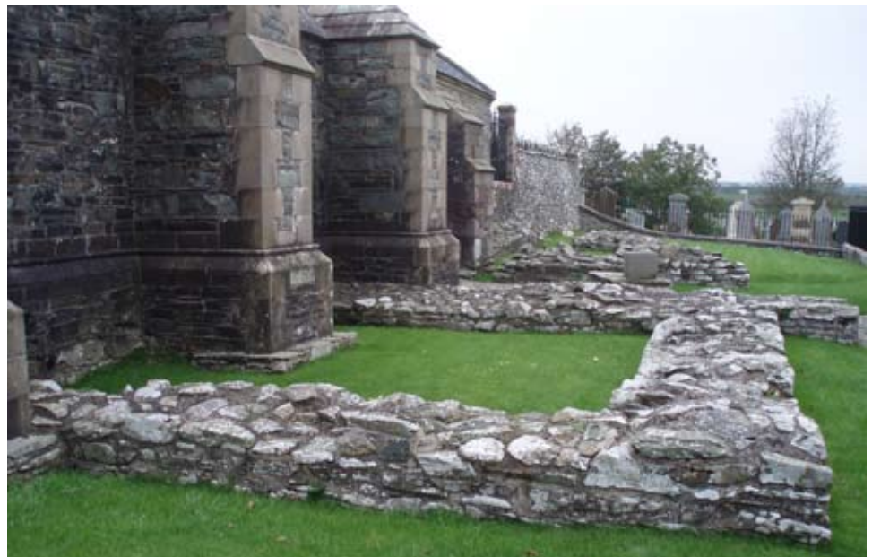
Outline of older church

Go outside the vaults to the east and you can see the outline of a much older church.