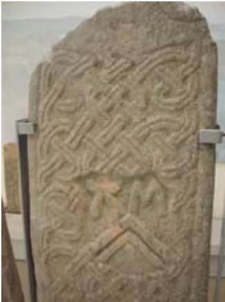
Stone number 35 – reused as a gravestone