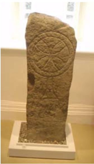
The Peter stone