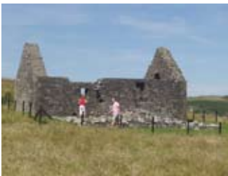
St Ninian's Chapel, Isle of Whithorn

The traditional retreat of St Ninian, this cave is on the seashore. After leaving the bus at the north end of Physgill Glen, walk for about 15 minutes down a muddy and uneven track to reach the beach. The cave is quite obvious once you're on the beach, about 400m west (to the right) of the end of the path. It becomes even more obvious as you get closer because of the number of modern crosses made out of lines of stones, branches etc. There are some very early crosses carved into the cliff, but they are hard to make out, and it's best just to enjoy the remoteness of a site unchanged much since Ninian's time.