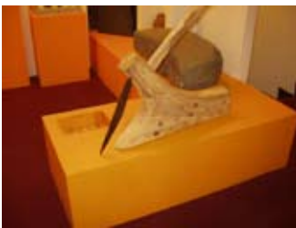
Replica plough – display in The Whithorn Story