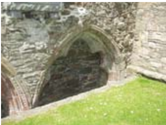
Tomb recesses in nave

In 1434 a Frenchman and a Scottish friend were travelling to Scotland by boat. They got caught up in a storm and vowed that if they survived, they would make an offering to St Ninian. They did survive and when they landed safely they went to Whithorn and gave the priory a silver model of a ship, engraved with the arms of the king of France.