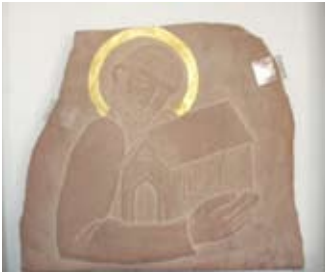
Ninian and his church – from The Whithorn Story

Most of the information we have about Ninian and his life was written about three hundred years after he died, by an Englishman called Bede in 731.