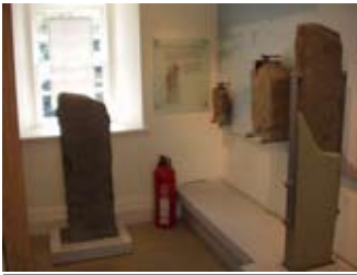
The early Christian stones on display

If you paid for a stone to be carved it showed that you were rich and powerful, as well as making an offering to God.