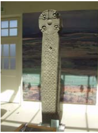
The Monreith Cross

Give the pupils the chance to explore this area independently for about ten minutes. You could give them a kind of treasure hunt, based on the following below.