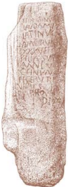
Drawing of The Latinus Stone