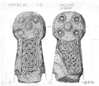
Display stone number 12

Stone number 44 was found in 1992. It was being used as the part of a doorway in a house in George St in Whithorn!