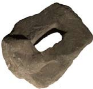
Display stone 9: 'collar' base stone