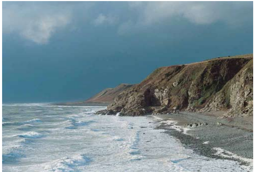
St Ninian's cave is at the end of this beach