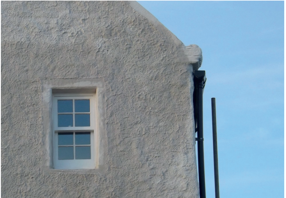
Fig. 12 Modern gauged hot-mixed lime harling on a building in Shetland.