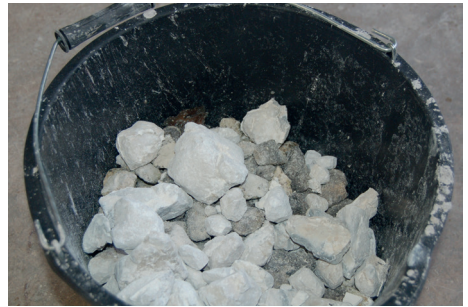
Fig. 2 Lump quicklime.

lime (lime that has already reacted with water to form a putty or a dry hydrate powder) is added to aggregate to form a mortar. Hot-mixed lime mortars have some different properties to mortars prepared from mature lime putty or bagged dry hydrate powdered lime due to the effect of the heat of the reaction, and the high alkalinity of the lime, on the aggregates and other components in the mix.