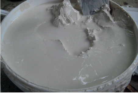
Fig. 6 Mature lime putty.