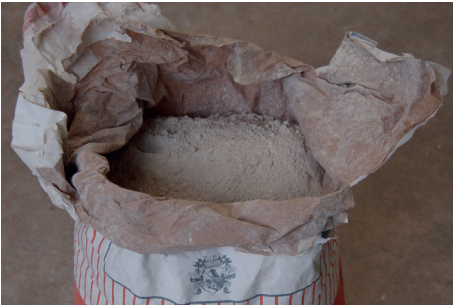
Fig. 7 Natural Hydraulic Lime (NHL).