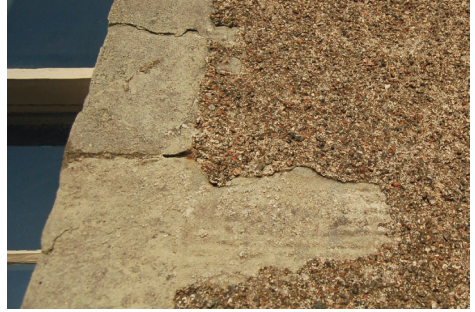
Fig. 11 Weathered lime harling on an early 19th century building in Shetland.

Economy: Quicklime is generally a cheaper product than lime putty, NHLs or other proprietary lime products. Quicklime can more than double in volume during its reaction with water and so less is required for a proportionate mix. Manufacturers and suppliers should be able to provide a figure for the bulk density of their quicklime to enable accurate batching.