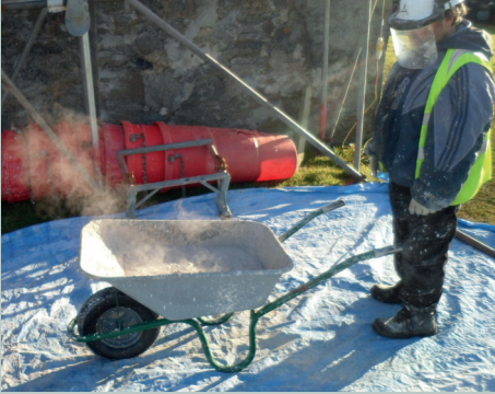
Fig. 8 Hot-mixed lime mortar ready for use on site.