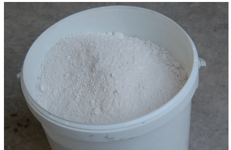
Fig. 4 Powdered quicklime.