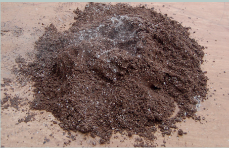
Fig. 9 Quicklime slaking with damp sand.