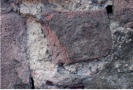
Fig. 10 A lime mortar showing particles of un-slaked lime, characteristic of a hot-mixed lime mortar.

Frost resistance: Hot-mixed lime mortars, whether pure or gauged, seem to have good frost resistance. The reasons for this are not generally well understood, but it may be partly due to the way these mortars are produced: the slaking lime/sand mix produces steam, resulting in an open-pored structure. This seems to have a beneficial effect on the hardened mortar, improving its overall capacity to disperse liquid water and cope with the expansion of freezing water.