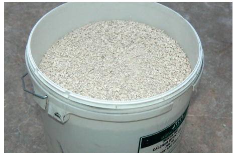
Fig. 3 Granulated quicklime.