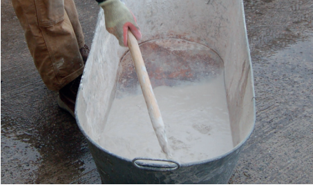
Fig. 5 Slaking quicklime to produce lime putty.