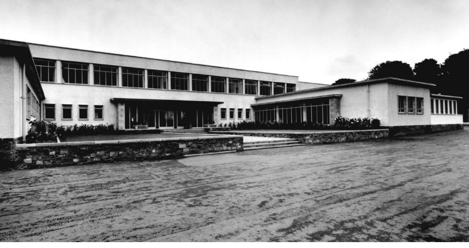
Above: View of the front elevation of the school c. 1955 \ensuremath{\mathbb{C}} Courtesy of HES (J and F Johnston and Partners)