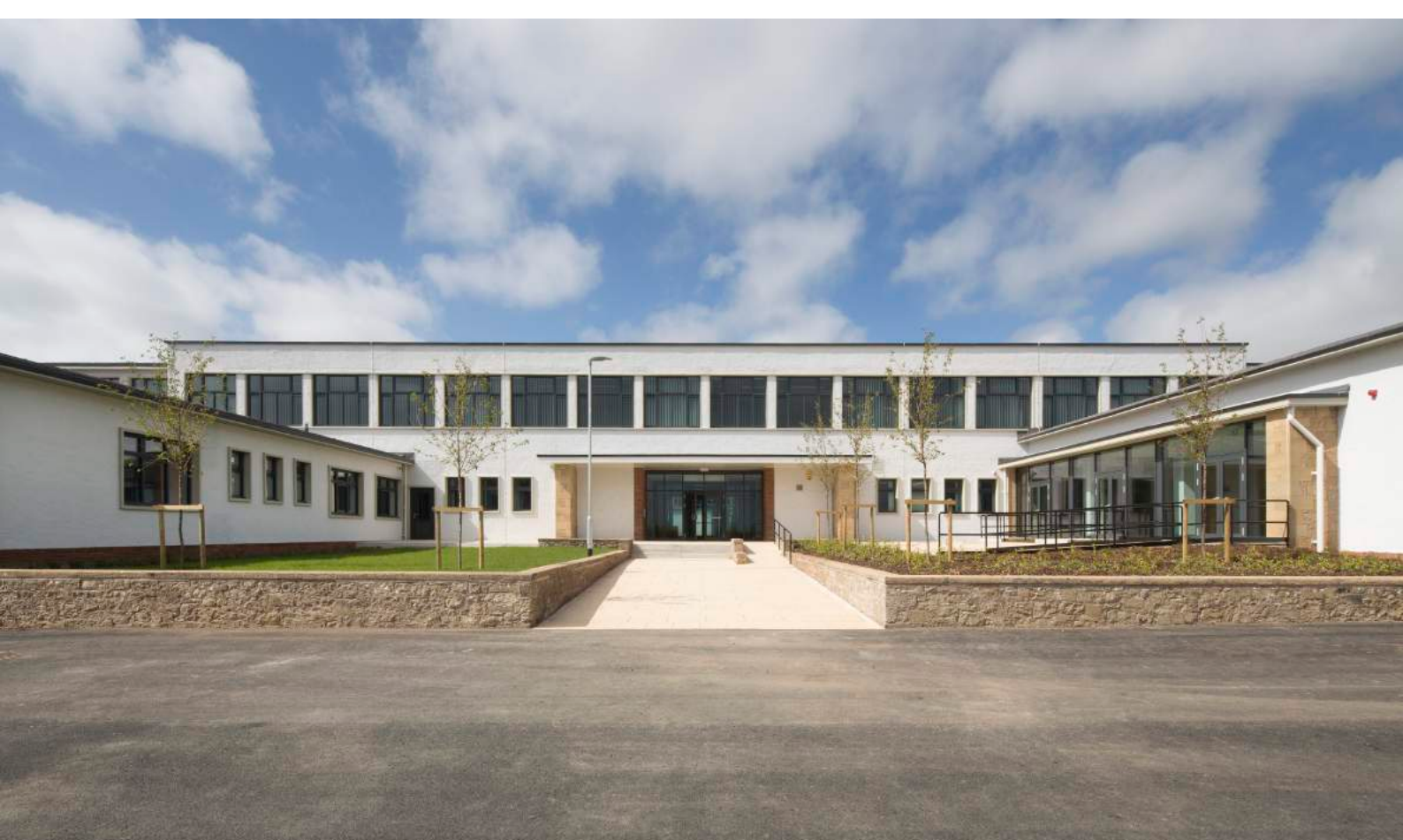
Below: View of the front elevation of the school after the refurbishment