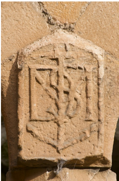
Initials of the Earl, his wife and an anchor

The courtyard façade comprises bold, diamond-faceted ashlars, creating a grid into which are fitted the window openings. The loggia is carried on multi-faceted columns with sub-Corinthian capitals, two of which are ornamented with the entwined initials of the earl, his wife and an anchor, referring both to his role as Lord High Admiral and the constancy of marriage.