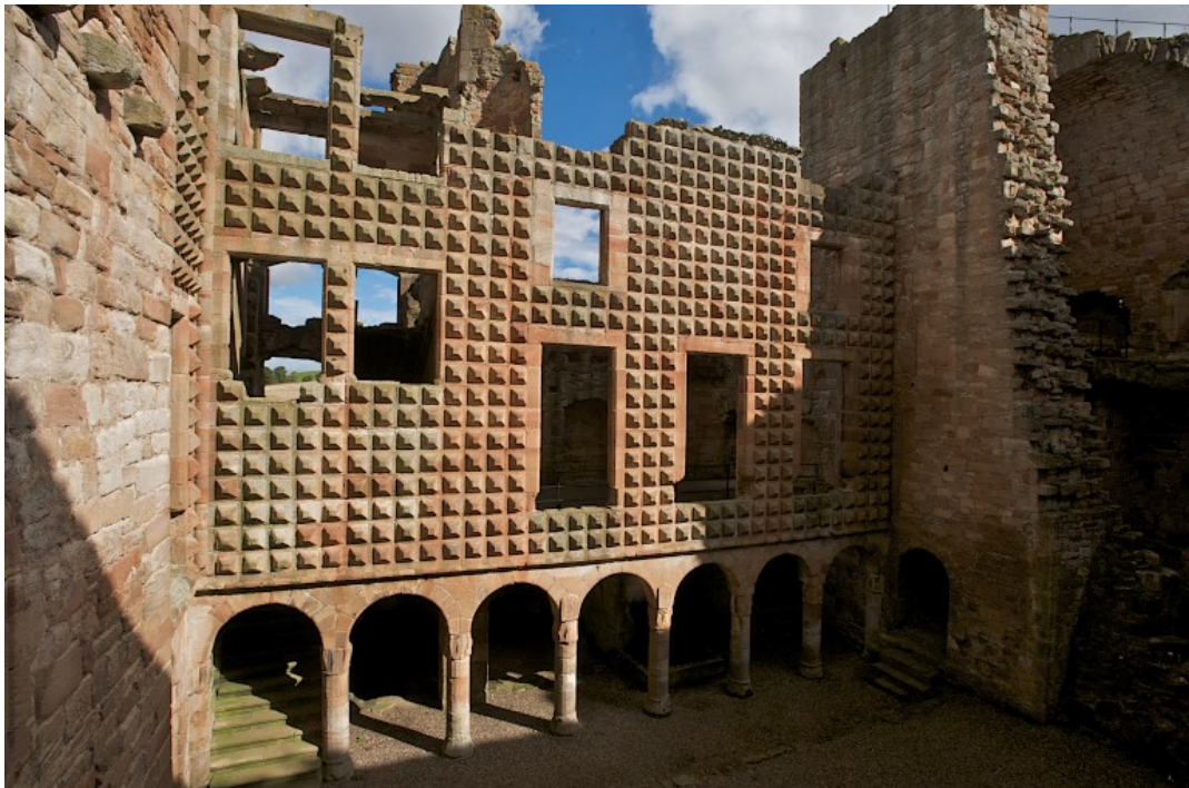
Interior courtyard façade

The courtyard façade comprises bold, diamond-faceted ashlars, creating a grid into which are fitted the window openings. The loggia is carried on multi-faceted columns with sub-Corinthian capitals, two of which are ornamented with the entwined initials of the earl, his wife and an anchor, referring both to his role as Lord High Admiral and the constancy of marriage.