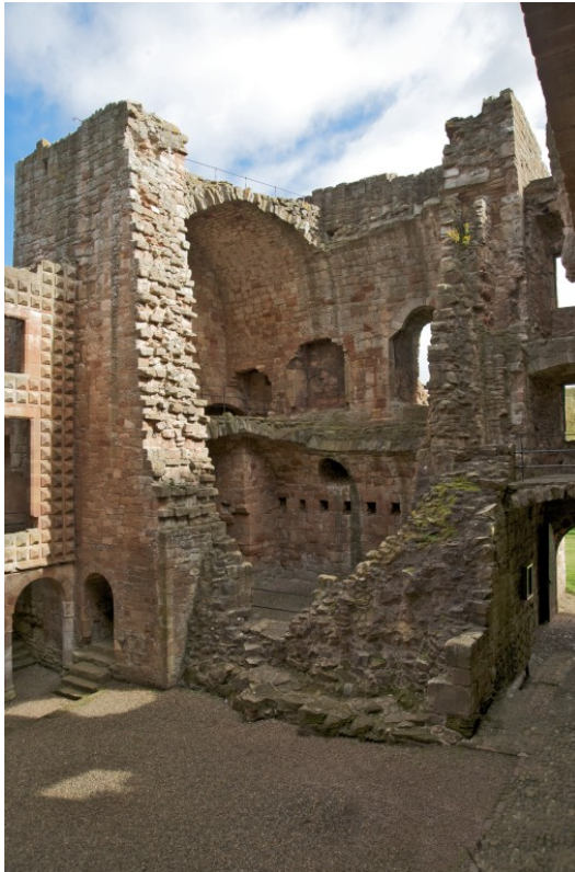
14th century tower

The early history of the site is relatively enigmatic, though there may have been a manor or castle of some sort here by 1315, when Crichton was the scene of the reconciliation between King Robert the Bruce and the Earl of Fife. In this period, the lordship of Crichton gave its name to a family whose members included several men-at-arms, a Berwick merchant, and the local parish priest, but it was not until the second half of the fourteenth century that they stood out from the ranks of local barons and affirmed their membership of an upper stratum in the kingdom's nobility.