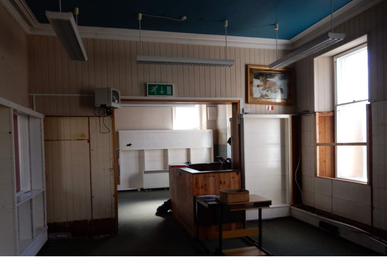
Above: View of the ground floor of the Stromness library after it was vacated

Below: View of the same ground floor after Solisquoy Printmakers moved in