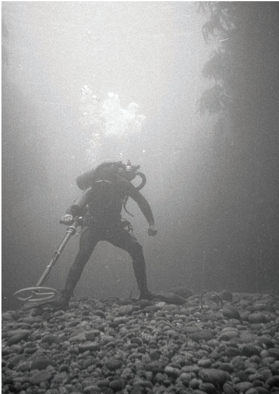
Above: A diving archaeologist conducting a metal-detector survey of the wreck of the Adelaar, Barra