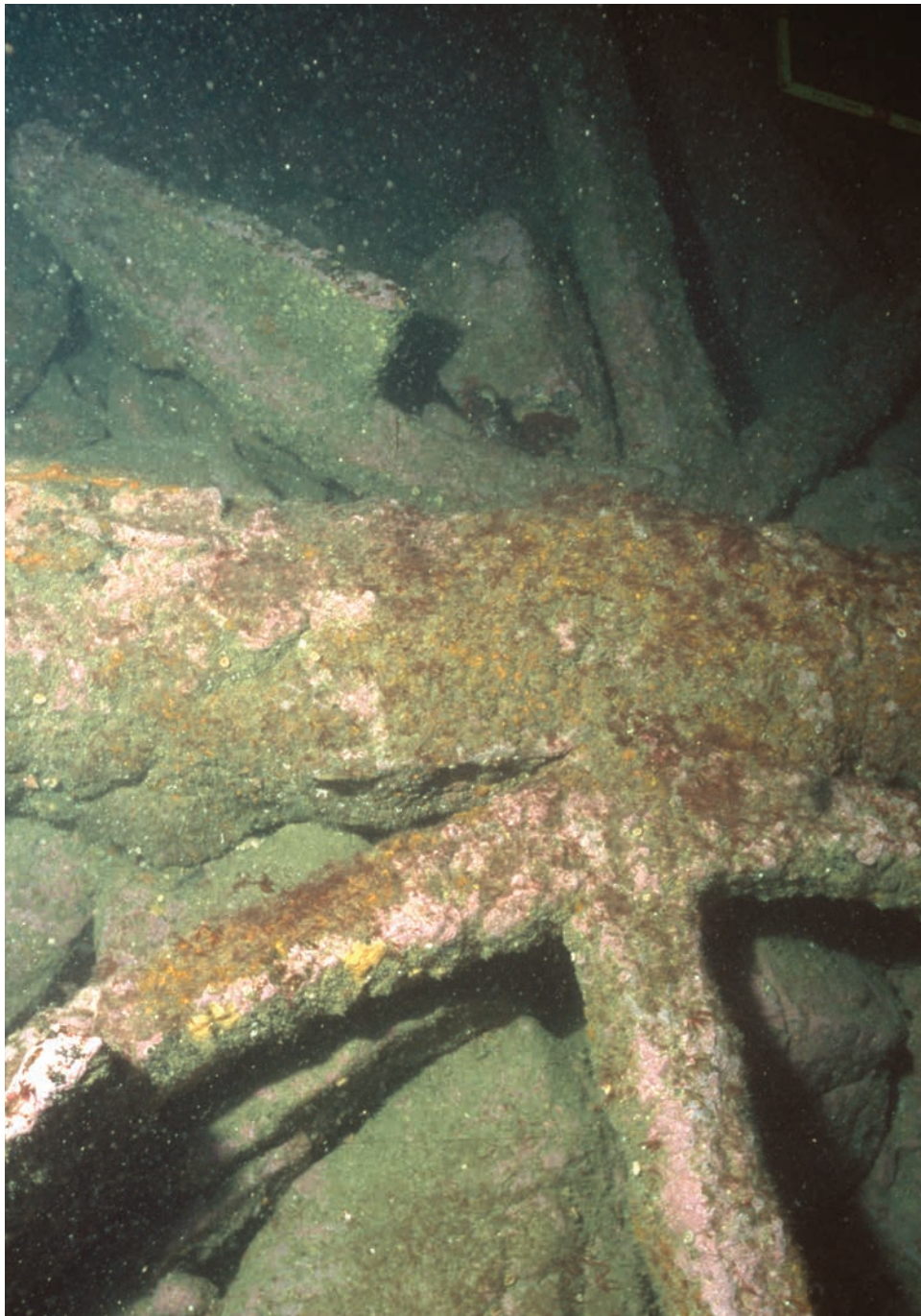
Above: Cannon and anchor, Kinlochbervie HMPA, Sutherland