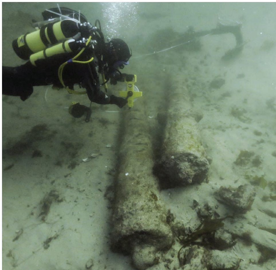
Above: Diver investigating guns and hull structure on the seabed within the Drumbeg HMPA, Sutherland

We also consider the implications of the designation. Even if a marine historic asset may otherwise meet the criteria, it may not always be appropriate to designate it. For example, offshore oil installations may be historically significant but, as they have to be decommissioned at the end of their life to meet international commitments, designation would not be appropriate.