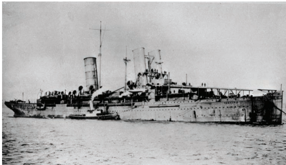
17 HMS Campania (wreck 172) after alterations with twin funnels forward.

Below: HMS Campania in 1917