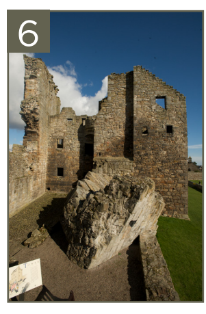
Find the big bit of fallen stone from the tower house. When did this fall down?