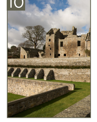
How many levels are there in the gardens?