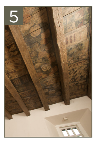
Find the painted ceiling. What objects can you spot on it?