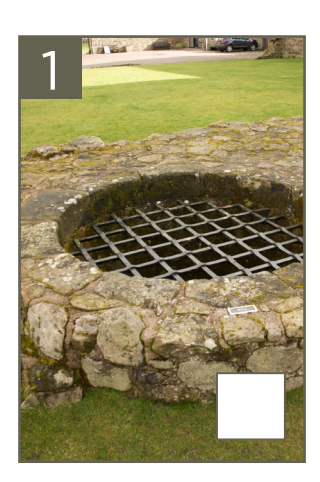
Can you find the castle well?

Find animals, people and symbols as you explore around the castle Remember to ask the steward if you need any help.