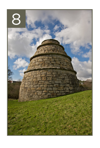
How many nesting boxes are there in the doocot?