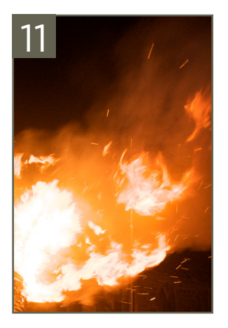
What year did the fire break out in the central part of the castle?

Well done! Now you can collect your free sticker from the steward.