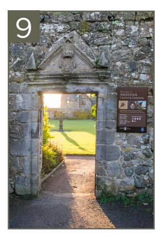
What symbols can you spot carved on the two entrances to the walled garden?