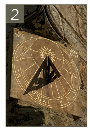
How many sundials are there around the castle?