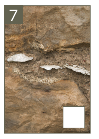
Oyster shells were used in the castle walls. Can you spot them?