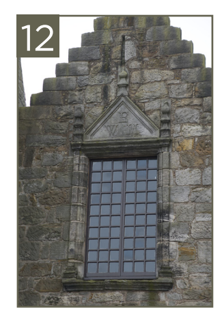
What letters can you spot carved above this window?