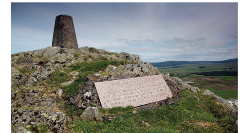
Left: In 1689 Dunkeld Cathedral in Perthshire was one of only three buildings left standing after the battle in the town Above: Plaque commemorating the 1307 Battle of Loudon Hill in East Ayrshire

Who currently owns the land does not affect how we define the boundary.