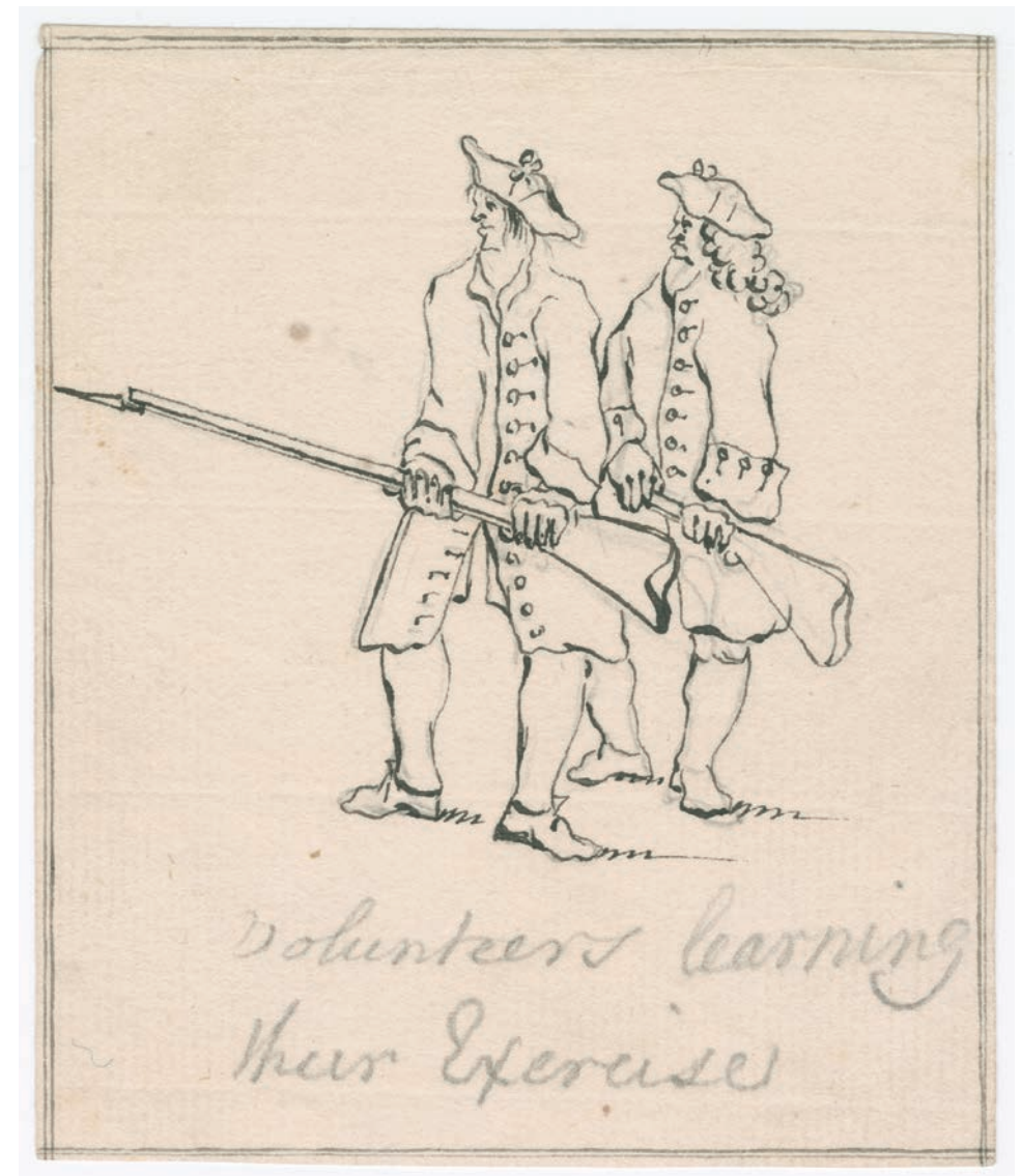
Above: This hand drawn sketch depicts two British Army soldiers in training. "Redcoats" like these were involved in a number of Scottish battles in the late 17th and the 18th century

Scotland's Environment website environment.gov.scot also has a map-based search as well as more environmental information, including conservation area boundaries.