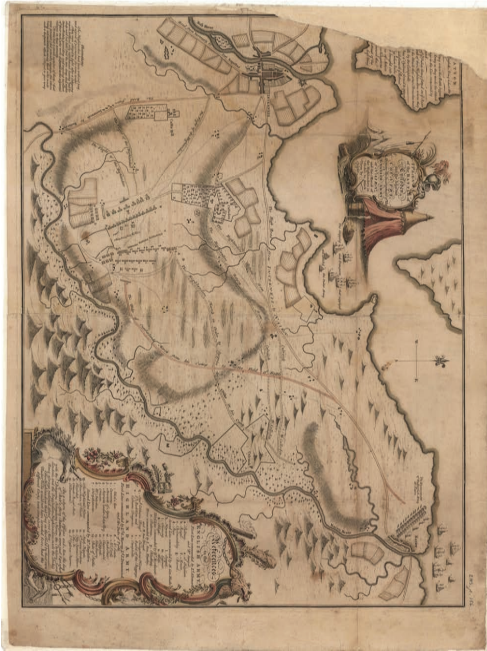
Above: Historic maps, such as this example depicting Culloden, can provide valuable information about the location and events of a battle