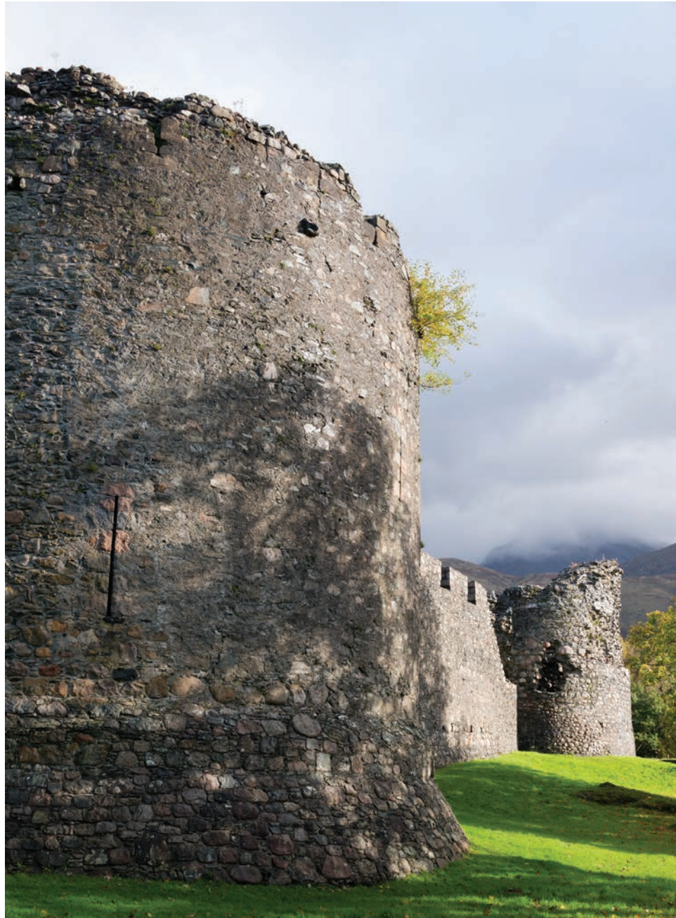
Cover: Many of Scotland's battlefields have memorials to the events and individuals, such as this statue of Robert Bruce at Bannockburn, Category A listed Above: Old Inverlochy Castle, played a part in two battles on the inventory, in 1431 and in 1645. The Earl of Argyll garrisoned men inside the ruined castle during the second battle, and many of them were allegedly massacred within by their Royalist opponents in the aftermath