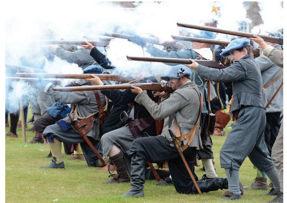
Below: A living history event

Also, a battlefield can only be included on the inventory if the area of the battle can be defined, with confidence, on a modern map.