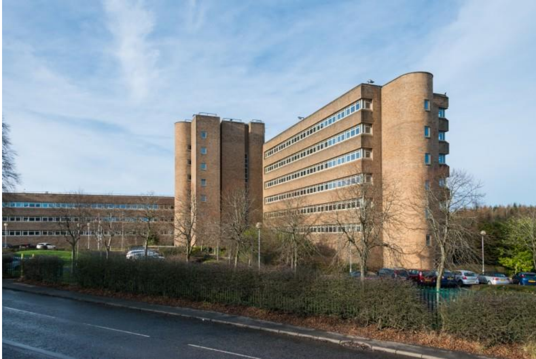
Figure 15. Abercrombie House

continuing preoccupation with a 'balanced' community with a mix of employment and social classes. The large complex was disposed to conceal the bulk of the building, comprising three splayed wings and a central service core. Each section, finished in facing brick, gave a nod to Scottish tradition with a drum stair tower at the end. Being concrete framed, there were open-plan offices with day-lit exterior walls. These were refurbished, and a 'green' turf roof added, in 2004.