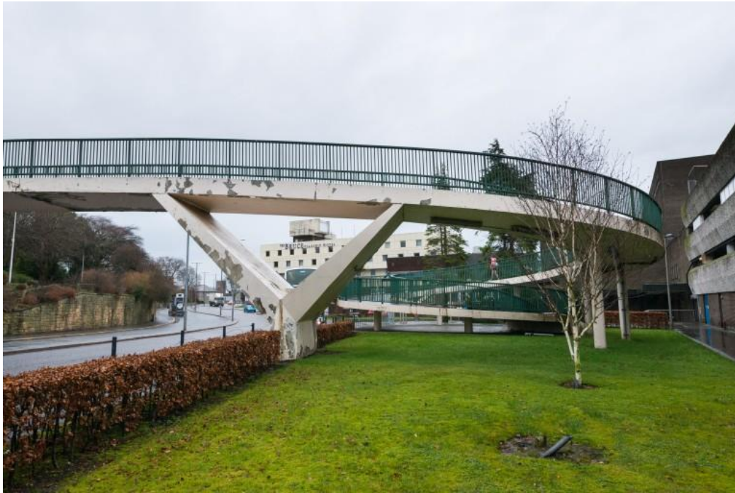
Figure 16. Cornwall Street Bridge