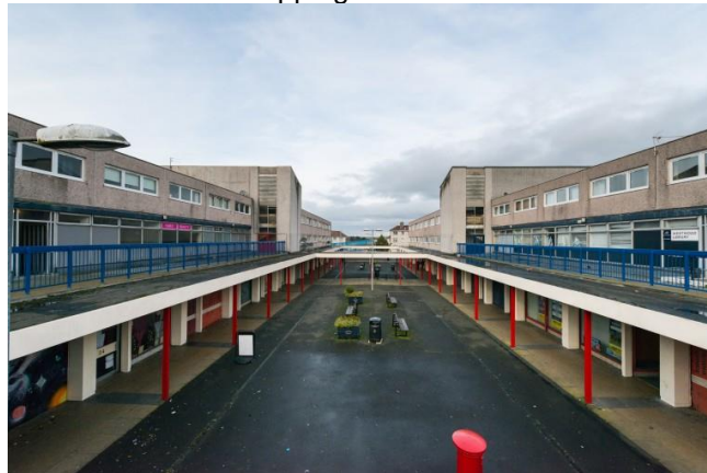
Figure 4. Westwood shopping mall

The Murray I scheme (206 houses and 98 flats, covering 23.1 acres) earned the