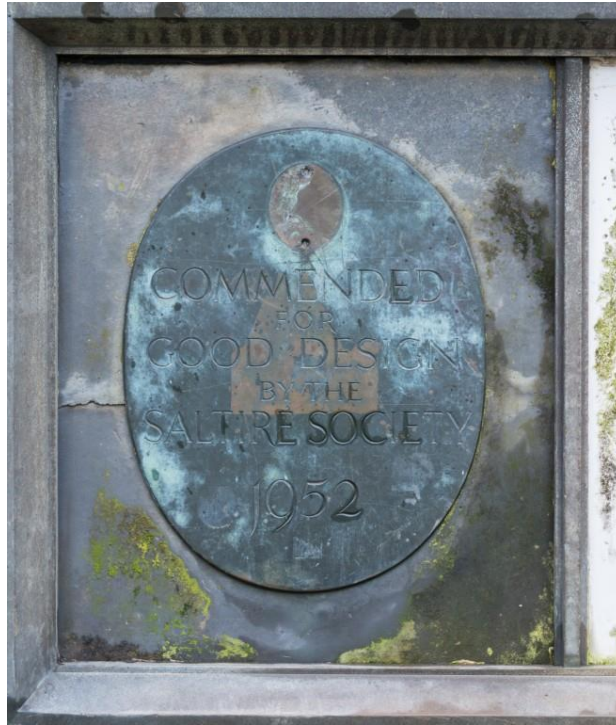
Figure 6. Saltire plaque

Two years later Donald Reay received an award for his white-harled Stuarton Park (Figure 7) and Dalrymple Drive (East Mains) detached houses, linked by screen walls, and turned gable-end to the street for greater privacy.