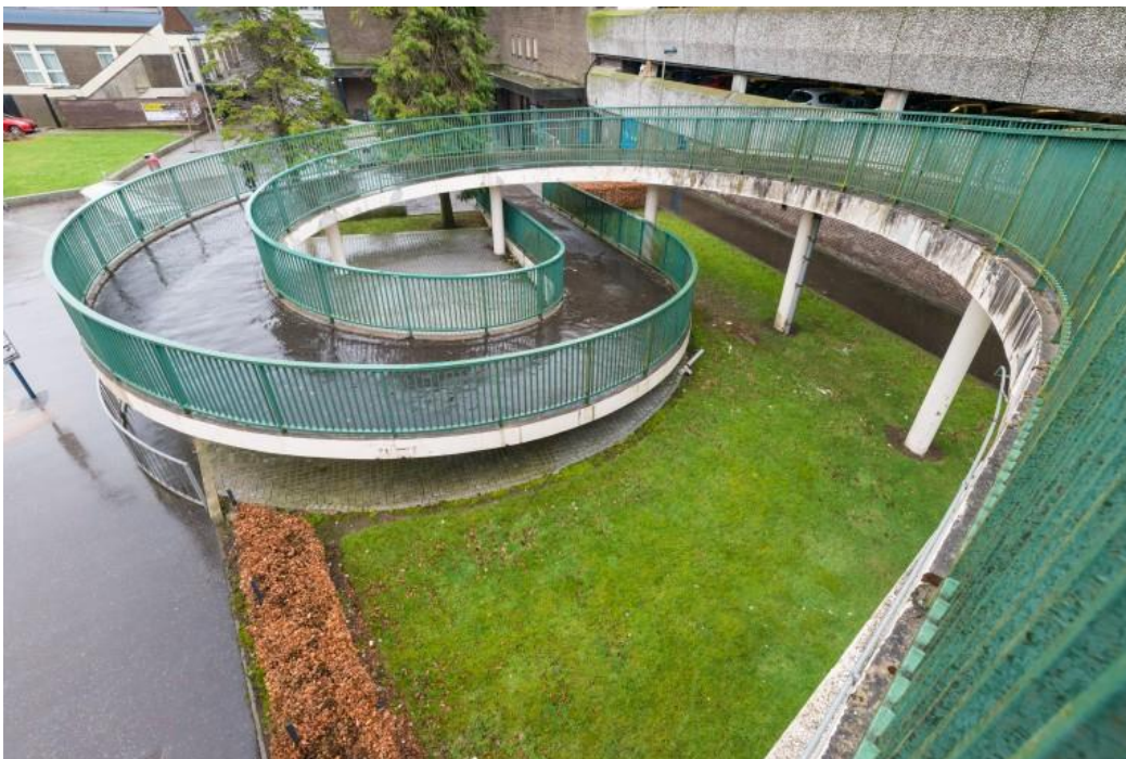
Figure 17. Cornwall Street Bridge detail © Historic Environment Scotland

His asymmetrical white footbridge over Cornwall Street (1967), on Y-shaped supports, marked a 'desire line' to the Dollan Baths with their distinctive concrete