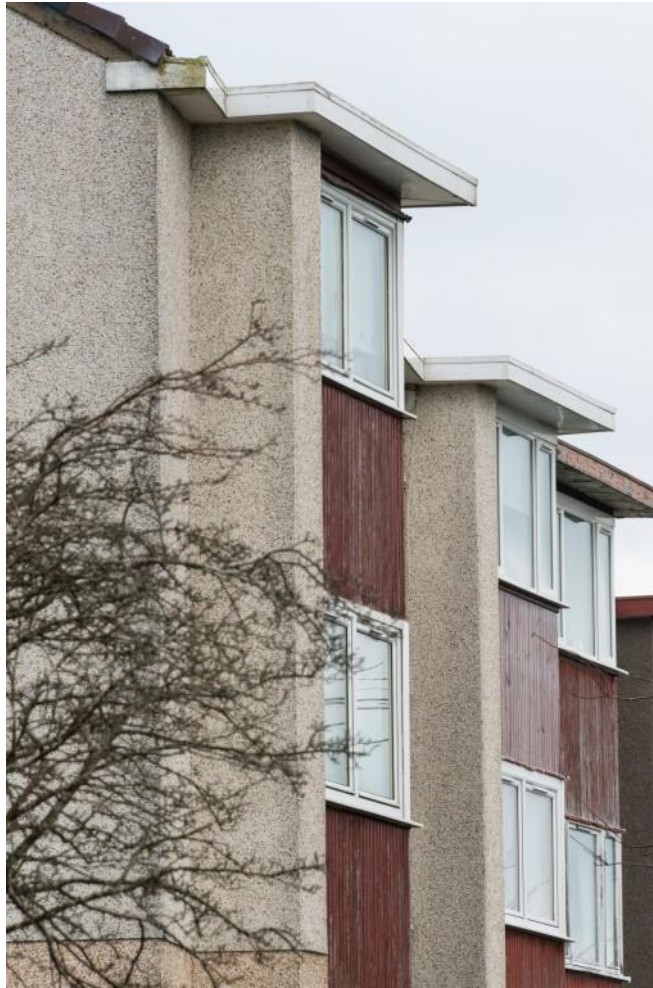
Figure 9. Quebec Drive flats