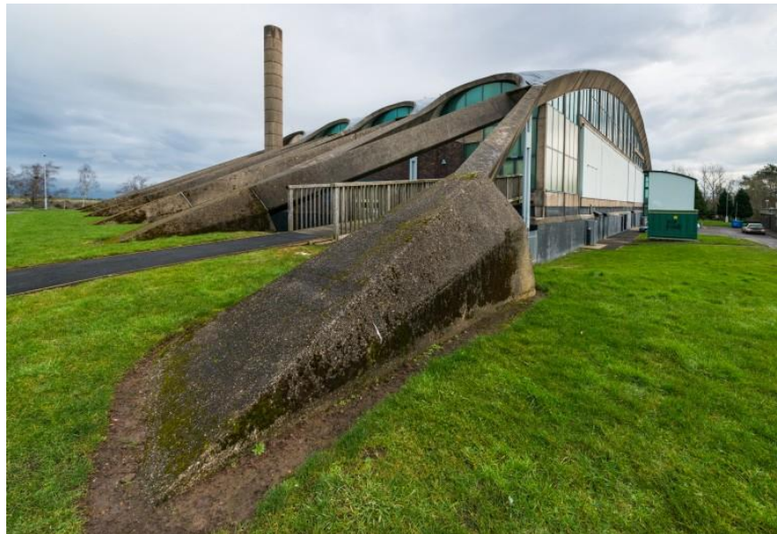
Figure 2. Dollan Aqua Centre

A number of East Kilbride's buildings were designed by the foremost architects of the period: Duncanrig School by Basil Spence; the housing at Stuart Street/Kirkton Place by Alan Reiach; St Bride's Church by Isi Metzstein and Andy MacMillan of Gillespie Kidd & Coia; and the Dollan Baths (now the Aqua Centre) by Alexander Buchanan Campbell (Figure 2)