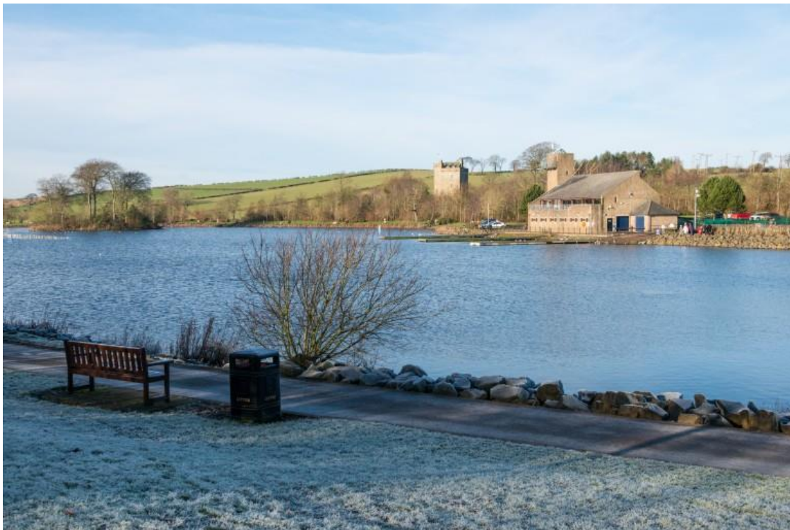
Figure 18. Heritage Park with Mains Castle in the distance

The last major design project overseen before the Corporation's orderly winding up in 1995 was the re-creation of the drained loch at the James Hamilton Heritage Park, which formed a manicured setting for Mains Castle, and a new watersports centre (Figure 18).