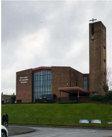
Figure 10. Our Lady of Lourdes