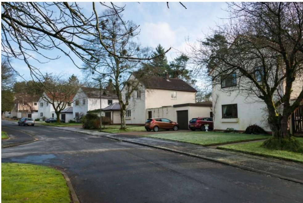
Figure 7. Stuarton Park © Historic Environment Scotland

Two years later Donald Reay received an award for his white-harled Stuarton Park (Figure 7) and Dalrymple Drive (East Mains) detached houses, linked by screen walls, and turned gable-end to the street for greater privacy.