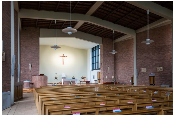
Figure 11. Our Lady of Lourdes interior

A series of progressively darker spaces opens into the serene interior, with its side-lit sanctuary and vertically coursed brickwork pulpit. The side walls form a series of canted bays, filled with obscured glass, acting as sources of daylight concealed from the congregation, while focusing all attention on the raised chancel.