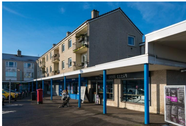
Figure 3. Calderwood shopping centre © Historic Environment Scotland

Much of the Department's time was taken up with housing design. The Department won, or was commended, 12 times by the Civic Trust and Saltire Society in the 1950s and 1960s. This was no mean achievement as the architects were forced to work within the restrictions of building licences (not relaxed until November 1954) and repeated post-war shortages of both skilled tradesmen and materials. The Scottish Office required the elimination of domestic porches, canopies, roughcasts and colour washes. However, the Corporation tried to vary their house designs, and welcomed rare opportunities to use stone in Calderwood and Westwood shops (Figures 3 and 4), as well as encouraging traditional Scottish craftsmanship. They also evolved various forms of system or industrialised building, to speed up their output.