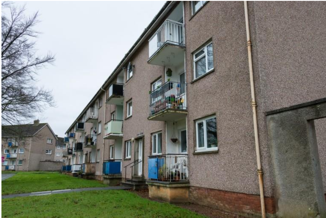
Figure 8. Park Terrace flats © Historic Environment Scotland

Francis Clunie Scott and Gustav Mandl won the 1955 Saltire Award for two simple, balconied blocks of flats at Park Terrace (usually misidentified as Brouster Place) (Figure 8) with an open outlook over the future Cloverhill Park which was enhanced by the retention of the existing trees, its 'informal' layout linked in scale to the old village by a small terrace.