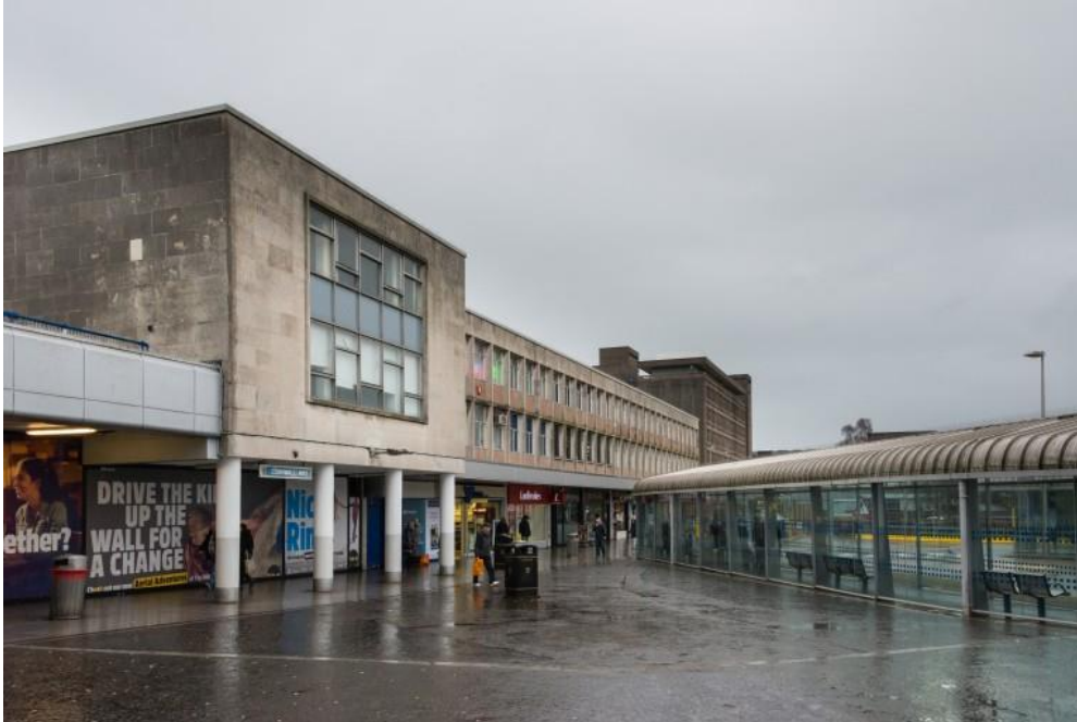
Figure 12. Part of Princes Square shopping mall

The Plaza development, begun in 1971, was designed by Ian Burke Associates of Edinburgh, for City Wall Properties. These were laid out following the pattern set in Cumbernauld which was then at the stage of development and by English New Towns with open pedestrian streets and squares bounded by shops, transport being kept on the edges. Now comprising four main malls, the original concept has changed beyond recognition, pedestrianisation and complete roofing over of the original traffic routes making the centre now entirely undercover.