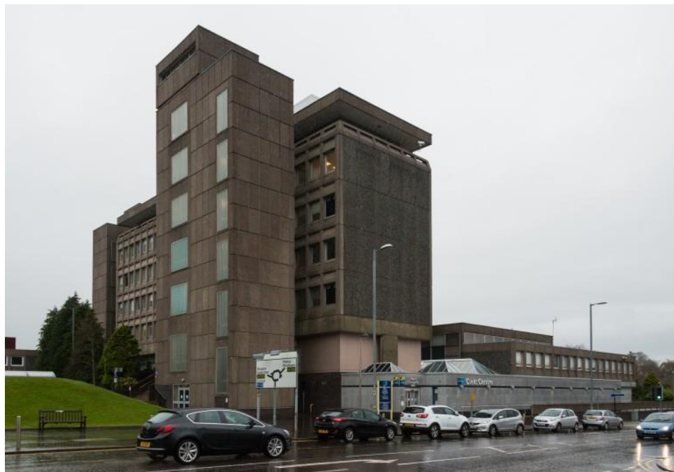
Figure 14. Civic Centre

Another large office block by the Corporation architects was Abercrombie House (1978–81) for the Overseas Development Agency, the first Scottish relocation of civil servants from London under the Government's policy of dispersing staff around the provinces (Figure 15). The Corporation saw this as a great coup, and a source of white-collar jobs for educated school leavers, reflecting their