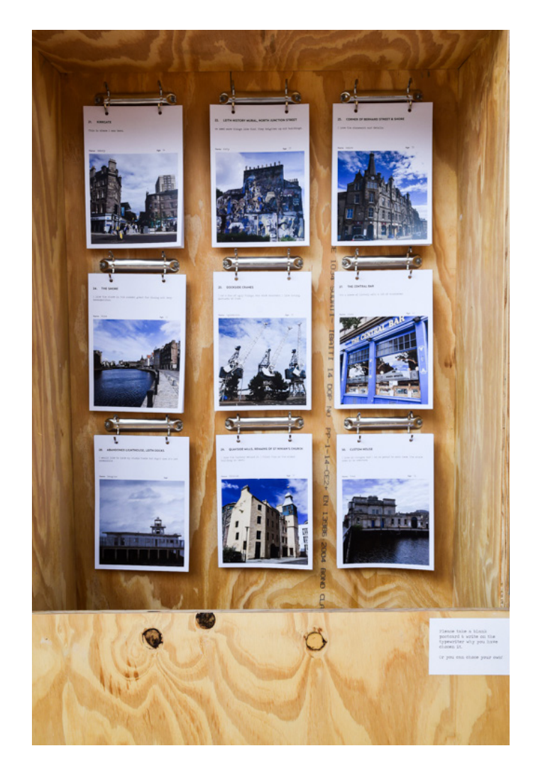
Individual Leith Listings 'postcards'.

The final List is itself a reflection of some of the significant historic buildings and structures in Leith, but also of the people, places and attitudes that make it unique.1