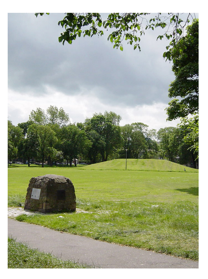
Leith Listings no. 3 -Leith Links

The Leith Listings was one of three interlinked projects supported by the Scottish Government, Creative Scotland and the City of Edinburgh through the 'People and Places: Make Leith Better' programme in 2017.