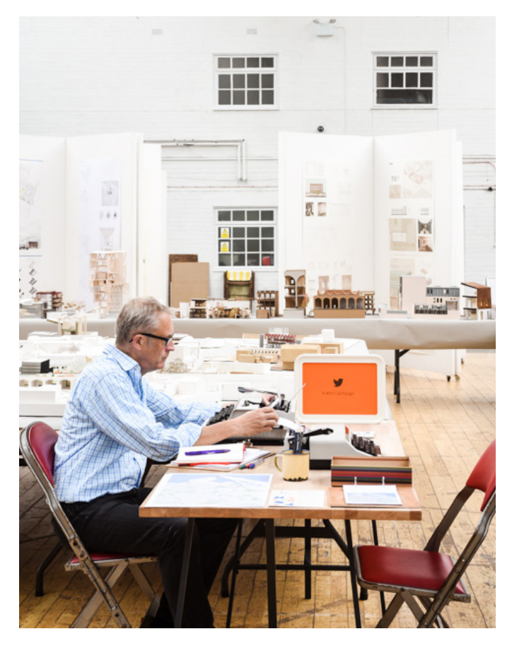
The Leith Listings on display, Out of the Blue Dill Hall.

One of the interesting outcomes of using social media was the initiation of active online discussions, where a particular Listing would generate a mix of opinions. The hashtag was popular and allowed for a range of new people, unable to attend the public event, to join in with their views.