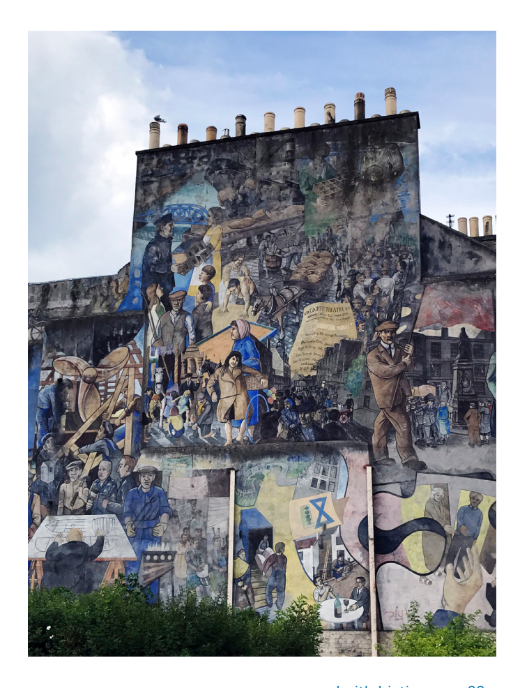
Leith Listings no. 22 -Leith History Mural

The process involved paring citizen perspectives with local skills in visual art, architecture, design and the built environment. It enabled us to identify some of the most significant assets and challenges for Leith, along with key recommendations for change.