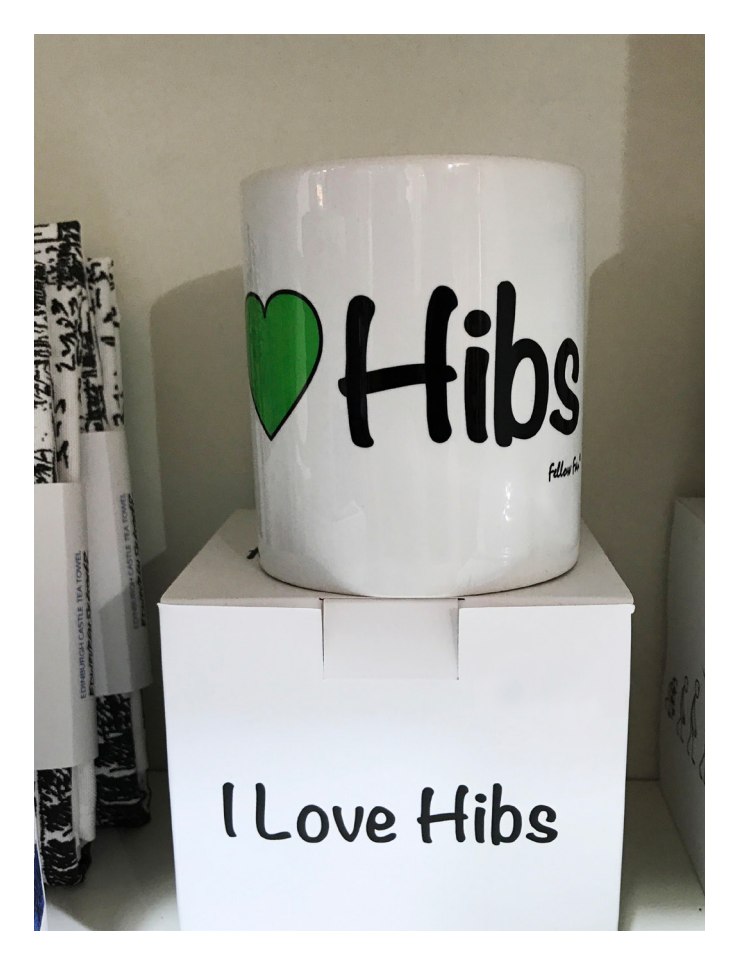
Leith Listings no.16 -Hihs

What we can say is that all of the assets included in the List were identified by residents as having a local significance. In most cases, this was noted before development was scheduled and, if nothing