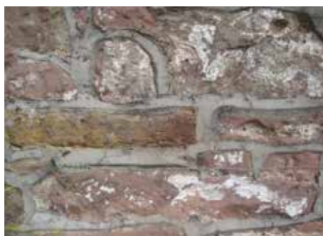
Fig. 10 Unsightly cement pointing.