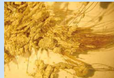
Fig. 5 Hair in a historic lime plaster.

Historically, natural additives were added to lime mortar mixes to improve their performance. 'Pozzolanic' materials such as brick dust and fly-ash promote setting; animal hair (Fig.5) was sometimes added to increase tensile strength for internal plastering and external finishes; and animal fats were used to provide a degree of weatherproofing. Modern synthetic additives are now available to enhance mortar performance. Most additives are only required in very small quantities and can be detrimental to mortar performance if not batched correctly.