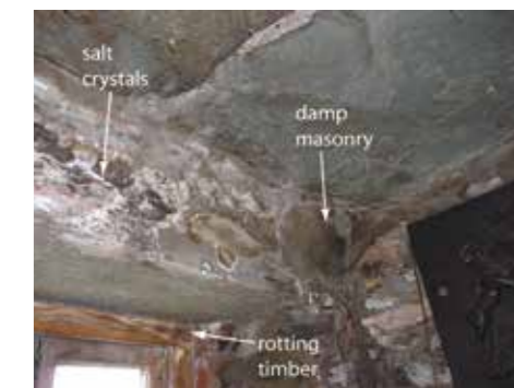
Fig. 7 Problems caused inside buildings by using impermeable mortar on the exterior.

In order for a mortar to perform sacrificially it should have a good degree of connected pore space through which liquid water and water vapour can move and should have sufficient flexibility to accommodate movement associated with stresses such as thermal expansion. Correctly specified lime mortars fulfil both these criteria, as do some early cement mortars. Modern cement-based mortars typically do not. In general, soft or 'weak' mortars have higher permeability and flexibility.