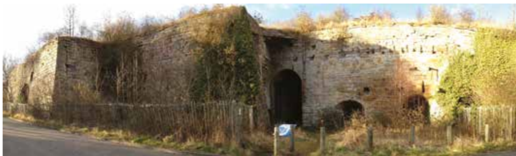
Fig. 2 The historic lime kilns of Charlestown, Fife.

Limes made from pure sources of calcium carbonates (e.g chalk) are typically referred to as non-hydraulic limes or 'air limes' while those made from limestones with clayey impurities are called 'Natural Hydraulic Limes' (NHLs). Modern standards classify hydraulic limes by strength, although this property is not necessarily the most important factor in choosing a lime for a mortar.