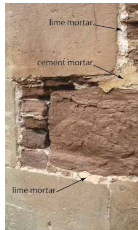
Fig. 12 Detachment of failed cement pointing reveals original lime mortar beneath.

Where repairs are to be carried out, the most effective approach usually involves the use of materials and techniques that were employed in the original construction. This logic applies to both lime and cement mortars, for original cement mortars are often just as worthy of conservation as lime mortars. However, due to the widespread use of replacement cement mortars over the past 70 years, care should be taken to establish what is actually original (Fig. 12).