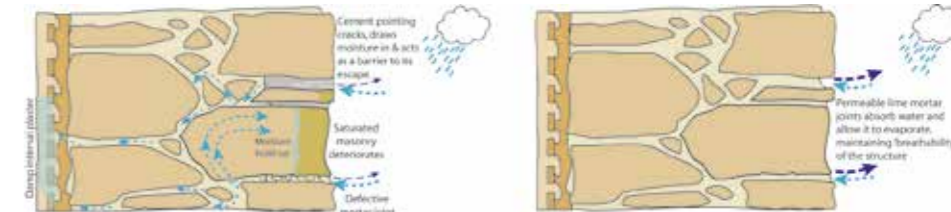
Fig. 6 Moisture management in traditional buildings.