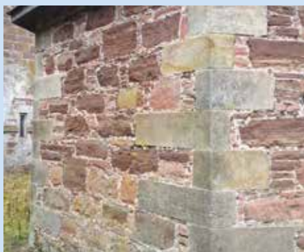
Fig. 1 Example of stone and lime mortar construction at Fort George dating c.1769.

Scotland has a long tradition of building with natural, locally available materials and this has resulted in distinctive architectural styles (Fig. 1). The use of stone and lime mortar in Scottish construction stretches back to Roman times, but before lime became widely available, clay and earth mortars were common. However, a large proportion of Scotland's buildings constructed prior to 1920 used lime mortars for construction and finishing (e.g. bedding, pointing, harling and renders).