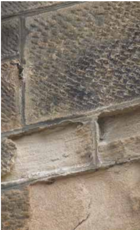
Fig. 8 Pointing with hard cement can cause masonry to deteriorate at an accelerated rate.