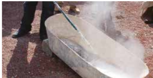
Fig. 3 Slaking quicklime is a vigorous reaction that produces heat.

Water absorption, or permeability and flexibility of the materials are often more significant aspects. Limes of greater hydraulicity typically have lower water absorption rates and flexibility. The range of lime binders available on the market is constantly changing. Modern materials, classed as 'hydraulic lime' or 'formulated lime' can have significant variations in lime content and may contain additives that affect their properties. When working with traditional buildings, it is generally advisable to use air limes or natural hydraulic limes as these have a proven track record in conservation work and are generally better understood.