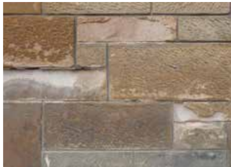
Fig. 9 Deterioration of masonry around cement mortar joints.