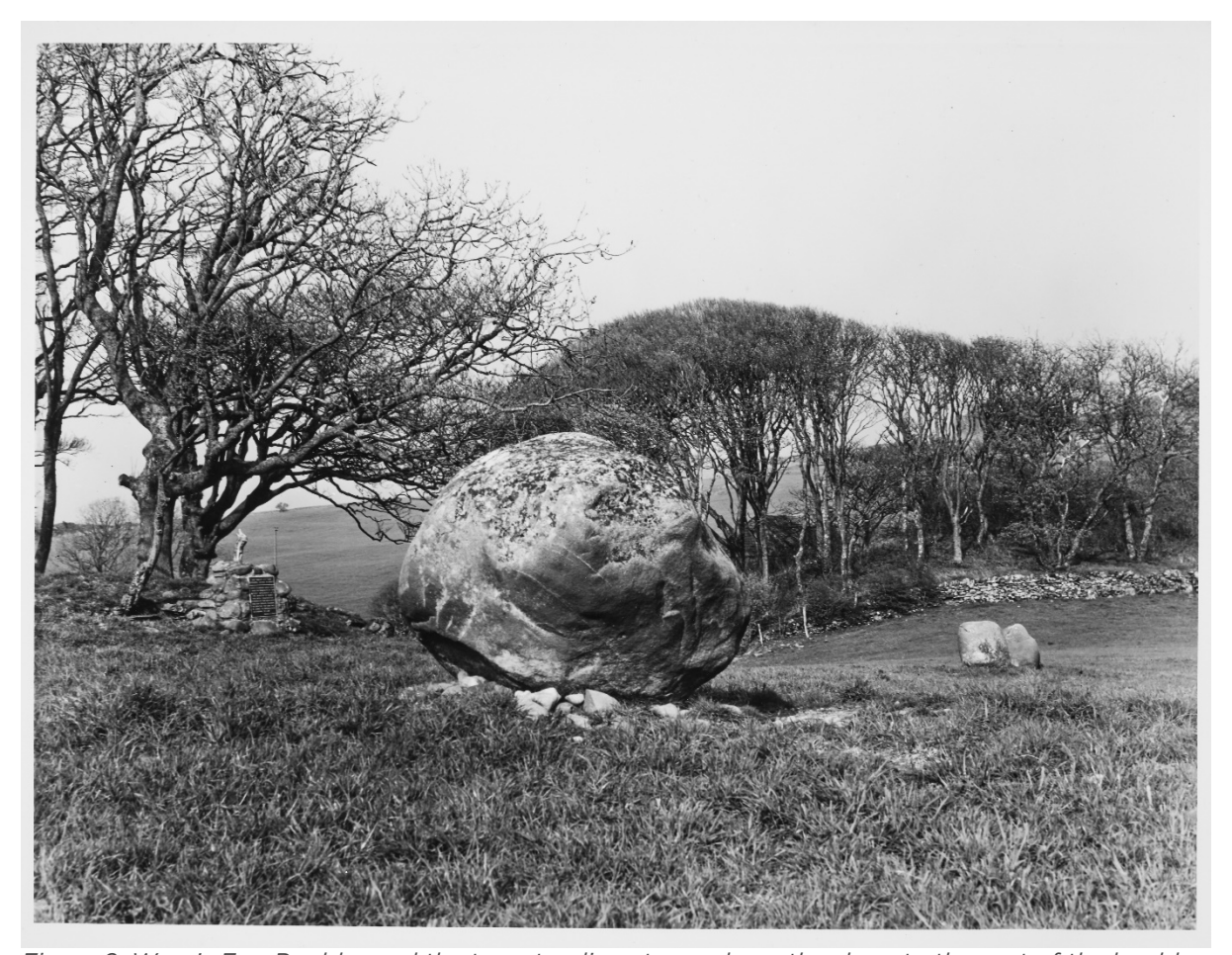
Figure 2: Wren's Egg Boulder and the two standing stones down the slope to the east of the boulder. The picture was taken in 1958 © HES.

The pair of standing stones are around 20m downslope to the east, set about 1.5m apart and both are of unworked granite set just under 1m in height above the current ground surface.