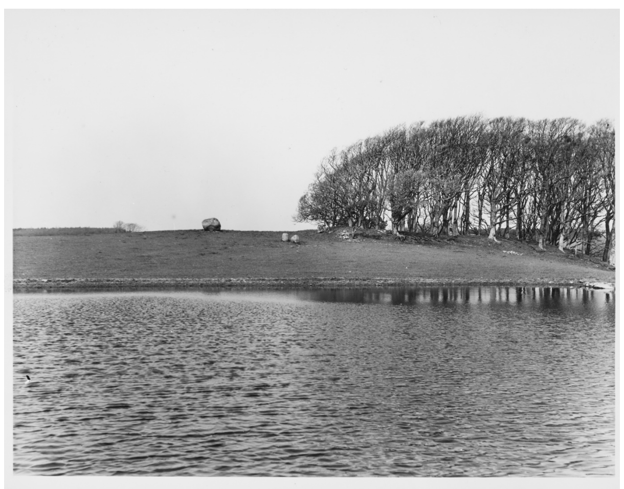
Figure 9: View of the Wren's Egg from the south-east. The body of water is flood water and is not a permanent feature. Photograph taken in 1958.

The location of the standing stones would have been chosen as it was a significant point in the landscape for those who erected the stones. Although we believe the Wren's Egg Boulder has been shifted in modern times (see 2.1.3) it is unlikely to have been moved any distance, and it was clearly of some significance to the Bronze Age inhabitants of the area to erect two standing stones very close by.