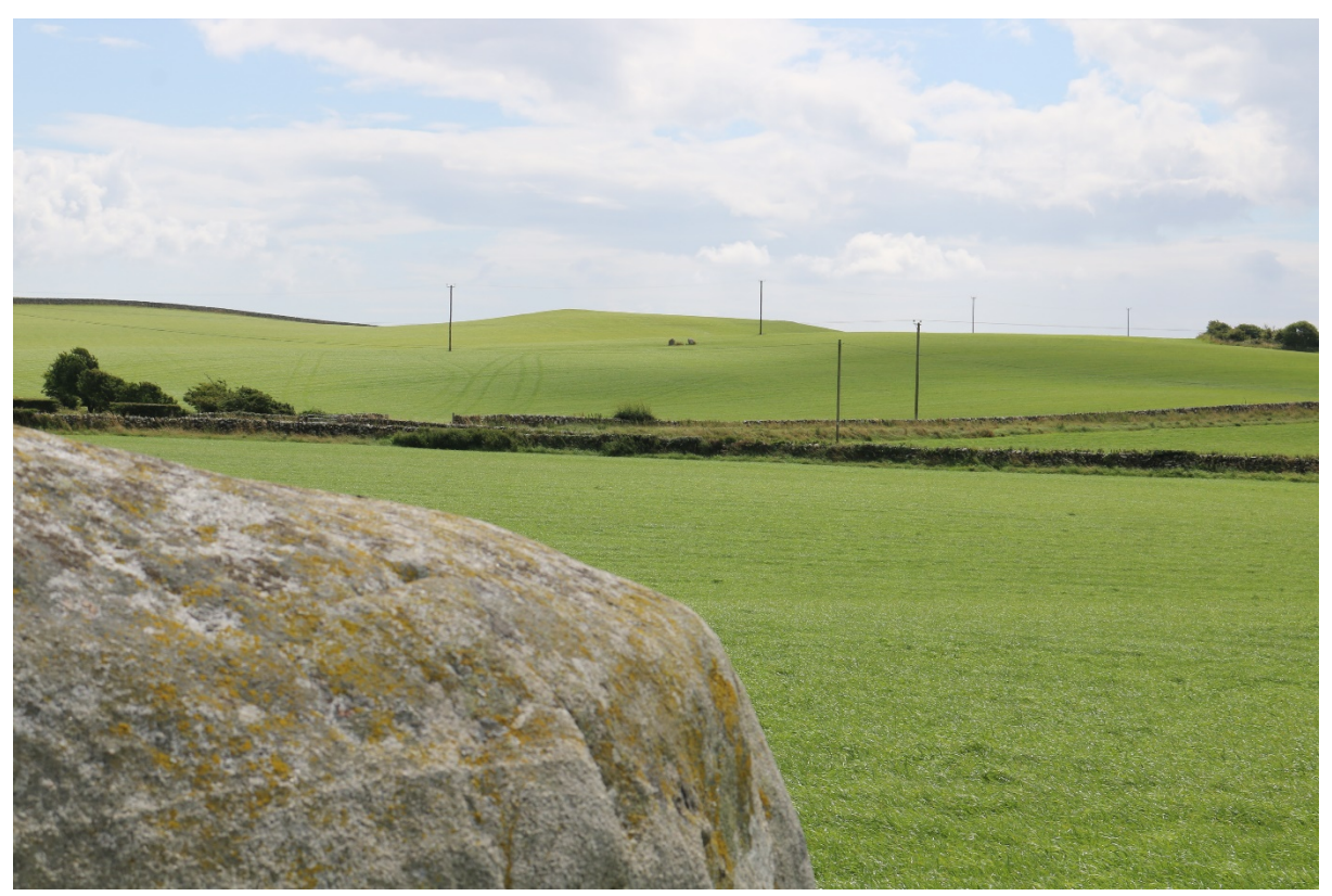
Figure 7: View from the Wren's Egg Boulder to the Milton Hill Stones which are included in the schedule SM90316 but not in the PIC boundary.

the cists could provide evidence about the inhabitants of the area during the Bronze Age.