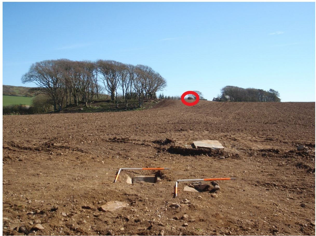
Figure 6: View of the cists in relation to the Wren's Egg. The Wren's Egg is further up the slope, highlighted by a red circle.