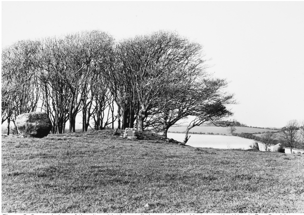
Figure 5: General view of the site with the small sign positioned between the Wren's Egg Boulder and standing stones.

Little work seems to have been carried out following the Wren's Egg entering state care; a small sign appears to have been erected at the Wren's Egg.<sup>29</sup> At the start of the 20th century the Office of Works planned to reconstruct the stone circle as made clear by a 1908 memorandum of a conversation between J Fitzgerald, Inspector with the Office of Works, and Sir Herbert Maxwell: