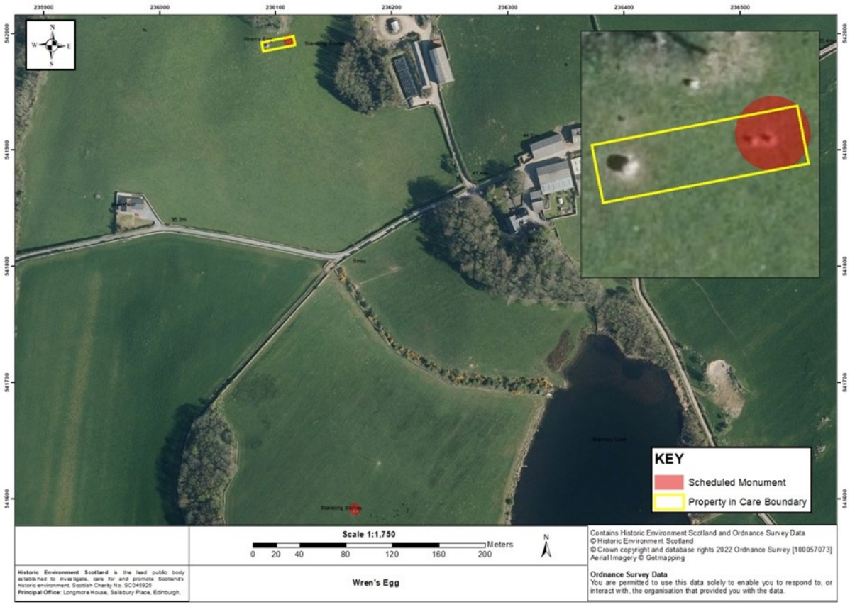
Figure 1: Wren's Egg Scheduled area and Property in Care (PIC) boundary. Image for illustrative purposes only. The Wren's Egg in Care area is at the top of the image and the Milton Hill Stones (not in Care) near the bottom. The insert shows a close-up of the PIC boundary.