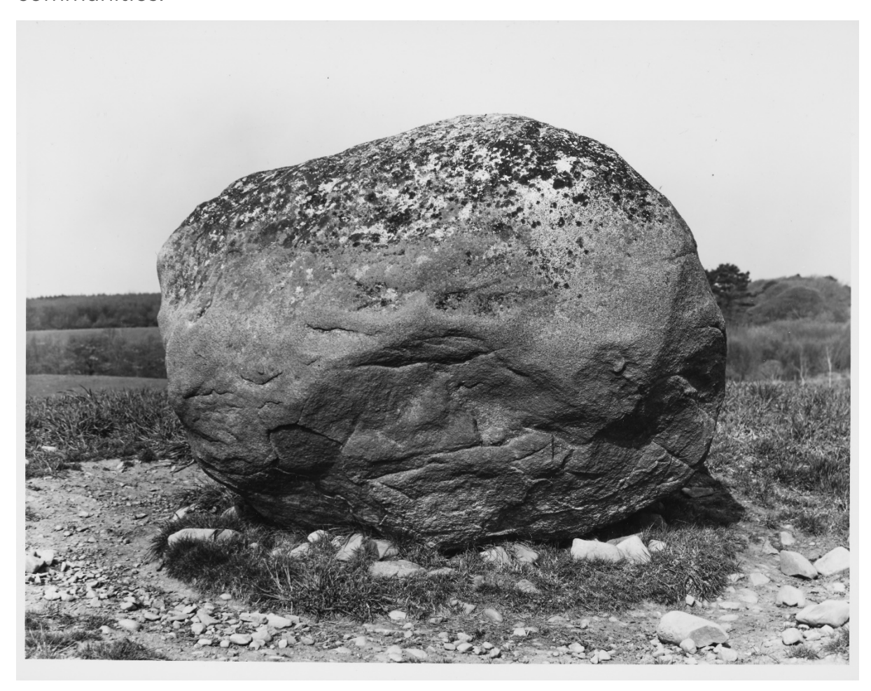
Figure 8: General view of the Wren's Egg Boulder. Photograph taken in 1958.

The Wren's Egg also contributes towards our understanding of the development of the (now) Historic Environment Scotland estate. Its association with Pitt-Rivers and the mechanism through which it was brought into state care, along with more recent research on the subject, has helped to highlight how sites were valued not just for the historical or archaeological importance but also through their value to local communities.