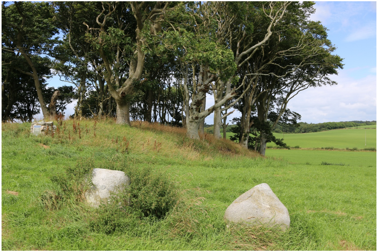
Figure 3: The Wren's Egg Stones. The eastern stone has a triangular form while the western stone is flat topped.

Williams saw small stones as equals to the larger megaliths, carrying out the same role and located and erected with the same level of care and attention, however Gillings questioned why miniaturise in the first place, and does not see them as equal, especially when there is observable patterning between large and small.<sup>14</sup>