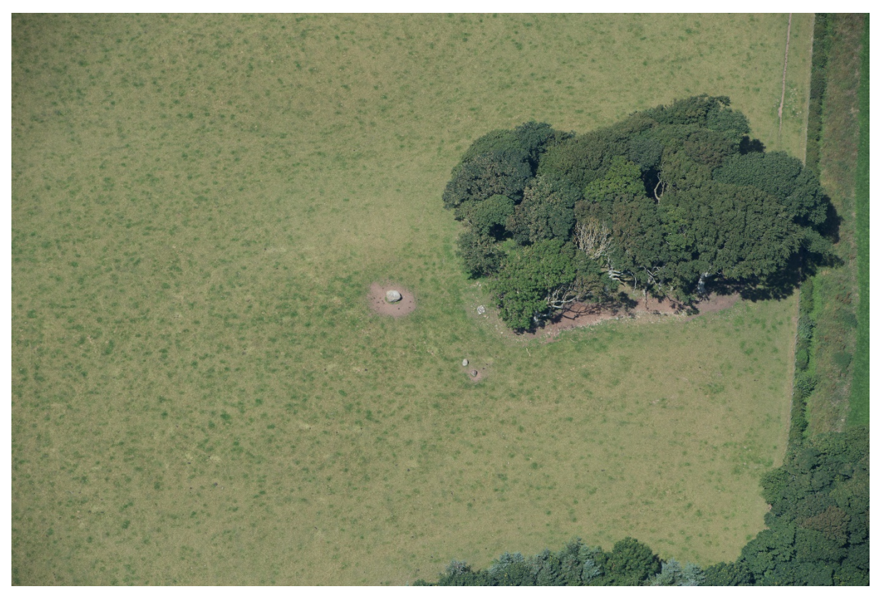
Figure 10: Aerial view of the Wren's Egg with the cope of trees to the north of the boulder known as the Wren's Nest.

The small patch of woodland to the north of the standing stones is referred to by some observers as the Wren's Nest.<sup>55</sup> The woodland has been present as a backdrop to the monument since it was first recorded by the Ordnance Survey in the mid-19th century but is not shown on the 18th century farm plan.