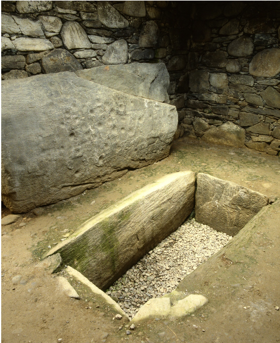
Figure 3: Inside Nether Largie North, with the capstone of the cist propped against the wall, revealing the rock on its inner face.

What is present at Nether Largie North Cairn today is largely a reconstruction based on excavation evidence. There is a modern internal chamber at the centre of the cairn, accessible from the top, constructed so that the cist and carved stones can be seen.