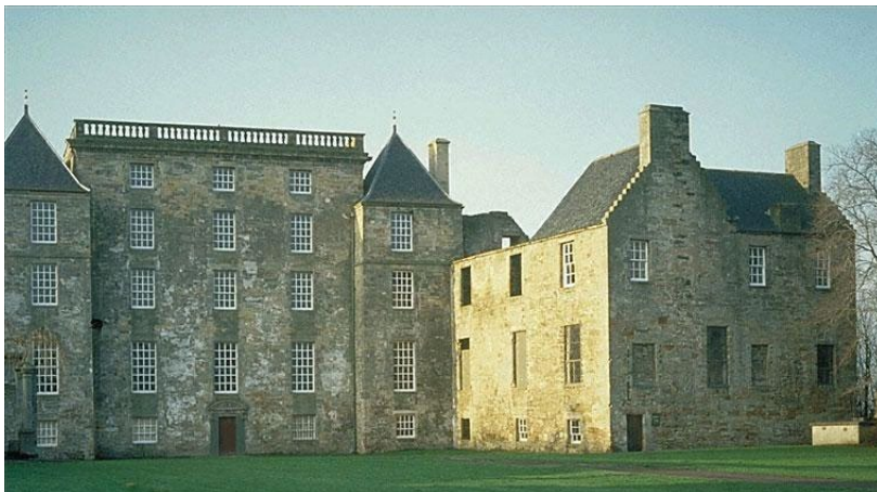
a) Kinneil House east elevation

The site chosen is a place whose importance was established centuries prior to the building of Kinneil House for it lies directly beside the line of the Antonine Wall, and the place-name Kinneil is understood to mean “head (or end) of the wall”. This position (along with Abercorn) of marking the head of the wall led to its being one of the earliest settlements in Scotland to be specifically mentioned in surviving written sources (Bede in 731 AD), while the existence of the Kinneil Cross indicates it was also a religious site of some 3 importance in early medieval times.