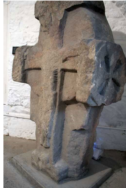
e) Kinneil Cross

A full Timeline for the property from Roman times is given at Appendix 1, but a few key dates particularly relevant to the Hamiltons at Kinneil are summarised below: