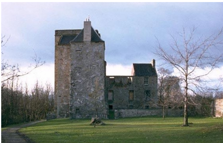
b) Kinneil House south elevation