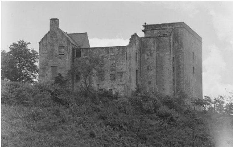
c) Kinneil House from the north (1940)