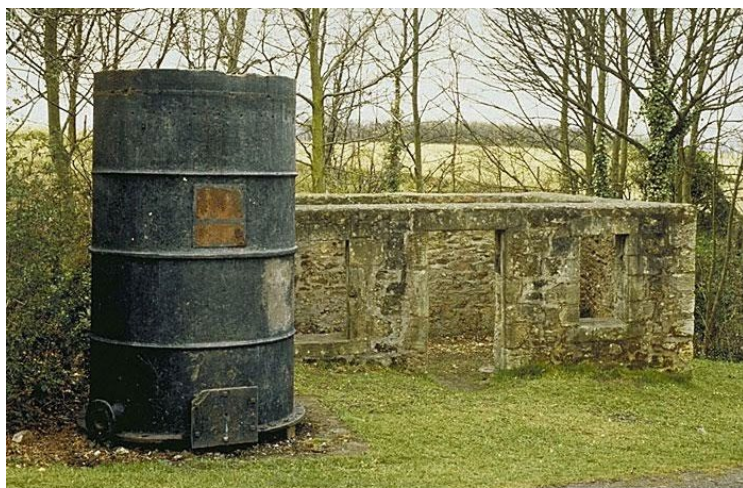
f) Kinneil Watt 'cottage' and boiler

From the moment you turn through the gates on to its long approach avenue, Kinneil appears as a splendid seventeenth-century mansion, with a symmetrical main façade and formal courtyard, flanked on one side by a neat forward-projecting wing. Walling on the opposite side of the courtyard and raggles on the wall of the main block indicate that another flanking range of similar design was intended to complete the house's