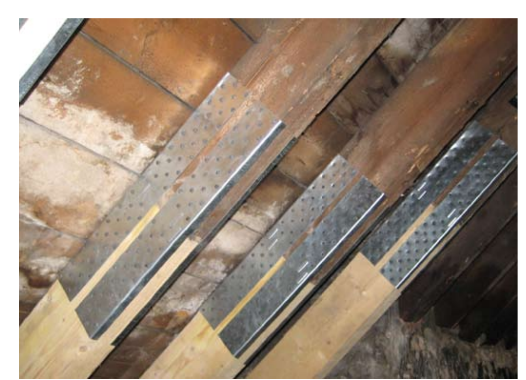
Modern metal pre drilled straps used in rafter splices.

Most rooms had fireplaces, and a special arrangement was required to carry the projecting hearthstone without having joists terminating under the hearth. In this case a "trimmer beam" was fitted at right angles to the joists, parallel to the line of the hearth. Deafening boards were fitted and packed with cinders or clinker, and the hearthstone laid on top. The floorboards were then laid flush with the hearthstone. A raised hearth stone is modern practice.