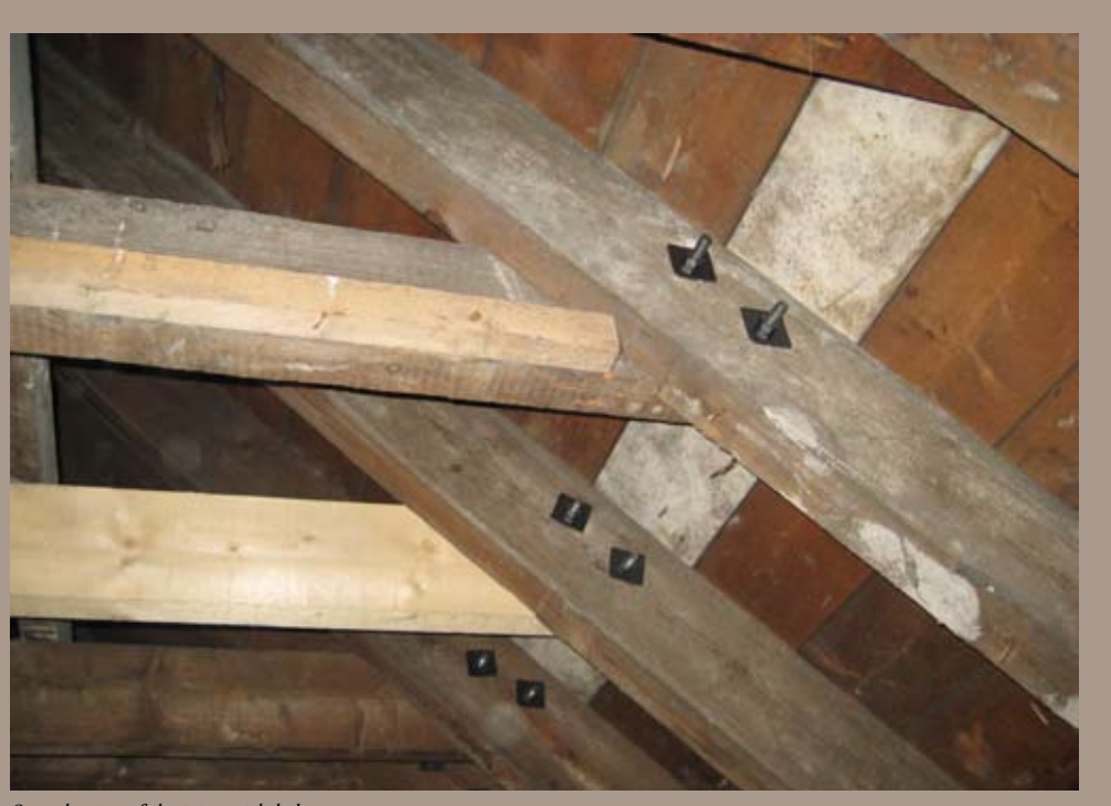
Strenthening of the joint with bolts

Structural joinery elements make up some of the key parts of a traditional building and their correct function is of crucial importance. Structural joinery refers to the timbers which form the roof and floor construction, and this INFORM will cover the survey, inspection and repair options and principles associated with work on these elements of a traditionally built property.