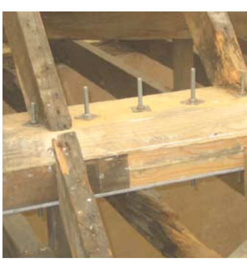
Composite repair using resin, new timber and steel plate

While some repairs may appear self evident, it should be remembered that as timberwork of such size is structural, a structural engineer with conservation experience may be required, especially on larger projects.