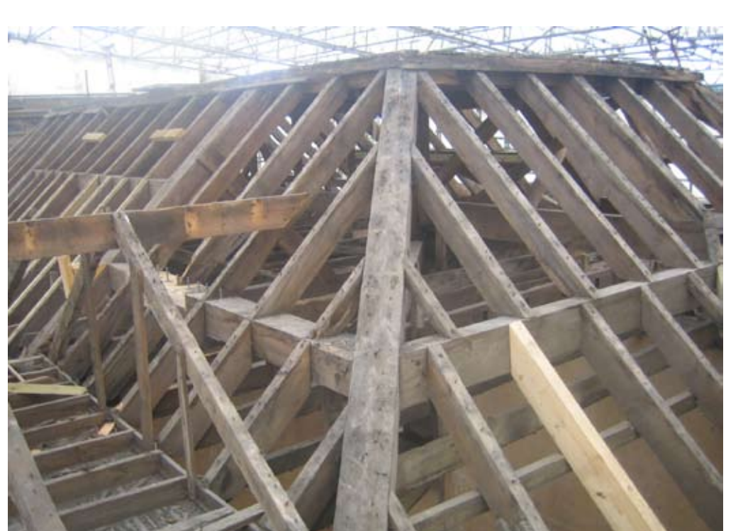
A\ roof\ of\ the\ Late\ 18th\ under\ repair,\ showing\ the\ purlins\ midway\ in\ the\ span.

In some earlier roofs, the A-frames are fewer, and joined longitudinally by timbers called purlins, shorter and smaller rafters then carry the roof. As the rafters have to carry more weight, they are referred to as principal rafters. This type of roof became rare by the 19th C, and standard A frame