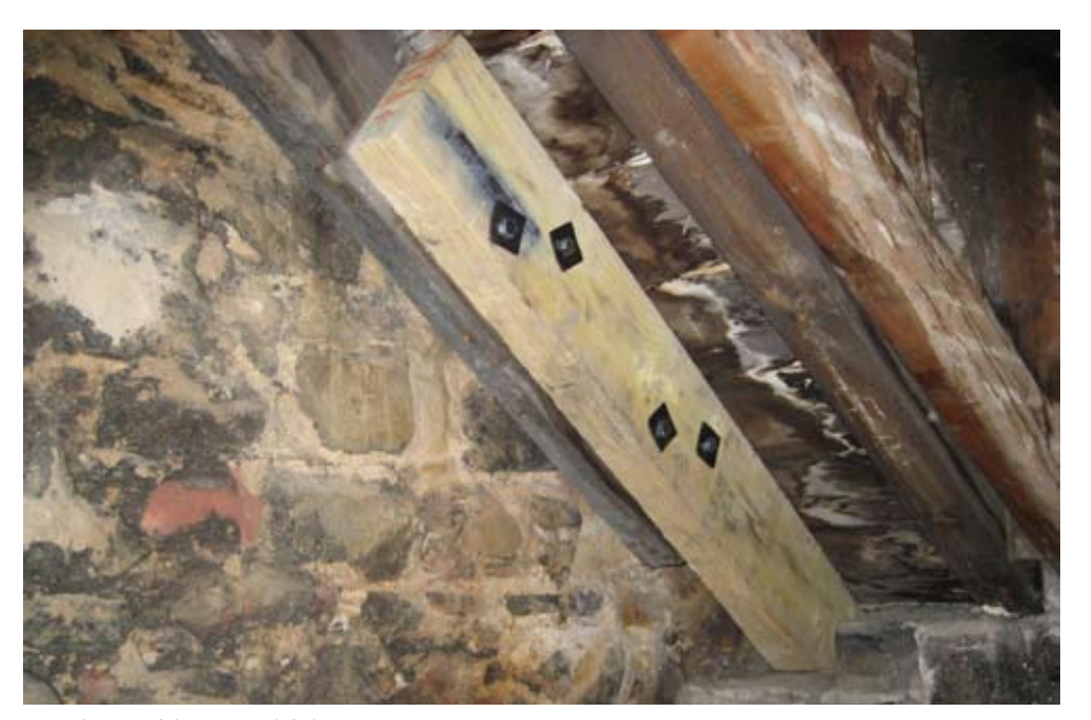
Strenthening of the joint with bolts

Sometimes, where wall repairs prevent the joists being located in the wall, joist hangers can be used, keeping timber away from a wall, which even after repair, may remain damp for several months.