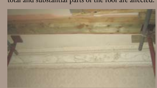
Supporting a ceiling during work on the joist ends

Due to the orientation of roofs, decay tends to be more pronounced on the Northern pitch of a roof, as there is less warming and drying by the sun, with timber consequently at a lower temperature – and water, from condensation or leaks, tends to linger longer. In such cases, the timber is decayed by various types of rot, and the element settles, distorting the structure and leading to further ingress. Eventually failure is total and substantial parts of the roof are affected.